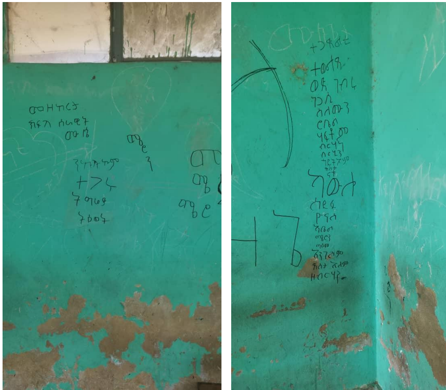
Writing on the wall of the Ewket Chorra school in Kobo, in the Amhara region of Ethiopia, says "Memorial of Moses Division. For all Tigrayans, (Tegaru), Tigray will prevail". The school was being used as a military camp by Tigrayan forces when they controlled the town last year, and was left ransacked and vandalized.