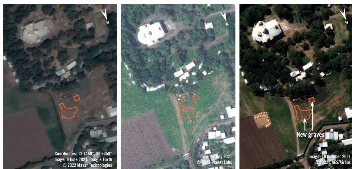
A time series of satellite imagery shows the increase in graves at St. Michael's church graveyard, where witnesses told Amnesty International some of those summarily killed on 9 September were buried. On 9 June 2021, new graves are not visible. On 29 July 2021, imagery shows a small area of possible disturbed earth but it is not clear if they are graves. On 19 October 2021, imagery clearly shows an increase in graves.