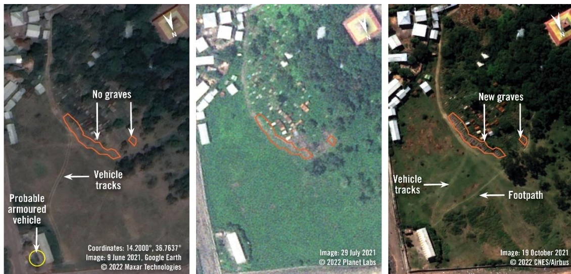
Satellite imagery from 9 June, 29 July and 19 October 2021, shows the St. George's Church graveyard area in Kobo, Ethiopia. On 19 October 2021, many new graves are visible that were not apparent in the previous imagery in the exact location where witnesses told Amnesty International they had buried some of the civilians summarily killed on 9 September.

Satellite imagery analysis by Amnesty International's Crisis Evidence Lab shows evidence consistent with new burial sites at the St George's and St Michael's churches compounds, where residents told Amnesty International that they had buried those killed on 9 September.