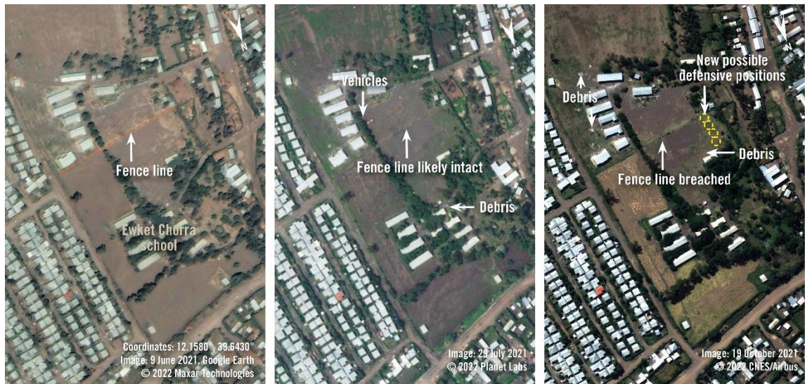
Satellite imagery from 9 June 2021, shows the Ewket Chorra school which according to Kobo residents was used as a military camp by Tigrayan fighters, who also ransacked the school. On 29 July 2021 debris is visible at the entrance to the school. By 19 October 2021, the fence line between the school and the southern compound appears breached. There is new debris throughout both compounds and new possible defensive positions visible on the school side of the fence line. (The school was also used by government forces before and after the presence of Tigrayan forces in Kobo, according to Satellite imagery from November 2020 and to witnesses in early February 2022)