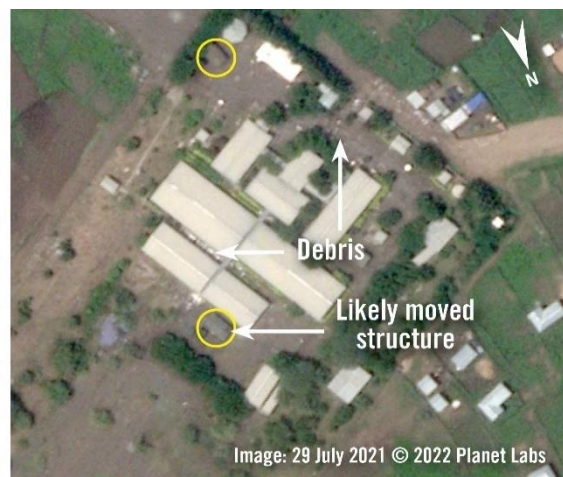
Satellite imagery from 9 June and 29 July 2021 shows the Kobo hospital. On 29 July, debris is visible in the area consistent with reports that the hospital buildings had been ransacked.