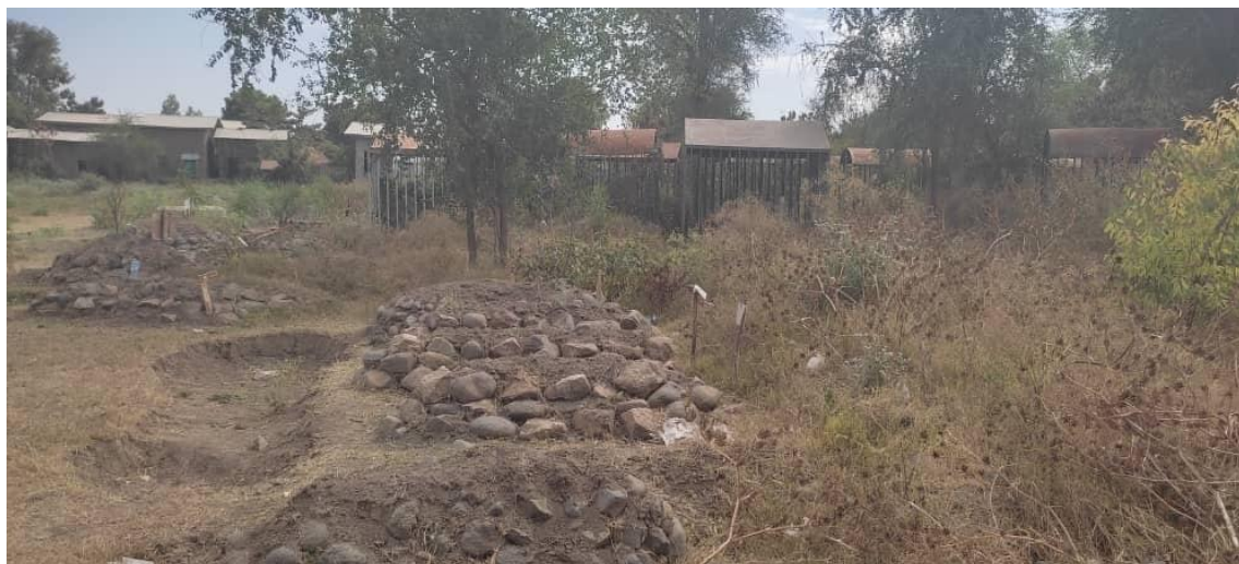
New graves in the St. George's Church graveyard in Kobo, Ethiopia, where witnesses and survivors told Amnesty International that they buried those summarily killed by Tigrayan forces on 9 September 2021.

At first when we wanted to bury the bodies on Friday morning (10 September) the Tigrayan fighters did not allow us. My mother was crying and she told them, "then kill me like you killed my sons," and a fighter kicked her, but then another fighter came by in a 4x4 vehicle and told the others to let us bury the dead. 27