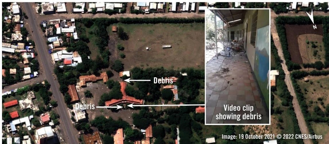
Satellite imagery from 9 June and 19 October 2021 shows St. Joseph's School. On 19 October 2021, small areas of debris are visible consistent with a video showing areas of the school ransacked and with residents' testimonies. The debris may have been present on 29 July, but the resolution of the image is not high enough to see the subtle debris. Video source: Uploaded 14 December 2021, https://www.facebook.com/watch/?v=598507934537401 , accessed 4 February 2022. (The 9 June image shows the presence of many lorries, buses and military trucks, indicating the presence of government forces and/or allied militias around the school prior to the arrival of Tigrayan forces in Kobo. Government forces were also using the school in early February 2022 according to witnesses).