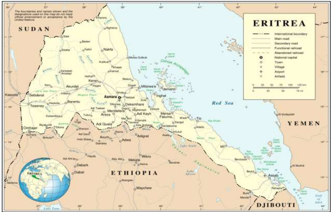
Map of Eritrea. ©MAPS OF.NET