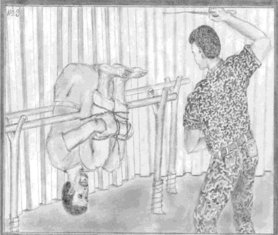
Torture technique used by the policeman during interrogation

“The interrogation was to know why the person was trying to cross, how they organised it, how many people were involved in the attempt. If people were crossing together, we would interrogate them until their accounts were in agreement. Sometimes we would use torture to extract the information. We used a method where you tie the arms around the ankles and place a pole under the knees and over the elbows. We would then suspend the person upside down, and beat [them] on the soles of the[ir] feet.” 175