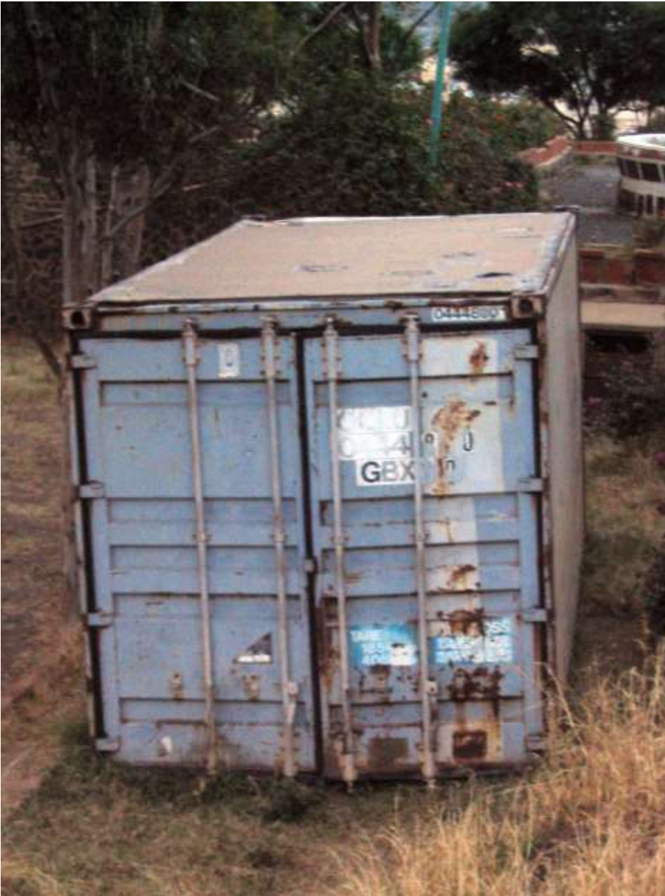
An example of a shipping container used by the Eritrean government for detention