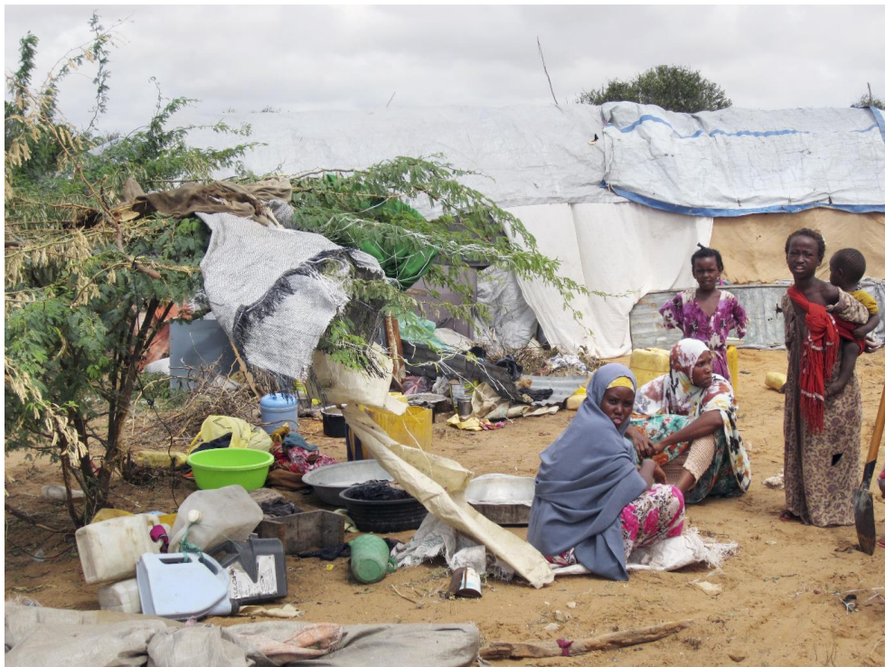
Women and children in IDP camps in Mogadishu

“The future is dark for us, no-one knows what will happen” (Halima, 45)