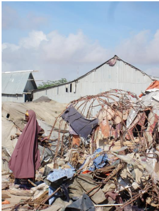
A female IDP dismantles her shelter, Mogadishu, Somalia, August 2013.

Lack of formal and clear land agreements for sites allocated for the use of camps for internally displaced people, including on the ownership and use of the land, could be disastrous to any relocation and could perpetuate or exacerbate insecurity.