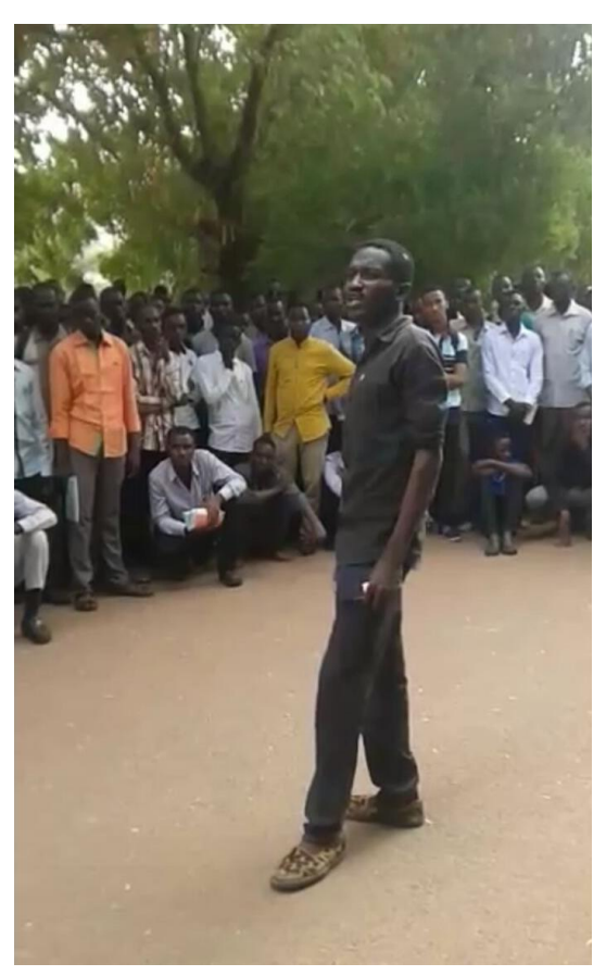
Darfuri Students' Association public forum discussing tuition fees in October 2015 at the Holy Quran University

The Darfur Students' Association issued a statement rejecting the new policy and argued it was a u-turn from the prior commitment made to exempt Darfuri students from paying fees. It also stated it would organize a sit-in protest until the universityreinstated the fee waiver. The peaceful sit-in started on 13 October 2015 around 8 am, at the university's Al Thoura Block 1 Campus. About 500 students participated. Members of the Darfur Students' Association distributed a statement and delivered some speeches objecting to the imposition oftuition fees. Around noon, the sit-in was attacked by 70 to 100 individuals composed of ruling party affiliated students, the police and NISS agents. 79 A member of the Darfur Students' Association told Amnesty International: