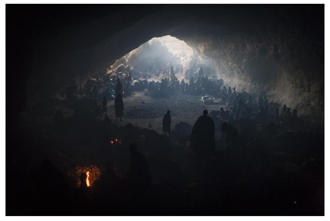
Hundreds of women and children seek shelter in a cave from the bombing by government forces outside of the town of Sarong in Jebel Marra in Central Darfur, Sudan, March, 2015.