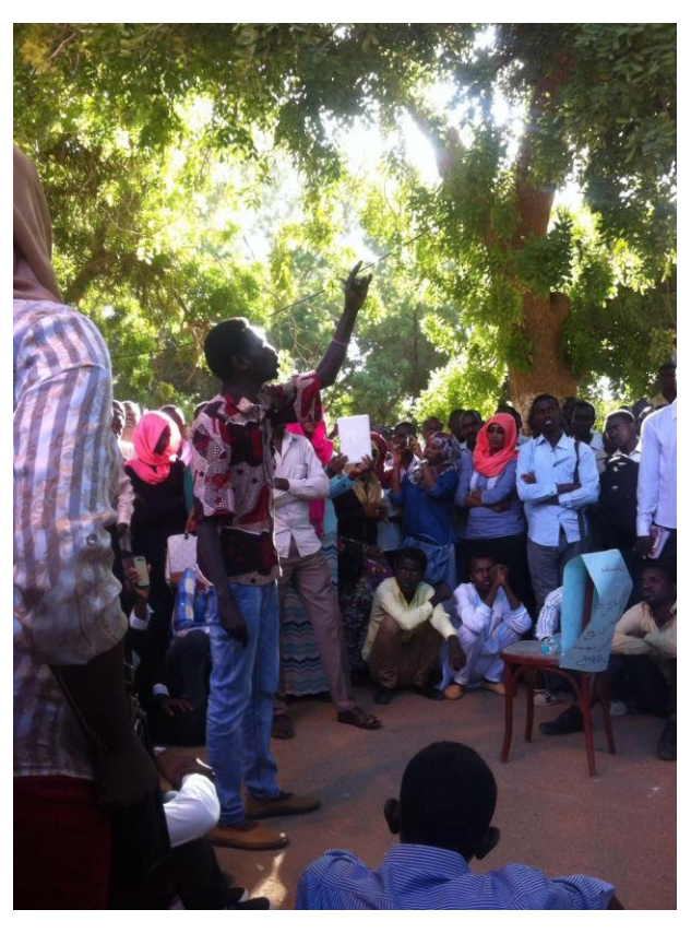
Student forum at the University of Khartoum to address attacks on Darfuri Students, 10 Dec 2015.

However, in its efforts to dominate the political sphere since 1989, the regime of the current ruling party has gradually dismissed thousands of civil servants, including teachers, judges, engineers, medical doctors, university professors and army officers. 48 Sudanese universities were not spared in this quest for domination. Today, all university Vice-Chancellors are appointed by the President.49 assisting in the transformation of these public institutions into political institutions and sacrificing academic independence. Student organizations now mirrors Sudan's political landscape, in particular the ideological divide between Islamists and secular liberals. Violent clashes between student organizationshave taken place intermittently over the past 48 years for a variety of reasons. The first recorded violent clash took place in 1968 between