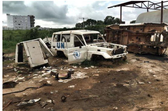
The looted WFP compound in Juba's Jebel neighbourhood. More than 4,500 metric tons of food was stolen from the compound, enough to feed about 220,000 people for a month.