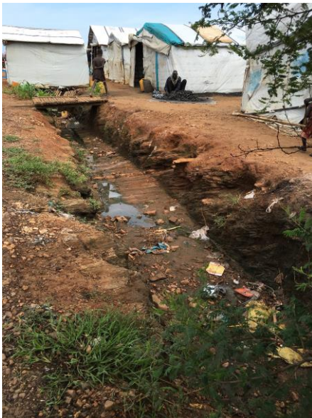
A drainage ditch in which dozens of people took shelter from indiscriminate fire at one of the UN’s protection of civilians sites in Juba’s Jebel neighbourhood.

Most egregiously, opposition fighters were reported to have entered the protection of civilians sites in Jebel several times on 10 and 11 July, at least once in large numbers. It is not clear whether in doing so the fighters intended to shield themselves from attack or impede military operations—which would constitute the war crime of using human shields—but regardless of their intention, the impact of such maneuvers was to endanger the thousands of civilians sheltering in the sites. By deploying in and around the protection of civilians sites, and by, in some cases, abandoning their weapons and taking shelter in the sites themselves, opposition forces also bolstered the perception that the sites serve as rebel sanctuaries.