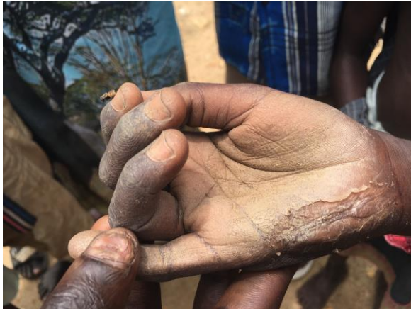
A woman showing where she ripped her hand on barbed wire while trying to flee from a protection of civilians site to the main UN base, after UN peacekeepers abandoned their posts during the July fighting.

On the morning of 12 July, displaced people said, a large number of uniformed men whom they believed to be UN police ordered them to return to the protection of civilians site. “They came out with megaphones and told us to return to the camp,” an elderly man told Amnesty International. “We insisted on staying; we didn’t know if the fighting was really over and we were scared. We asked, how can we return when people are being killed?”