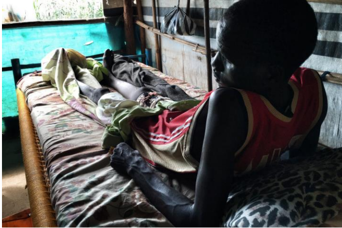
A Nuer man who was badly injured in the leg by indiscriminate fire on 11 July 2016 at one of the UN's protection of civilians sites in Jebel. More than a month after the attack, he was still recovering.