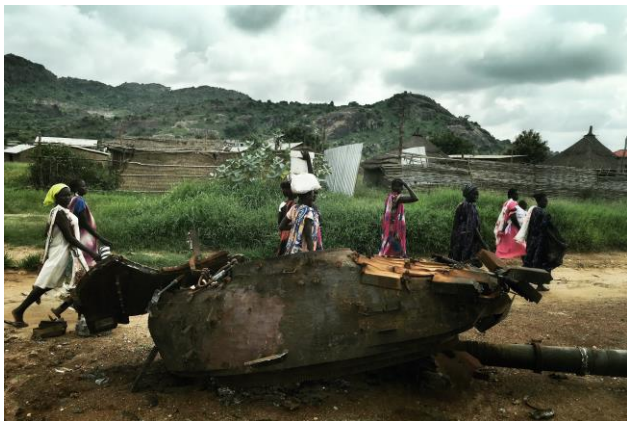
Women walking past a destroyed tank on Yei road, near the checkpoint where many dozens of women were raped by government soldiers in mid to late July 2016.

protection of civilians sites and the market. As described above, at least one such attack, on 17 July, allegedly took place as UN peacekeepers and private security personnel watched.