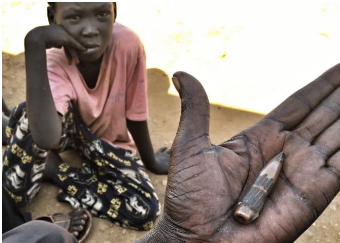
A child looks on as a traditional healer shows a high-calibre bullet that he removed from the stomach of a woman who was shot 10 July 2016 at one of the UN's protection of civilian sites.

Some victims survived despite suffering potentially deadly injuries. A 27-year-old woman was hit by two high calibre machine gun bullets at 9 am on 11 July, while she was inside her shelter in POC 3 preparing food for her family. 28 One round hit her in the leg, badly damaging the bone, the other hit near her heart. Brought to the clinic in POC 1, she was operated on by a traditional healer on 12 July without anaesthesia. Eight days later, she was operated on by a trained surgeon. When an Amnesty International delegate met her at the clinic in mid-August, she was still extremely tired and confined to her bed, though beginning to heal.