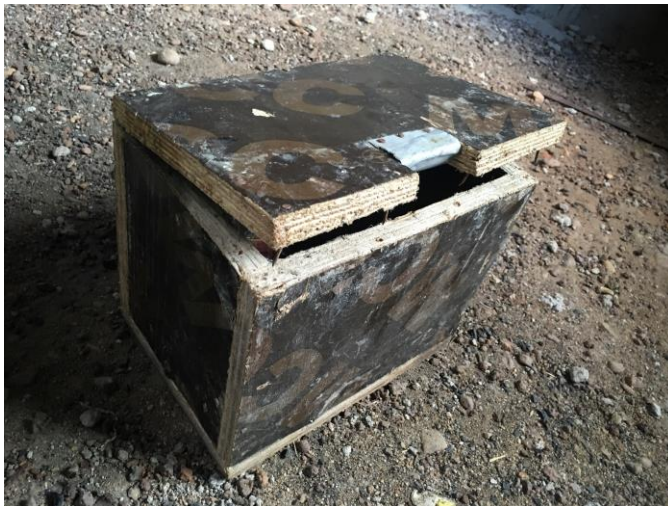
An empty wooden savings box, broken into by government soldiers who carried out massive looting in the Munuki neighbourhood. The family that owned the box lost more than a year’s worth of savings.

The most dramatic single incident of looting was the systematic plunder of the immense World Food Programme (WFP) compound and Food and Agriculture Organization (FAO) compound in Juba’s Jebel neighbourhood, on the Yei road near the UNMISS base. More than 4,500 metric tons of food was stolen from the WFP compound, enough to feed about 220,000 people for a month. 53 In addition, numerous vehicles, generators, and other equipment were stolen, stripped, dismantled and destroyed. Thousands of files were scattered to the wind. A witness who visited the site on 13 July said he saw both government soldiers and civilians there “carrying away heavy-duty generators, parts of vehicles, food, and goods, getting fuel out of fuel tanks, and cutting tents with knives to take them away.” 54 The scale of the pillage and destruction was so enormous that it could not have been done without, at a minimum, a large degree of command acquiescence; too many troops and vehicles were needed to transport the looted goods.