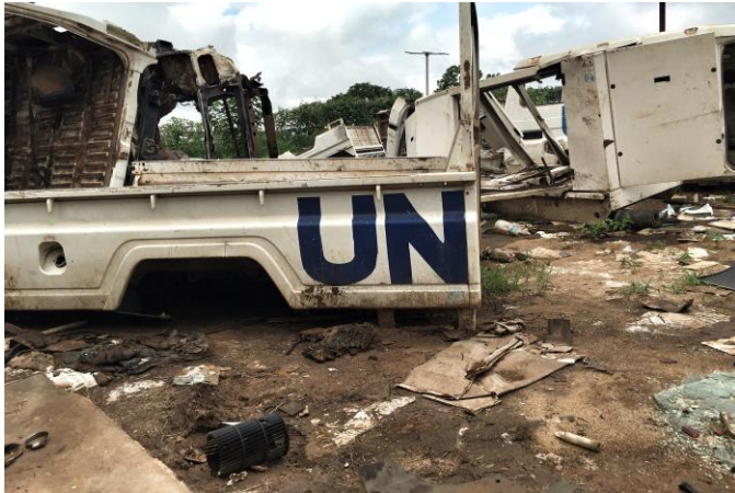
The looted WFP compound in Juba's Jebel neighbourhood. More than 4,500 metric tons of food was stolen from the compound, enough to feed about 220,000 people for a month.

"I personally witnessed the looting in Customs market," a local journalist told Amnesty International. 57 He visited the area on 11 July at about midday. "There were soldiers in uniform breaking into the shops ... The soldiers would shoot in the air to scare away boys so they could loot themselves. You could see people in uniform holding generators or bags. At that time, they knew that no one could stop them."