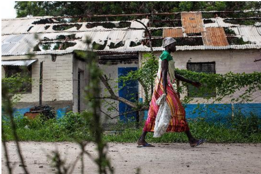
A woman walks on 7 July 2014 past one of the buildings of the Leer Hospital that was burned during the fighting. Hundreds of thousands of people were cut off from critical, lifesaving medical care after the Leer Hospital, run by Médecins Sans Frontières (MSF-Doctors Without Borders), was ransacked and destroyed between the final days of January and early February.

South Sudan, with support from international donors, must take steps to increase the availability, accessibility and quality of mental health services for survivors of sexual violence.