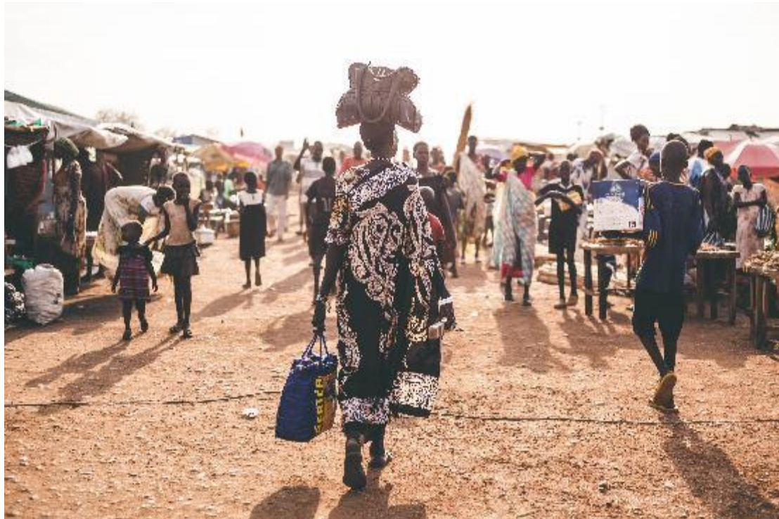
A woman carrying luggage on her head walks through the Protection of Civilians site in Juba, South Sudan.

Most of the cases investigated for this report involved rape or gang rape of women and girls, which often lasted for hours and left victims with serious injuries – both physical and psychological. Some rapists aggravated their crimes by other acts of cruelty, such as mutilating victims with knives or raping them with objects such as sticks. Some killed their victims outright while others left them bleeding, seemingly indifferent to whether they lived or died. Elderly women, young girls, and pregnant women have not been spared.