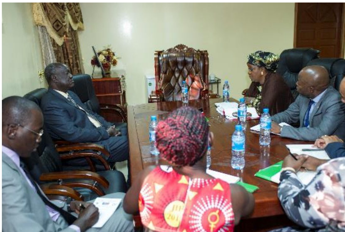
Zainab Hawa Bangura (top right), Special Representative of the Secretary-General on Sexual Violence in Conflict, meets with Kuol Manyang Juuk (top left), Minister of Defence of the Republic of South Sudan. Juba, South Sudan, 2014.