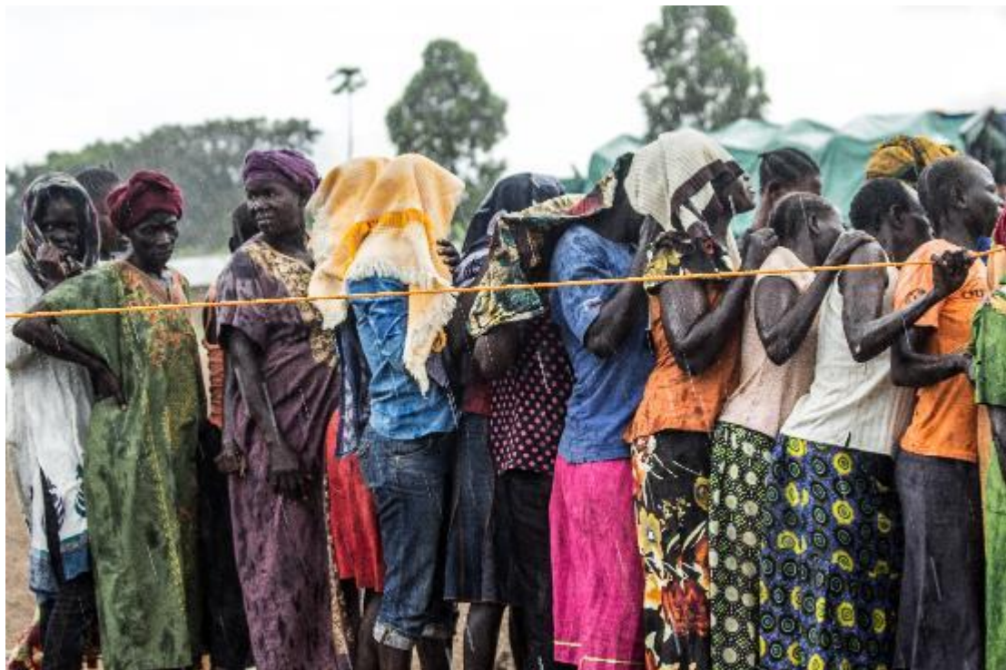
A group of women stand in the rain waiting to be registered and receive their refugee status at Kuluba collection point, Arua district, northern Uganda.

Both the incidents that occurred during the second civil war and the endemic levels of sexual violence during the current conflict can only be fully understood when placed in the longer-term context of gender dynamics within South Sudanese society. Sexual violence is facilitated by the overall status of women and girls in South Sudanese society as subordinate to men, and the resulting discrimination that they experience in their everyday lives. It is also motivated by patriarchal structures and gendered concepts of power which position men as “protectors” of women.