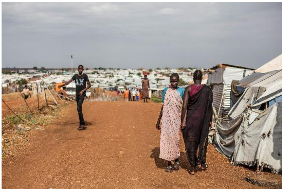
Women on arrival at the Protection of Civilians site 3 in Juba, South Sudan.

“We went together with the peacekeepers in a UN vehicle to pick her up. She died after four days as a result of her injuries while undergoing treatment in the IMC hospital.” 145