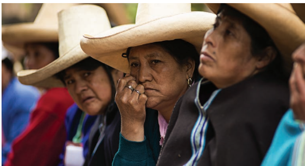
Members of the Women's Association of Huancabamba gather to discuss forced sterilizations, Huancabamba, Peru, October 2015.

measures to eliminate forms of discrimination, including treating men and women differently in order to overcome these inequalities. 142