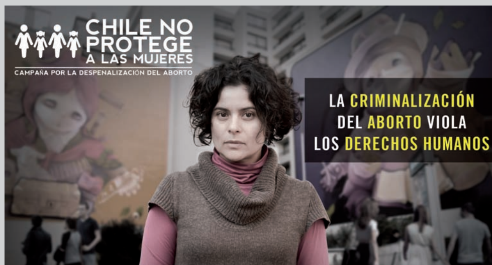
Image used by Amnesty International Chile for its campaign to decriminalize abortion.