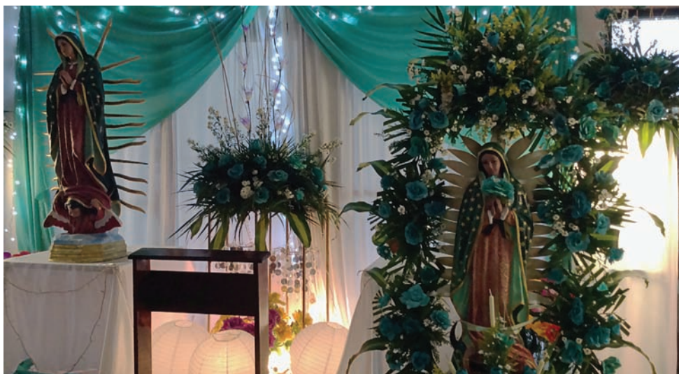
Altar with statues of the Virgin Mary in a public hospital, Veracruz, Mexico 2015.

This violence is inflicted on women and girls throughout the region by state agents who try to persuade them of, or in many cases impose, their own moral or religious beliefs or gender stereotypes. And they succeed in this by removing women's ability to decide for themselves, according to their own convictions and circumstances, what is best for them.