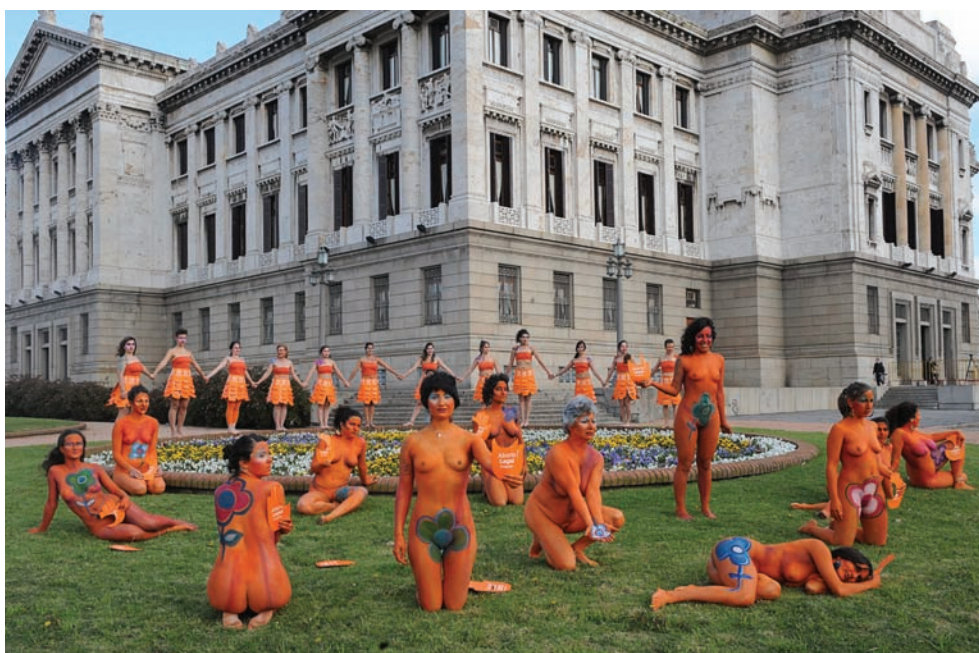
Women's rights activists protest in front of Parliament to demand the decriminalization of abortion, Montevideo, Uruguay, 25 September 2012.

The World Health Organization states that in the field of sexual and reproductive health, conscientious objection acts as a barrier to certain health services to which women have a right. 130 It emphasizes that in cases of access to abortion it is a unique barrier because it pits the right of a woman to life and health against that of the medical professional to act according to their conscience. This is because conscientious objection in health services seeks to challenge or change a rule or a public policy and has implications for the provision of health services and the protection of the rights of third parties. 131 In addition, conscientious objection in the fields of reproductive health tends to have discriminatory effects, because it affects almost exclusively or disproportionately women and girls of reproductive age.