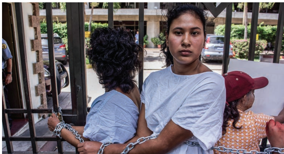
Women's rights activists protest in front of the Supreme Court, to demand the decriminalization of abortion, San Salvador, El Salvador, 15 May 2013.

There are many examples of these "other forms of violence" to which women are subjected. In turn, each of these forms generates a new violation of human rights such as the right to life, integrity and health, and to privacy and family life, among others; discrimination cuts across them all. The following section details some of the most representative examples from among the cases documented. However, these violations are systemic and widespread throughout the region.