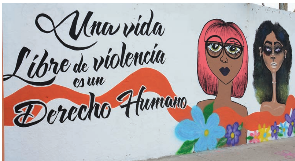
Mural created for International Day for the Elimination of Violence against Women. The mural reads: "A life free of violence is a human right". Veracruz, Mexico, 2015

In April 2015, the Public Prosecutor's Office reopened an investigation into the systematic practice of forced sterilization in the country as a grave violation of human rights. 44 At the time of writing, the investigation was continuing. In addition, in November 2015, the government began recording the names of victims of forced sterilization in order to provide them with psychological and medical support and to facilitate their access to justice, although so far, it has not provided them with comprehensive reparation. 45