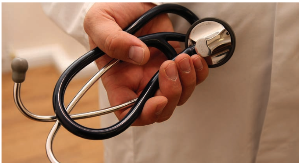
Doctor holding a stethoscope, 2012.