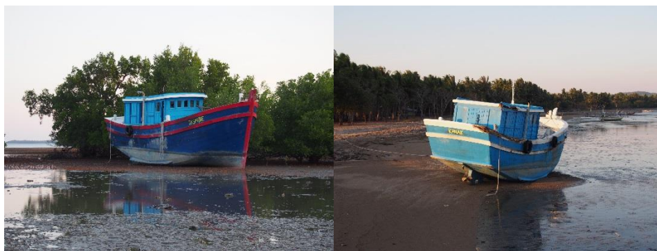
'Jasmine' (left) and 'Kanak' (right) having been towed to Rote Island by Indonesian officials, August 2015

Once everyone came on board Kanak, which was then even more overcrowded, the crew managed to steer the boat to Landu Island, another Indonesian island near Rote Island, where it struck a reef in the late afternoon on 31 May 2015. No one was injured or killed. Local people helped rescue them, and gave them food and dry clothes. Amnesty International delegates saw Kanak and Jasmine, which had been towed to Rote Island by Indonesian officials (see photographs).