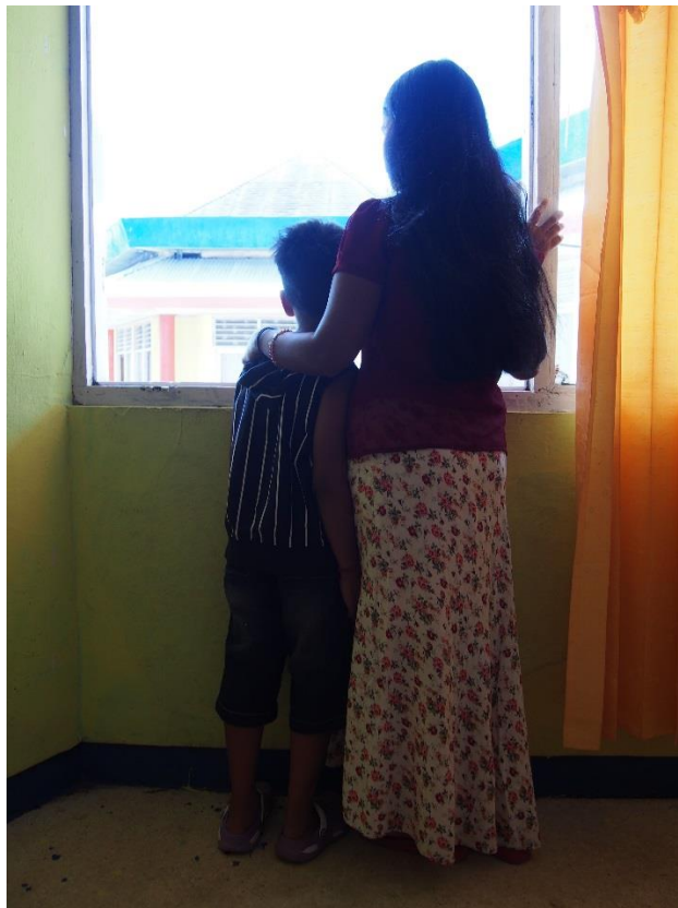
Asylum seekers in immigration detention in Kupang, East Nusa Tenggara after their boat was intercepted and turned back by Australian officials, August 2015

Letter to Amnesty International from the 65 asylum-seekers turned back by Australia in May 2015