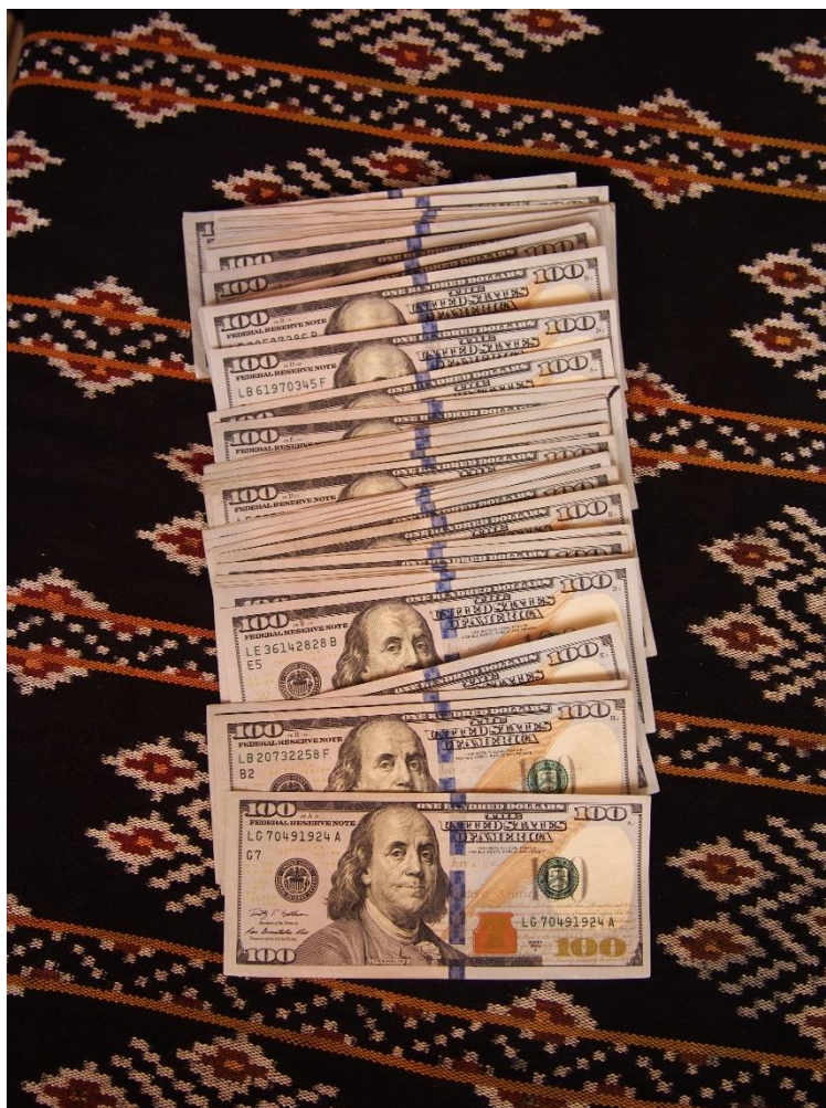
32,000USD which crew members told Amnesty International was paid to them by the Australian officials around 24 May 2015

The Indonesian police who detained the crew have confirmed publicly and to Amnesty International that the men had approximately 32,000 USD in their possession when they were apprehended. The police confiscated the money, and as of 19 August 2015, it was still in their possession. While on Rote Island in August 2015 Amnesty International researchers saw the money that was found on the crew, which consisted of dozens of new-looking 100 USD bills (see photograph), as well as a document listing the serial numbers of all the bills.