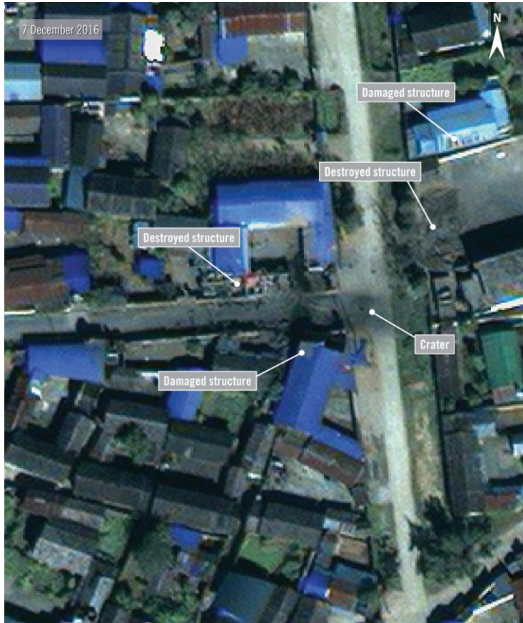
← © Imagery from 7 December 2016 shows a crater in the centre of Monekoe where many structures are present. Multiple damaged and destroyed structures can be seen in the imagery. Coordinates: 24.1007°, 98.3111° Image © 2017 DigitalGlobe, Inc.