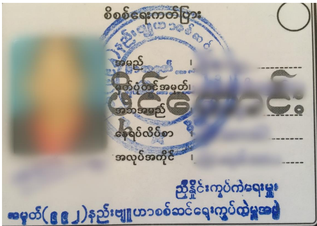
☺↑ A special identification card issued by Myanmar authorities in early 2017 to residents of villages between Pang Hseng and Monekoe towns. Anyone caught outside a camp or home without the identification card faced arrest and detention by the Myanmar security forces.

A Myanmar expert said that the ordered or de facto clearance of villages, and the pressure on local communities more generally, represented a continuation of abusive counterinsurgency tactics that the Myanmar Army has deployed for decades. 173 The impact these tactics have in terms of depriving people of their livelihoods are compounded by the restrictions on humanitarian access, discussed in detail below, and have dangerous medium- and long-term implications on people’s standard of living, including access to adequate food and their physical and mental health. 174