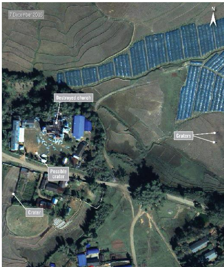
← © Imagery from 7 December 2016 shows a destroyed church in Monekoe, Myanmar. Multiple craters are visible in fields near the church. One possible crater is visible within the church compound. Coordinates: 24.1013°, 98.3206°