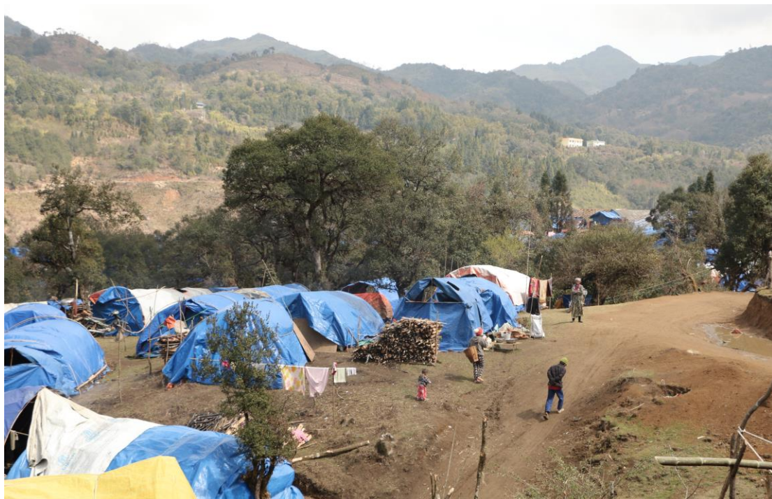
© ↑ Sha It Yang IDP camp, which houses more than 2,000 people displaced by the conflict. © Amnesty International

Humanitarian officials explained that access restrictions cause four specific problems for responding quickly to displaced peoples’ needs related to shelter, water, and sanitation. First, the restrictions make it harder for any organization to bring certain materials, like timber or bamboo, to NGCA. Second, since international organizations are denied access, the burden falls entirely on a few local organizations; given the demands, they are overstretched. Third, while international organizations can fund and help instruct local organizations on tasks like building water pumps or latrines, they are not able to inspect for quality assurance, as they normally would. 187 This lack of presence also affects protection monitoring. “It is hard for us to assess the situation, protection by presence is important,” said an international aid worker. “It needs to be official.” 188