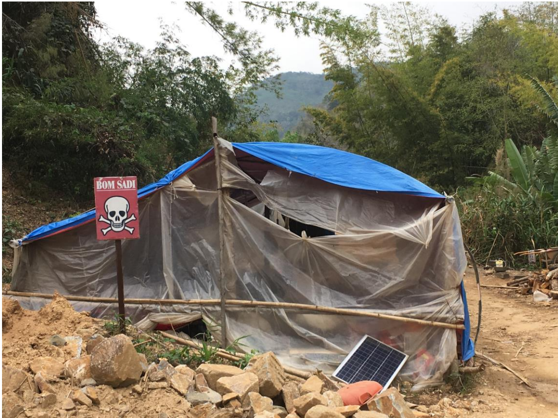
© ↑ Signs erected by the Kachin Independence Army warn of landmine-related devices in the area. The widespread landmine contamination in Kachin and northern Shan States, combined with poor demarcation and mine safety education, results in many civilians being injured or killed, simply when walking to their farms or along the road. © Amnesty International

The Myanmar Army and some ethnic armed groups have failed to meet these obligations, leading to civilians being killed or seriously injured simply while walking on roads or trying to work on their farms. Although Amnesty International delegates saw signs in KIO-controlled territory that warned of landmine-riddled areas, and heard of similar signs in specific parts of government-controlled territory, landmine-related victims, community leaders, and local humanitarian officials all said that such signs are in only a small percentage of areas where there are landmines or IEDs. Signs placed by the Myanmar Army are also typically only written in Burmese, which many people in the area, particularly from ethnic minorities, cannot read. 289