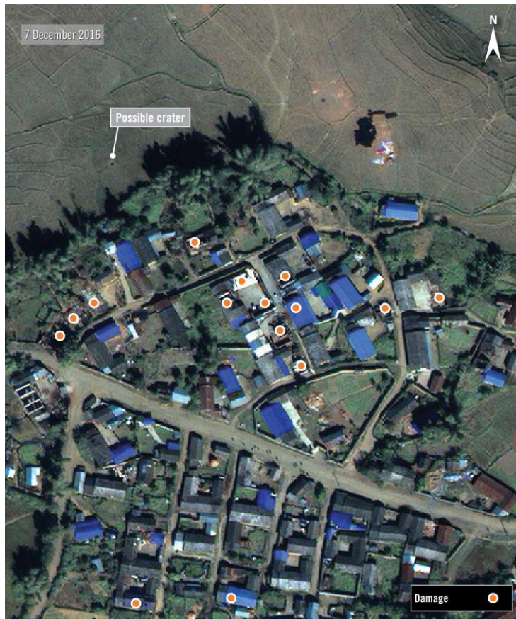
← ⓘ Imagery from 7 December 2016 shows many damaged or destroyed structures—pinpointed with orange dots—in Monekoe, Myanmar. A possible crater was also detected in a field north-west of the damaged structures. The damage and crater were not present a month earlier. Coordinates: 24.0996°, 98.3277°

Indiscriminate fire also contributes to mass displacement. A 25-year-old father of two children from Kong Ho village in Namtu Township said there had been fighting between the Myanmar Army and TNLA near their village on 5 May 2017. “Before the Tatmadaw went into the village, they used big weapons to shoot in[to] the area[.]” he told Amnesty International. “We could hear the ‘bombs’ for five minutes, and then we fled.” 130 He said six people, primarily the elderly, had been left behind in the village when everyone else fled. He worried that if fighting continued into Myanmar’s rainy season, it would be harder for people to flee their villages for short periods, a common practice in northern Shan State that helps protect civilians from harm. 131