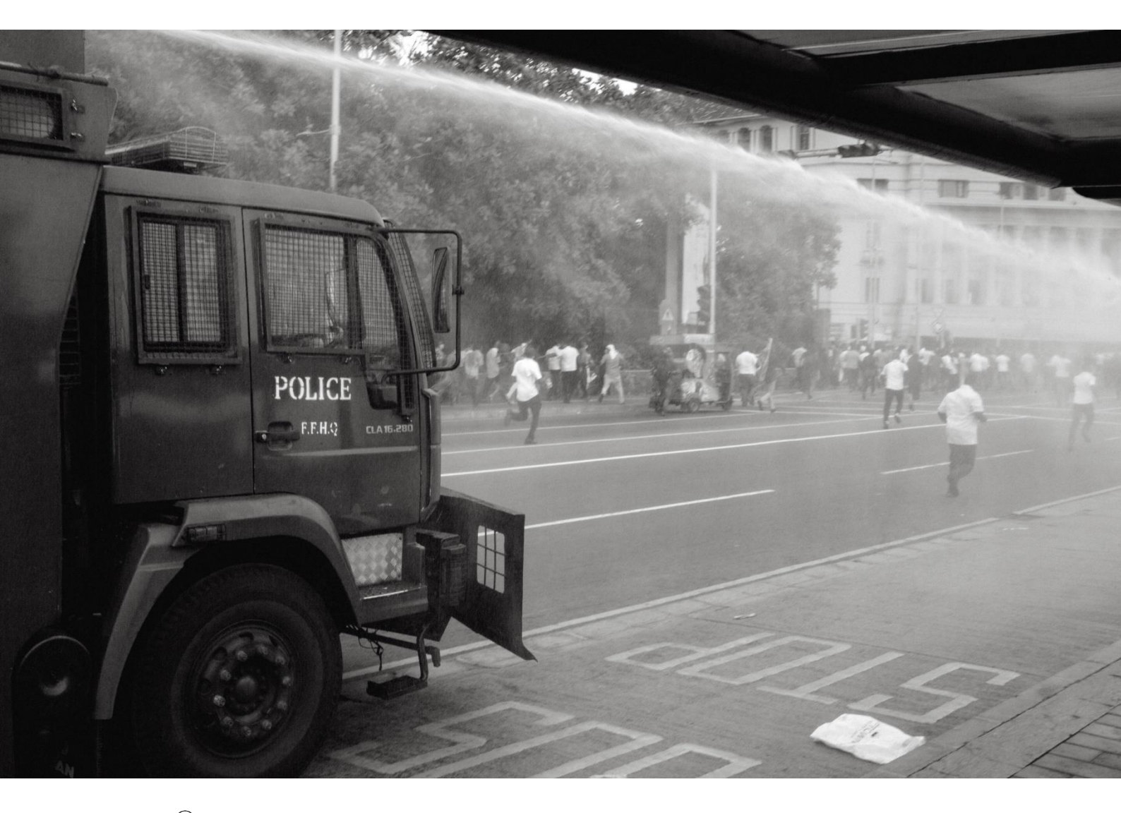
⊕ ↑ Security forces fire water cannons at protesters on Galle Road, in Colombo, on 9 May 2022.