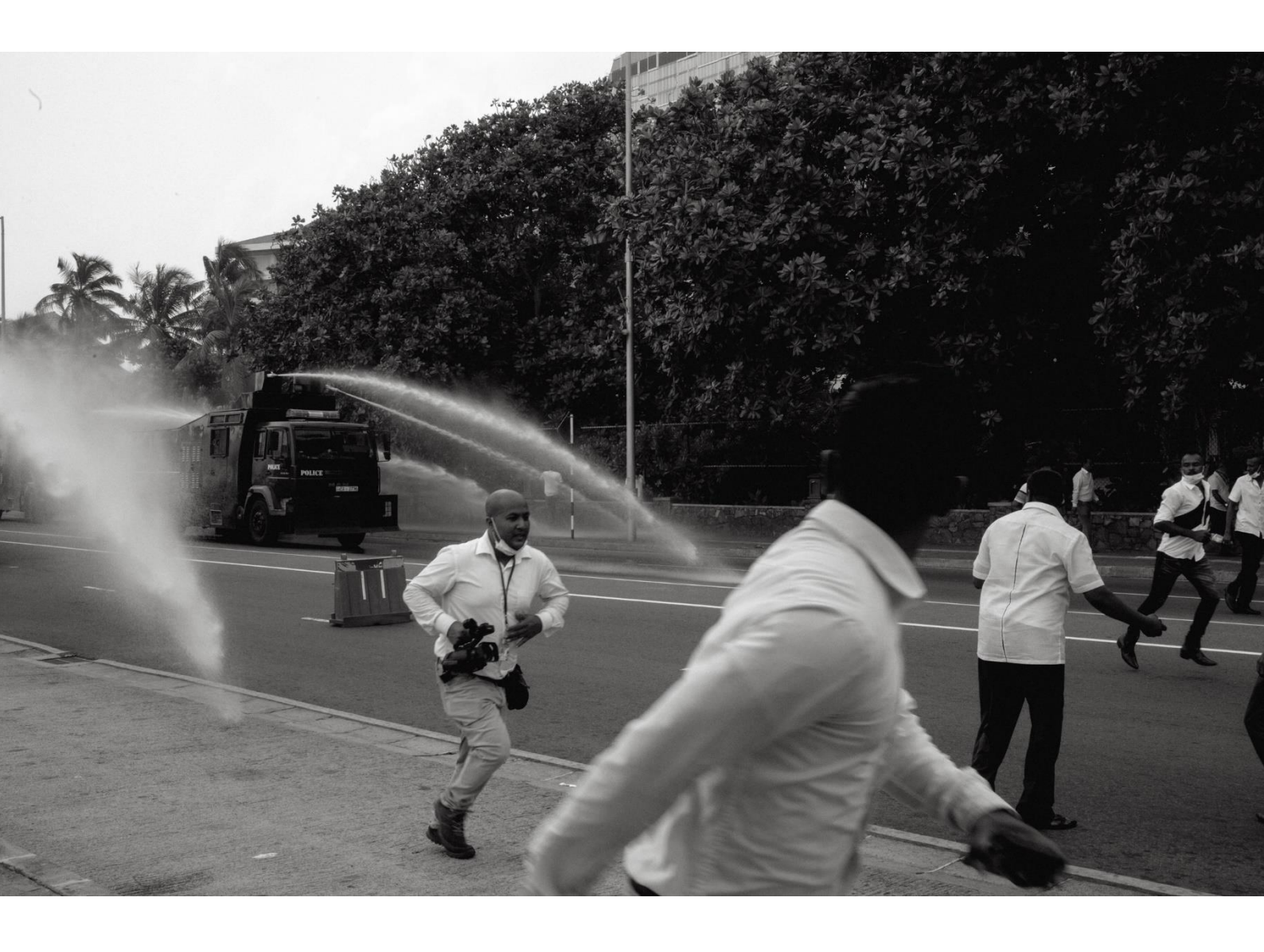
⊕ ↑ A reporter runs away from water cannons fired by security forces on Galle Road, in Colombo, on 9 May 2022.