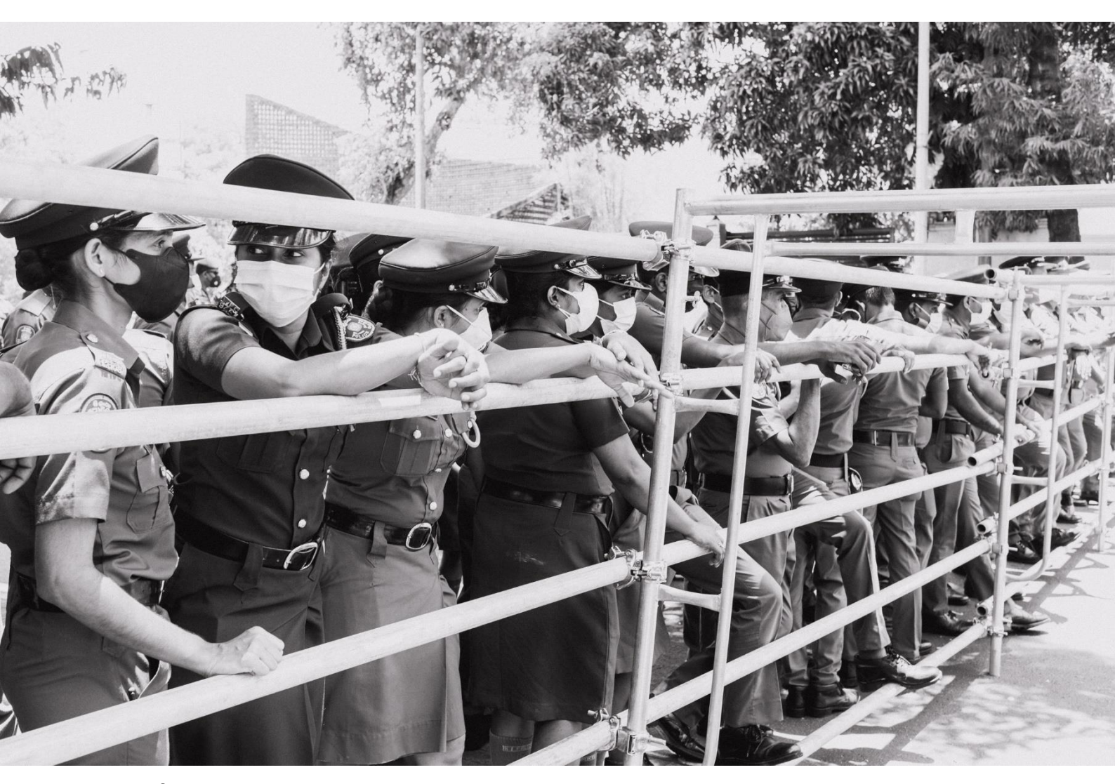
<sup>®</sup> † Police reinforce a steel barricade preventing protesters from accessing Independence Square to protest at Independence Avenue in Colombo, on 03 April 2022.