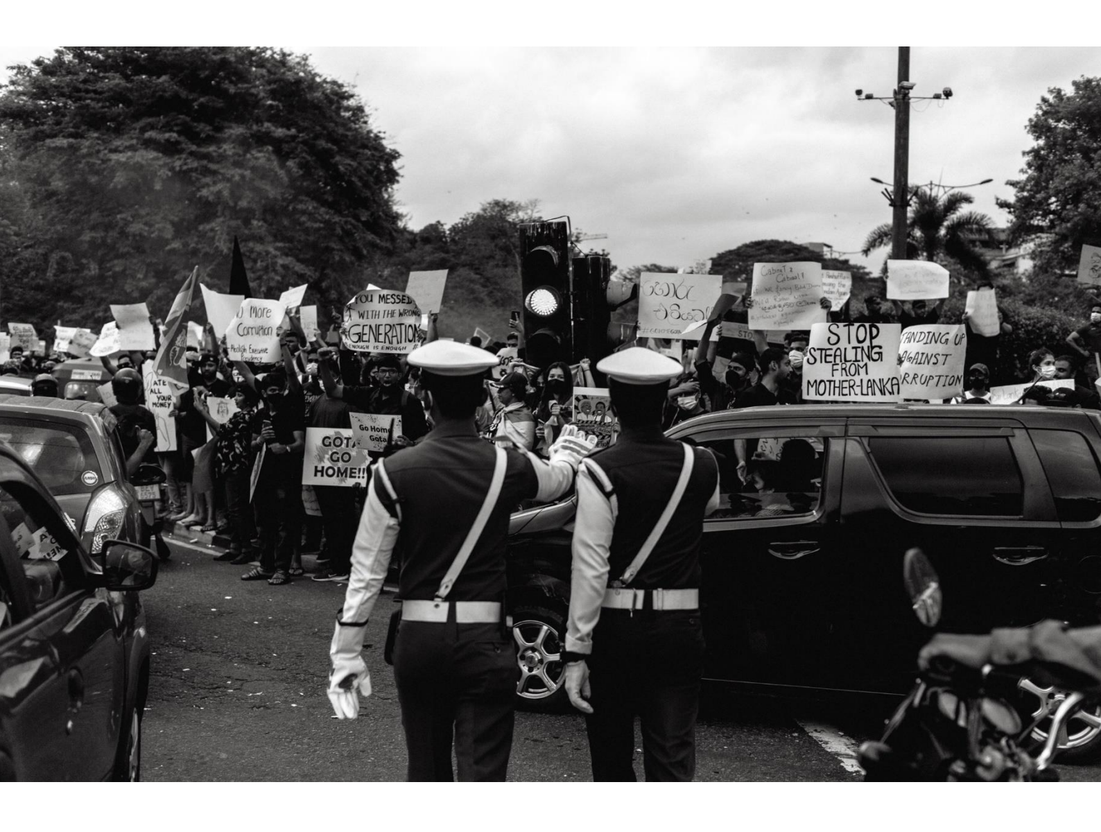
⊕↑Police help direct traffic during a peoples' protest at the Nelum Pokuna roundabout in Colombo on 4 April 2022.