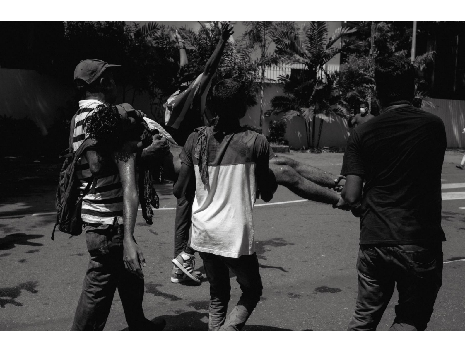
♠↑ An unconscious protester is carried away to an ambulance following clashes with armed forces outside the Prime Minister's office on Flower Road, in Colombo on 13 July 2022.