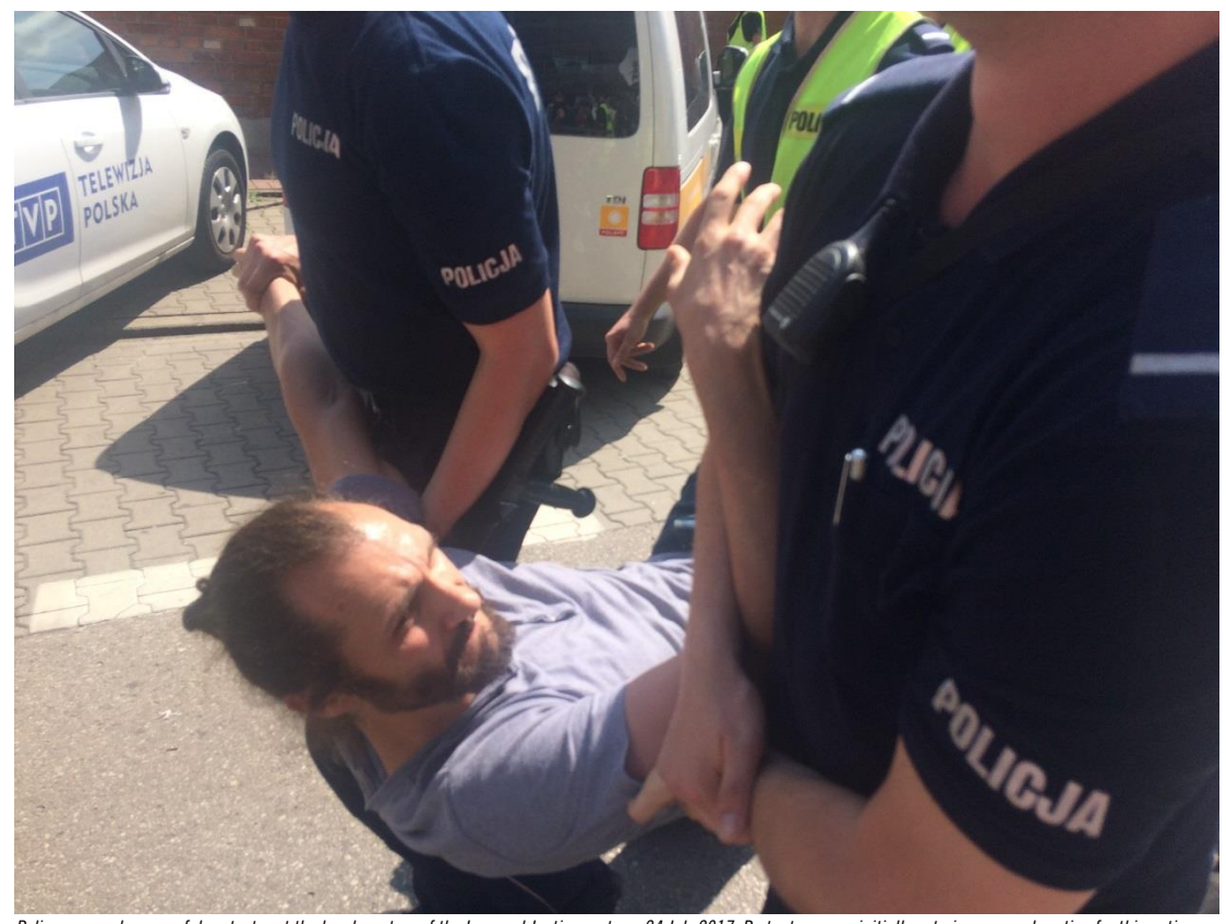
Police removed a peaceful protester at the headquarters of the Law and Justice party on 24 July 2017. Protesters were initially not given an explanation for this action against them and were held in police vans for about 90 minutes.

and only started to check their IDs about after 40 minutes. <sup>40</sup> This raises concerns over arbitrary deprivation of liberty that interfered with the protesters' right to freedom of peaceful assembly. Nine out of ten protesters held by the police during the protest on Nowogrodzka Street on 24 July filed a complaint against the police for unlawful arrest ( zatrzymanie ). <sup>41</sup>