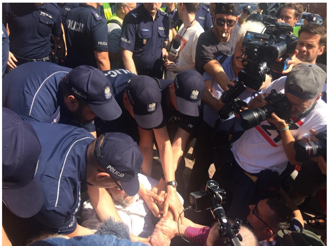
Police intervened in a peaceful spontaneous assembly at the headquarters of the Law and Justice party on Nowogrodzka Street on 24 July 2017. The assembly was not obstructing traffic and the police initially refused to provide grounds for the intervention against the protesters.

On 24 July during a spontaneous assembly at the headquarters of the Law and Justice party on Nowogrodzka Street, about 30 to 40 persons from a civil society group, Obywatele RP, and other groups held a protest under a banner that read "Free Courts, Free People". The protesters gave speeches with the use of a microphone with loudspeakers and a megaphone.