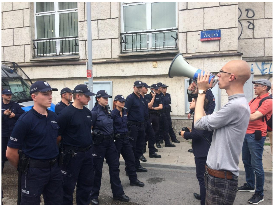
Police cordoned off an access road to the Parliament, Wiejska Street, at one end on 20 July 2017. Activists called on the police to release the protesters who were apprehended after they climbed through the fences separating the street from the area around Parliament.

An activist who did not participate in the protest and was standing on one of the exit roads taking pictures stated that the police physically assaulted her: "I was just standing there and one police officer grabbed me without any warning and pushed me against a traffic light post. He hit me in the face. I wasn't resisting... After that, more police officers came to the site, they completely blocked Górnośląska Street and kettled me there." The police subsequently told the media that the activist did not have any evidence to support her allegations of police abuse. 18