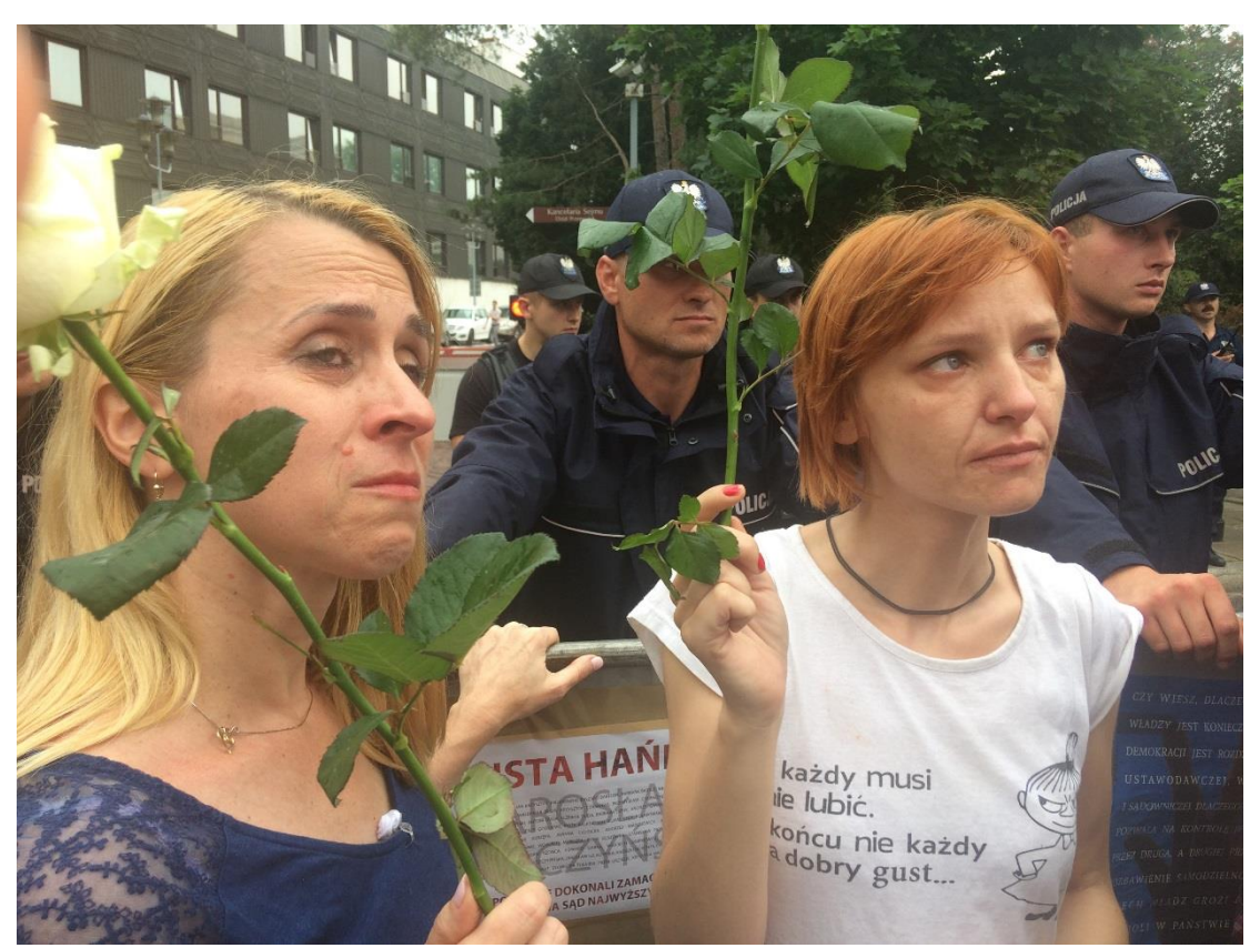
Protesters weeping in Warsaw at the Parliament after the announcement that the Sejm had adopted the amendment to the Law on the Supreme Court on 20 July 2017.

It was on 12 July 2017, shortly before midnight, that the amendment to the Law on the Supreme Court was put on the agenda of the Parliament. This served as the trigger for people, who came out to protest in large numbers. The majority of MPs of the lower chamber of the Parliament (Sejm) voted in favour of the amendment on 20 July. The news was met with outrage and sadness among the protesters assembled at the barriers on the main access roads to the Parliament. The Minister of the Interior told the media the next day that the protesters' demands amounted to a "call for the demolition of the democratic order" and that the feistiest protesters would be severely punished. One protester speculated that a number of those demonstrating against the government's moves to undermine the judiciary would eventually end up in jail.