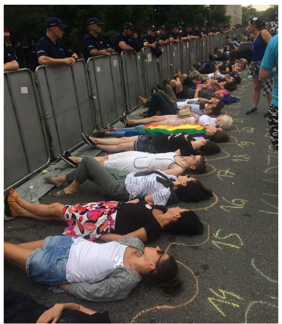
Activists mourning the "death of democracy" at the Parliament on 20 July 2017 after the announcement that the Sejm had adopted the amendment to the Law on the Supreme Court.

Protesters featured in this report are referred to by their real first name with the exception of a small number of individuals who preferred to remain anonymous for fear of potential negative consequences to their personal and professional lives. The names of protesters who lodged complaints against the police are mentioned in full with their informed consent.