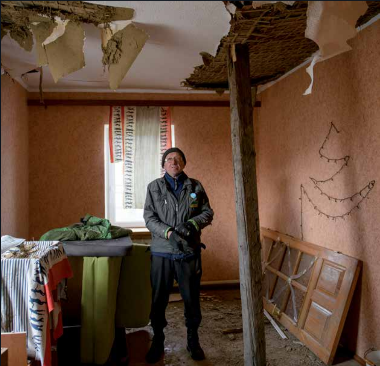
↑ An older man in his home that was damaged by attacks in Kharkiv region, Ukraine.