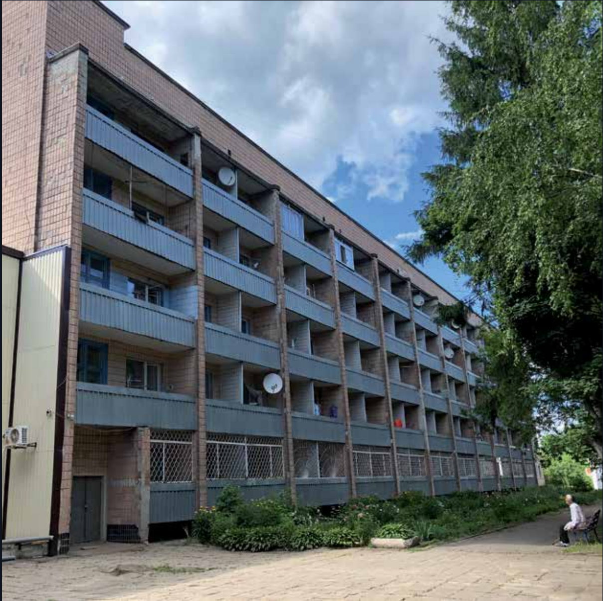
↑ An institution for older people in Ukraine