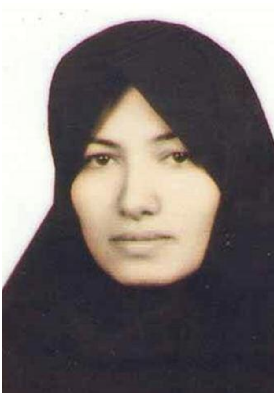
Sakineh Mohammadi Ashtiani