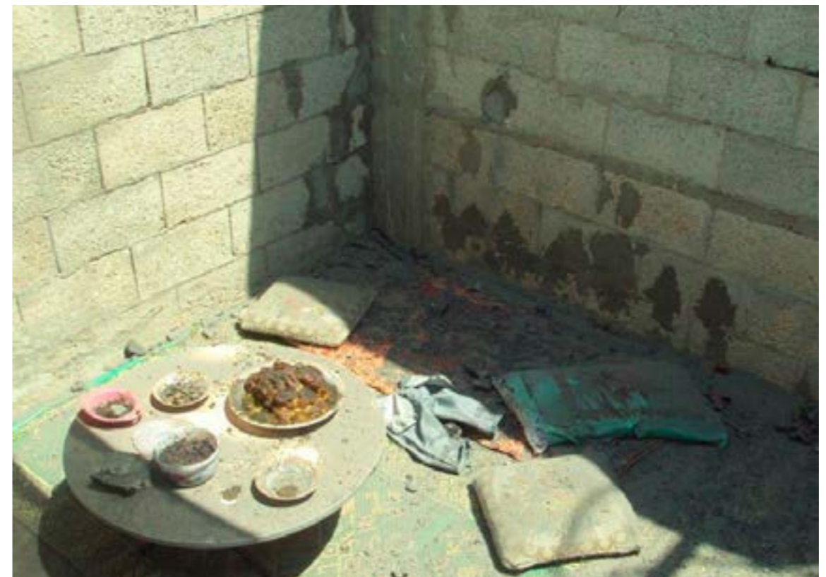
← © The home of the Abu Jame' family in southern Gaza. They were about to eat when an Israeli aircraft bombed their house killing virtually the entire extended family, 20 July 2014.