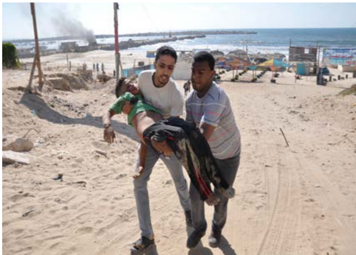
← Palestinians carry the body of a boy who was killed in an air strike by the Israeli army on a beach in Gaza City on 16 July 2014. Four children were killed and two other children were badly wounded in the strike.