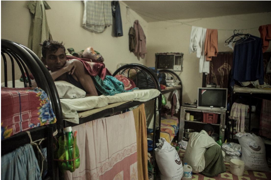
Migrant workers rest after a day of work between 1 and 8 centimetres thick, in a labour camp dormitory in Doha's Industrial Area, on June 18, 2011

The men were then held in overcrowded cells without beds or bedding, and not given enough food or water, before being deported several days later, many without having been paid their outstanding salaries and benefits from their companies.