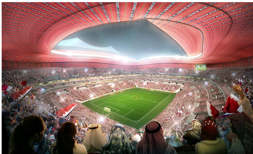
Artists impression of the Al Bayt Stadium, one of the newly built venues for the FIFA World Cup Qatar 2022.

But as the countdown to kick off continues, are the promises of labour reforms matched by the reality faced by migrant workers upon whom Qatar so depends?