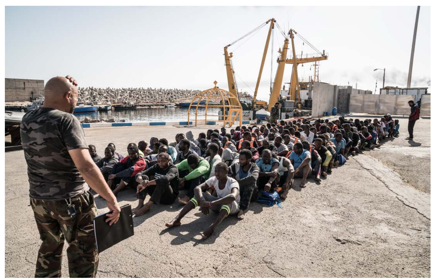
A Libyan Coastguardsman counting the number of migrants just been intercepted at sea in their way to Italy. Zawiya Jun 6-2016.