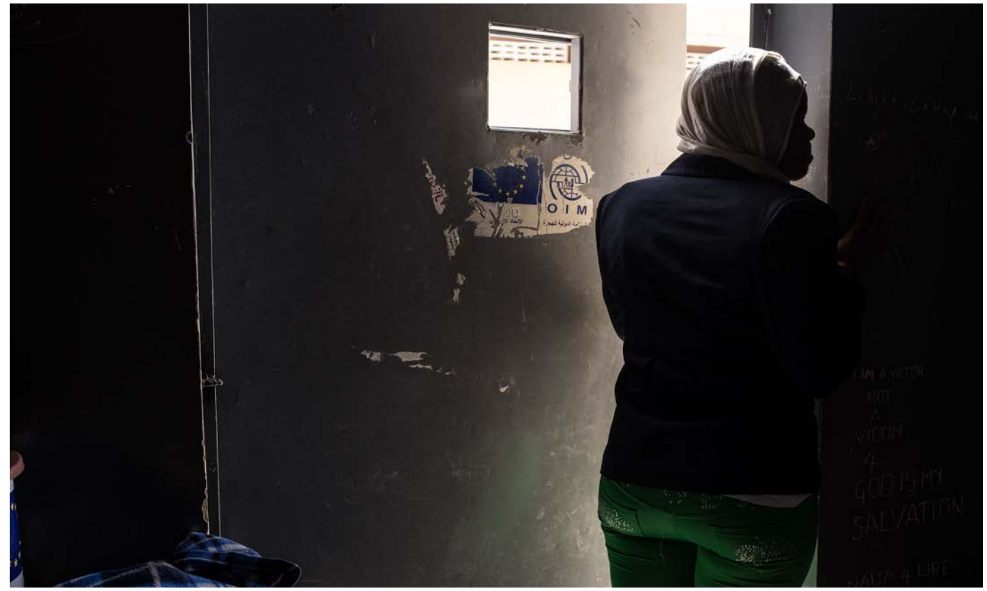
A migrant woman in Al Goyaa detention center. Garaboli (60km East of Tripoli). March 2-2016.