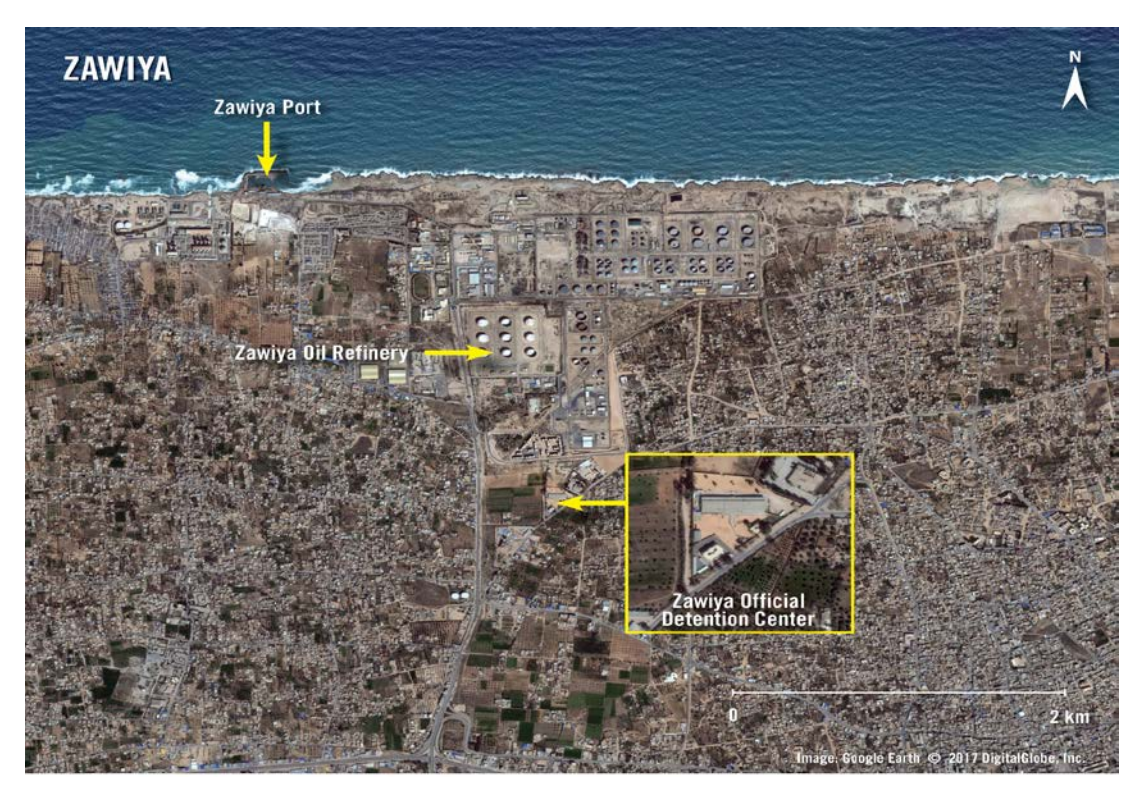
Satellite image of Al Nasser detention center in Zawiya, Libya, where hundreds of migrants and refugees face horrific human rights abuses.

Given the nature, it may be more accurate to describe these locations as "places of captivity" rather than even "unofficial detention centres". 90