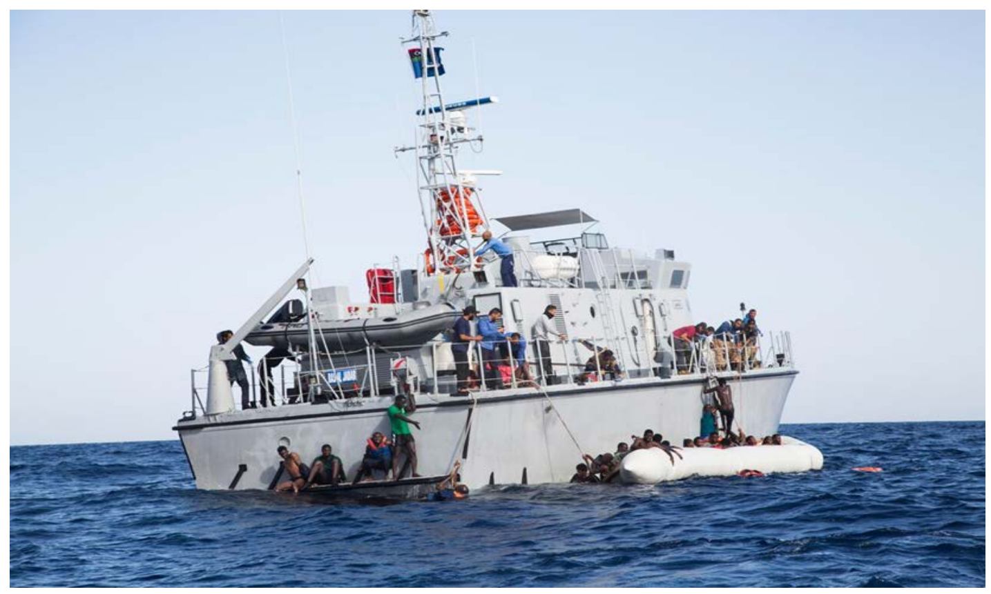
Libyan coastguard, aboard of boat donated by Italy, fails to deploy its rigid-hulled inflatable boat (RHIB) to help migrants and refugees. 50 people are estimated to have died at sea as a result of this interception at sea. Only 5 bodies were retrieved. 6 November 2017