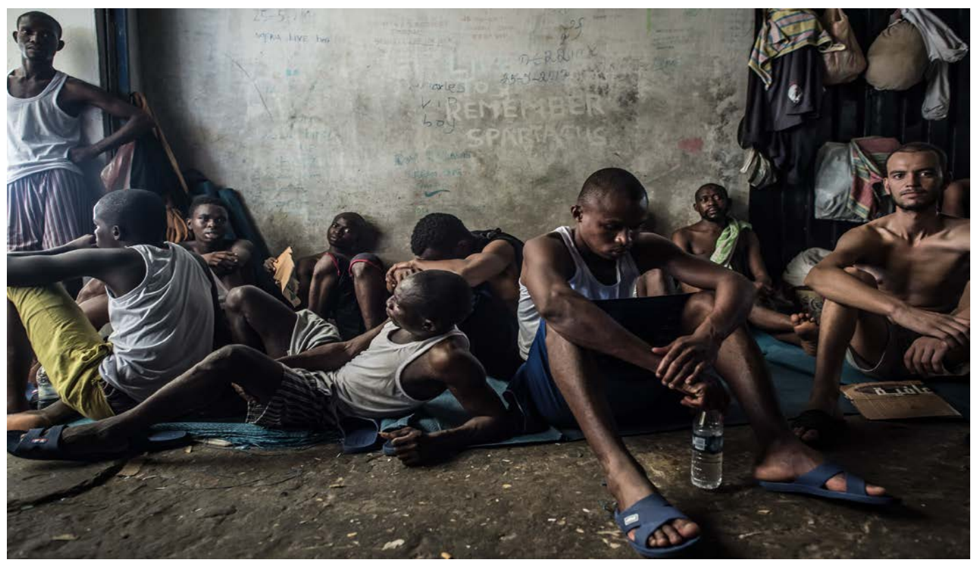
Refugees in Tarik Al Sika detention center, Tripoli, Libya. 22 September 2017.