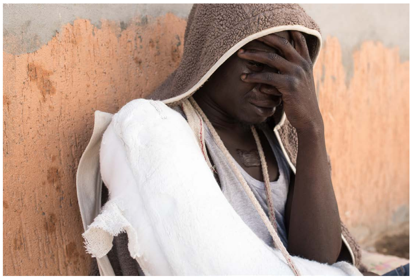
A refugee weeps after been captured by anti-immigration police on board a boat bound for Italy. Tripoli, Libya. 6 June 2016.