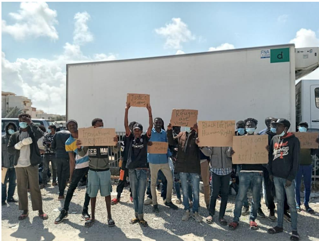
Refugees protest outside UNHCR's office in Tripoli, Libya, in April 2021, requesting protection, support and information about the status of their cases