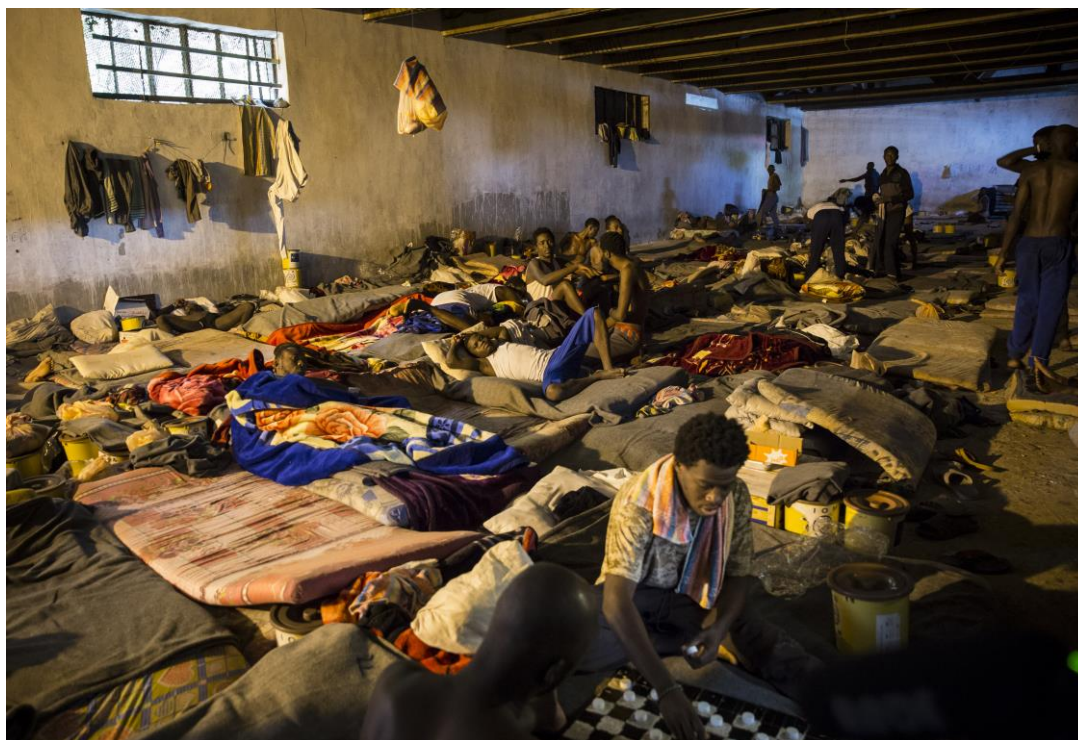
Detained migrants and refugees in a Tripoli detention centre on 8 June 2017.

Consistent with long documented patterns of abuse, in 2020 and 2021 the Libyan authorities held individuals returned from sea to arbitrary and indefinite detention in DCIM centres, and systematically subjected them to torture and other ill-treatment, frequently for the aim of extracting ransoms; sexual or gender-based violence; forced labour and other exploitation; and cruel and inhuman detention conditions that in themselves violate the absolute probation of torture and other ill-treatment. DCIM officials and other armed men in uniform or civilian dress present in detention centres routinely resorted to unlawful lethal force against detained refugees and migrants, sometimes leading to killings and injuries. Refugees and migrants also remained vulnerable to being forcibly disappeared from DCIM detention centres.