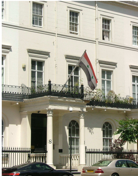
The Syrian embassy in London.