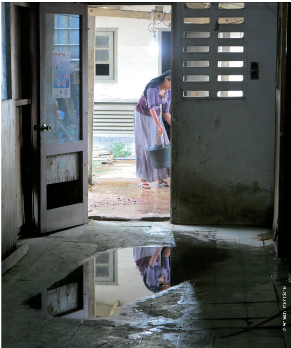
The hallway of the women's quarters at a shelter for Rohingya asylum-seekers in Aceh.

Several weeks after Amnesty International's research at the Blang Adoe shelter in Aceh, there were media reports about the beating and rape of the Rohingya by local residents. Following the alleged rapes, including of a 14-year old girl, more than 200 Rohingya left the shelter but eventually returned. At the time that this report was being finalized in mid-October 2015, local police said that they were investigating these reports. 181