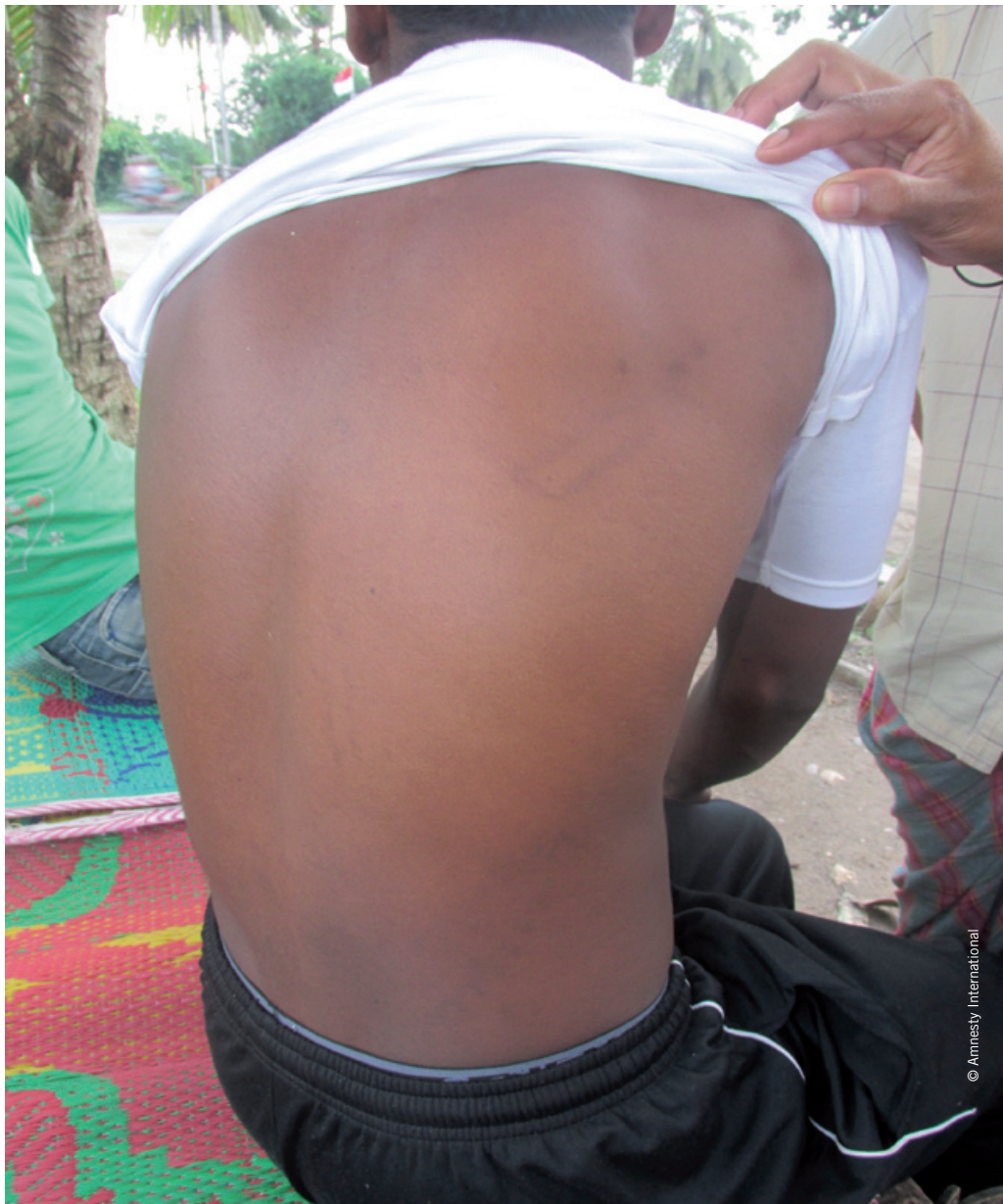
A 21-year old Bangladeshi man showing a scar he said he sustained from severe beatings on board a large vessel that stayed near the Thai coast for seven months.

Between 9 May – when the Arakan Project reported that smugglers had abandoned several vessels, leaving thousands stranded at sea – and 20 May – when the governments of Indonesia and Malaysia agreed to offer temporary shelter to up to 7,000 people – journalists, UN agencies and human rights organizations highlighted that the Indonesian, Malaysian and Thai governments were engaged in “maritime ping-pong” with human lives, pushing back boats from their shores. 126 Binding non-refoulement obligations, discussed earlier in this report, preclude states from engaging in these types of “push-backs,” because these operations carry an inherent risk of people being sent to a place where they might suffer serious human rights violations.