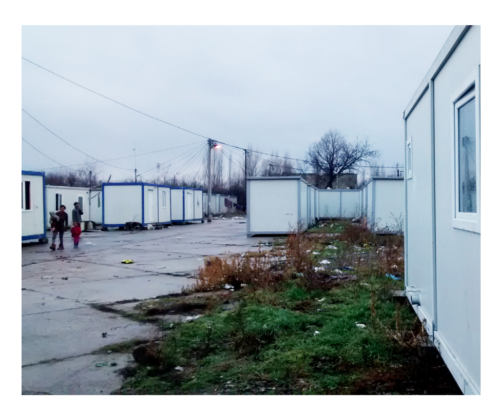
(ABOVE) Container settlement at Makiš, February 2015

Amnesty International requested information on how much of the EC's money had already been spent at a meeting with the EU Delegation in Serbia in early February; the organization wrote to the EU Delegation in Serbia on 5 March 2015 to request the same information, but had not yet received a reply.