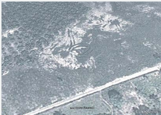
This image, taken in December 2013 shows vehicle tracks at Boobanabe, indicating that remediation activities were still taking place.

The court disagreed and ruled in the community’s favour, ordering Shell to compensate it for loss of income, valued at 4.6 million Naira (US$210,000). The company appealed the ruling, but in 1994 the Appeal Court affirmed the judgement of the lower court. 124