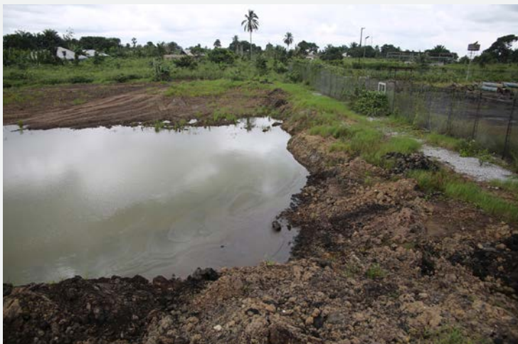
A large mound of blackened, contaminated soil, at the south side of the Bomu Manifold. Unprotected from the rain, it leaches oil into the pool. This polluted pool feeds a trench that leads towards the Barabeedom swamp. Researchers saw signs of contamination the length of the trench. August 2015