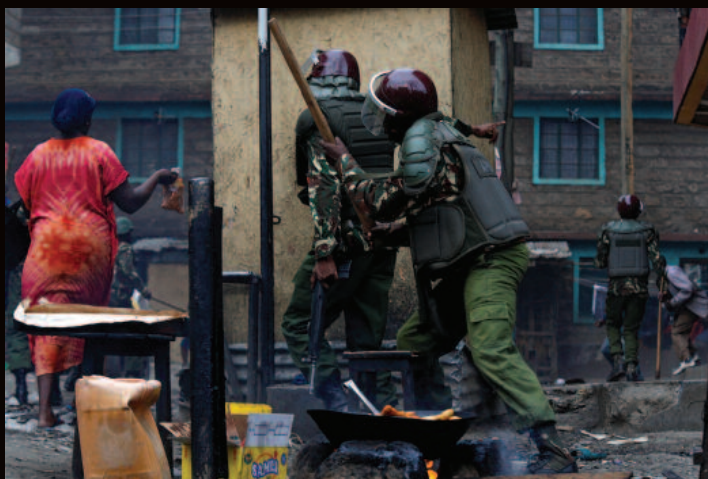
Residents flee as anti-riot policemen pursue opposition protestors in Mathare, Nairobi, on August 12.

Amnesty International and Human Rights Watch call on the Kenyan government to acknowledge, condemn and investigate the killings and excessive use of force by police and other security agencies and to urgently take measures to prevent a repeat in the upcoming fresh election.