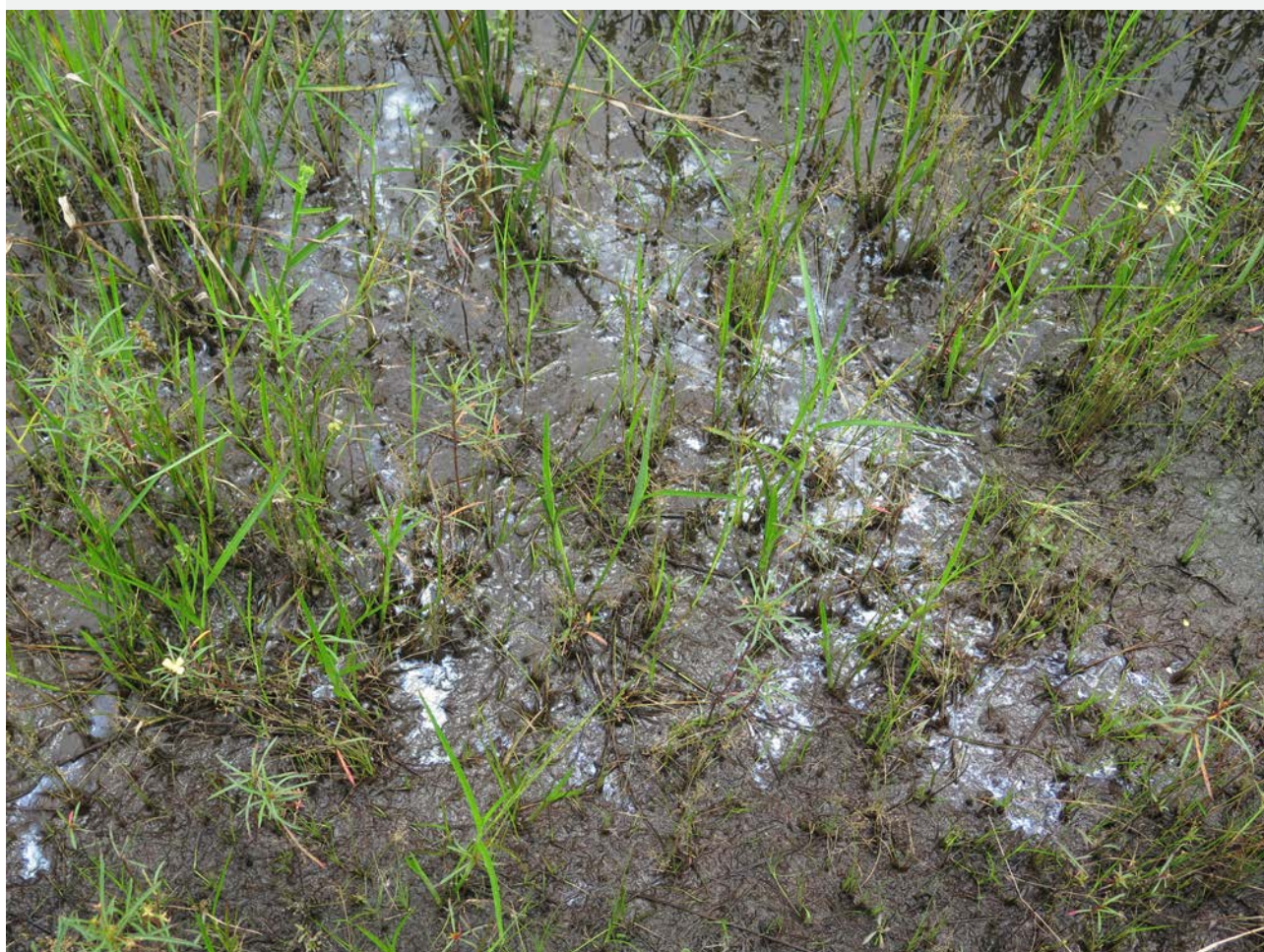
Oily sheen in the swamp at Boobanabe, August 2015. According to Nigerian government regulations, there should be no oil in water after 60 days. The spill at Boobanabe took place in 1970.

As with the other cases, Amnesty International has requested information from Shell and NOSDRA regarding this site, but did not receive any.