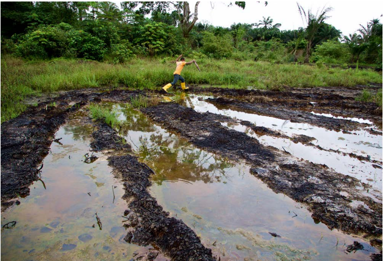
Contaminated waters at the Barabeedom swamp, September 2015."