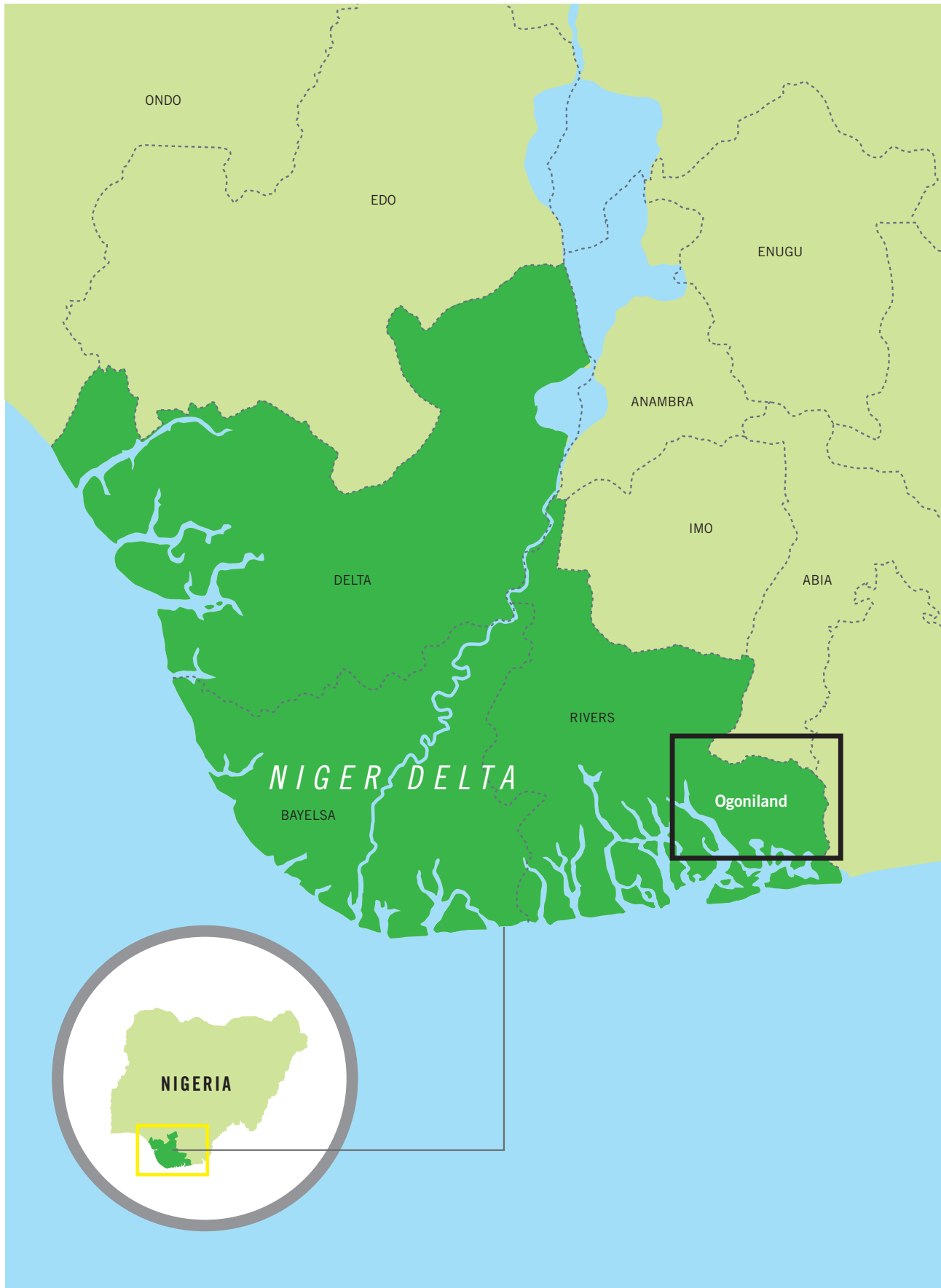
Map of the Niger Delta region in Nigeria