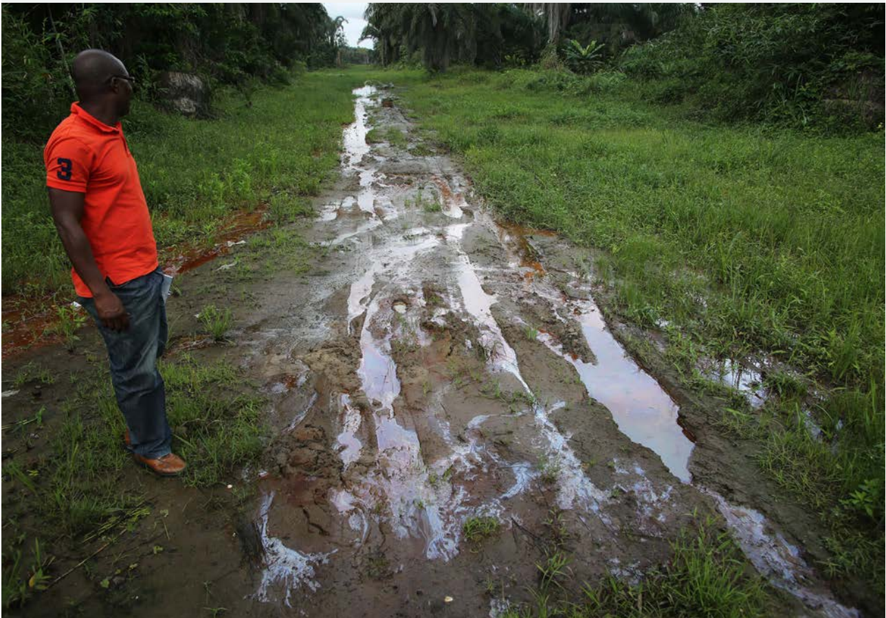
Stream at Barabeedom swamp is visibly contaminated with oil. August 2015

When UNEP investigated Barabeedom swamp in 2010, it found high levels of soil contamination, penetrating to as deep as five metres. The maximum level of soil contamination discovered by UNEP was more than eight times the level at which the Nigerian government requires intervention. 87