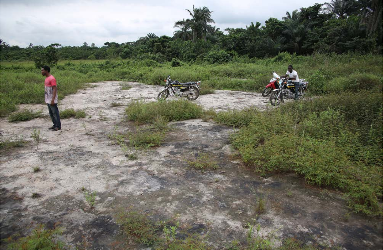
There is a strong smell of oil at Okuluebu where it has been left to soak into the ground, close to farmland and a stream. August 2015, © Amnesty International.

Okuluebu is an area of farmland, forest and swamp, about four kms north-east of Ogale town in Ogoniland. The swamp leads into a stream which flows down into the community. Pipelines belonging to Shell and the Nigerian National Petroleum Corporation (NNPC) run through the area in parallel. UNEP reported that a spill in 2009 had flowed more than 300m downhill from the Shell pipeline into the swamp at the head of the stream. There is a major risk therefore that the contamination spread downstream towards the community. 103