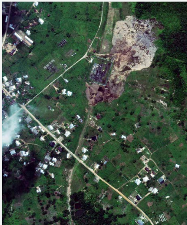
The Bomu Manifold, site of numerous oil spills and failed remediation attempts. Below the Kegbara Dere-Kpor road are the Barabeedom swamp and fishponds. Satellite image taken in 2015.

Pipes within the manifold were leaking oil when UNEP visited, and a trench leading south of the manifold towards a stream and the Barabeedom swamp was heavily contaminated with oil. 66