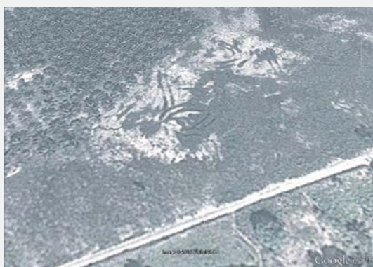
This image, taken in December 2013 shows vehicle tracks at Boobanabe, indicating that remediation activities were still taking place.

The court disagreed and ruled in the community’s favour, ordering Shell to compensate it for loss of income, valued at 4.6 million Naira (US$210,000). The company appealed the ruling, but in 1994 the Appeal Court affirmed the judgement of the lower court. 124