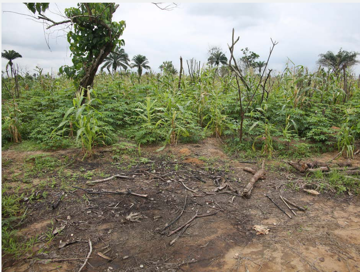
Oil has been left to soak into the ground next to a cassava field by the Shell pipeline at Okuluebu, Ogale. There is no sign of any attempt to clean it up. August 2015, © Amnesty International.