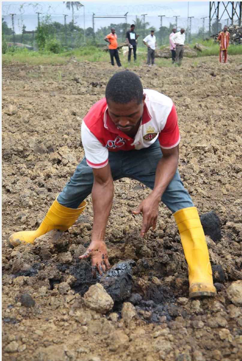
Shell claims that the area around the Bomu Manifold is clean, but the soil remains encrusted with oil. August 2015

Amnesty International wrote to Shell, asking it to provide details of its remediation attempts at Bomu, but the company did not provide any information. 77