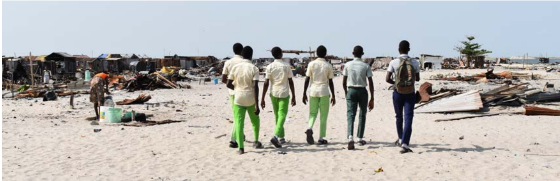
Students return from school to their demolished homes in Otodo-Gbame in Lekki area of Lagos. 27 March 2017

“I have not gone to school because of what happened, since about two weeks ago. My books, school uniforms, and stationery have been soaked by rain. Now that I don't have the opportunity to go to school, I always go with my daddy to fish... I worry that since I haven't been to school for these many days, I would be behind on my notes and lessons and that when I get to school and explain to my teacher [she or he] may not believe me, and will start beating me. When I think of this, and I cry and tell my daddy.”