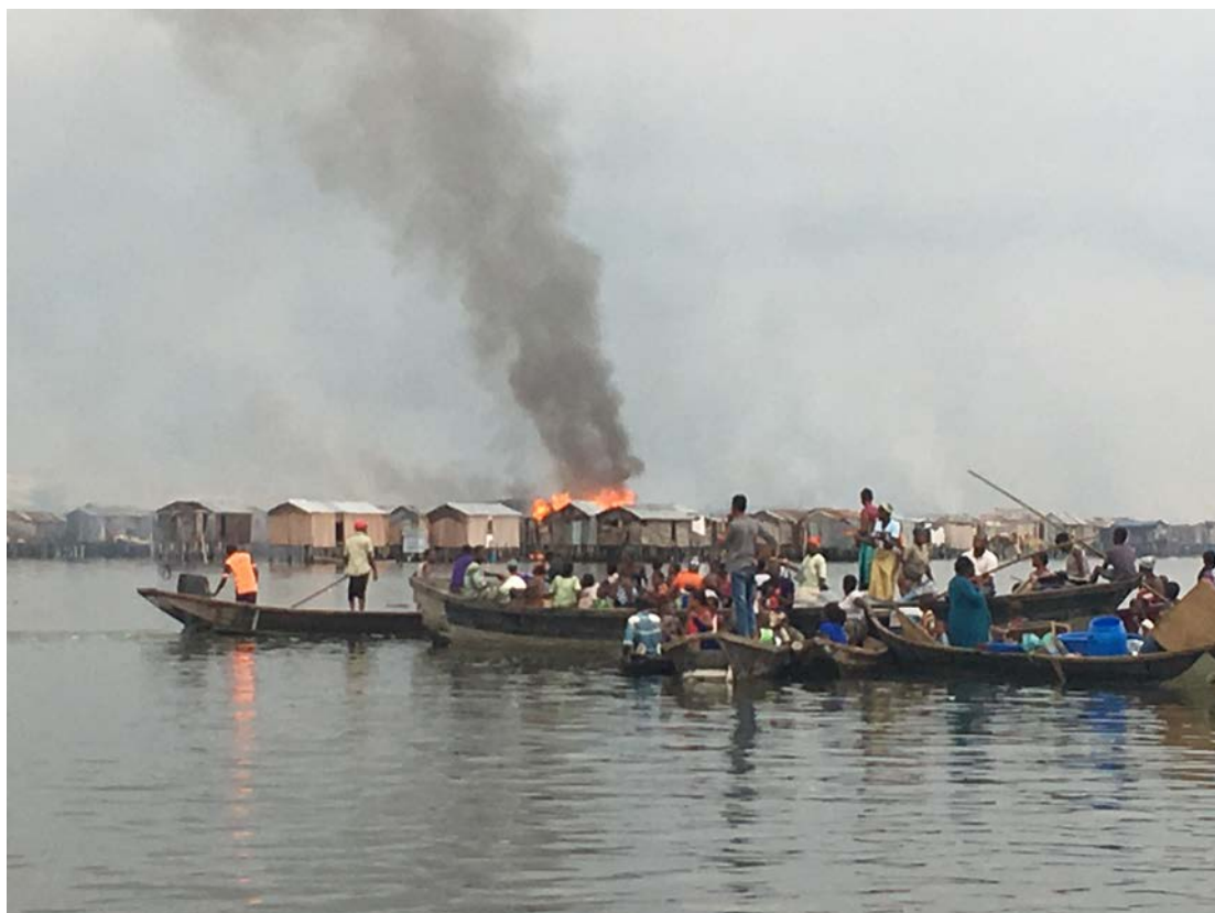
Ototo-Gbame evictees stranded on the Lagoon, watching their homes burn during the forced eviction on 9 April 2017.