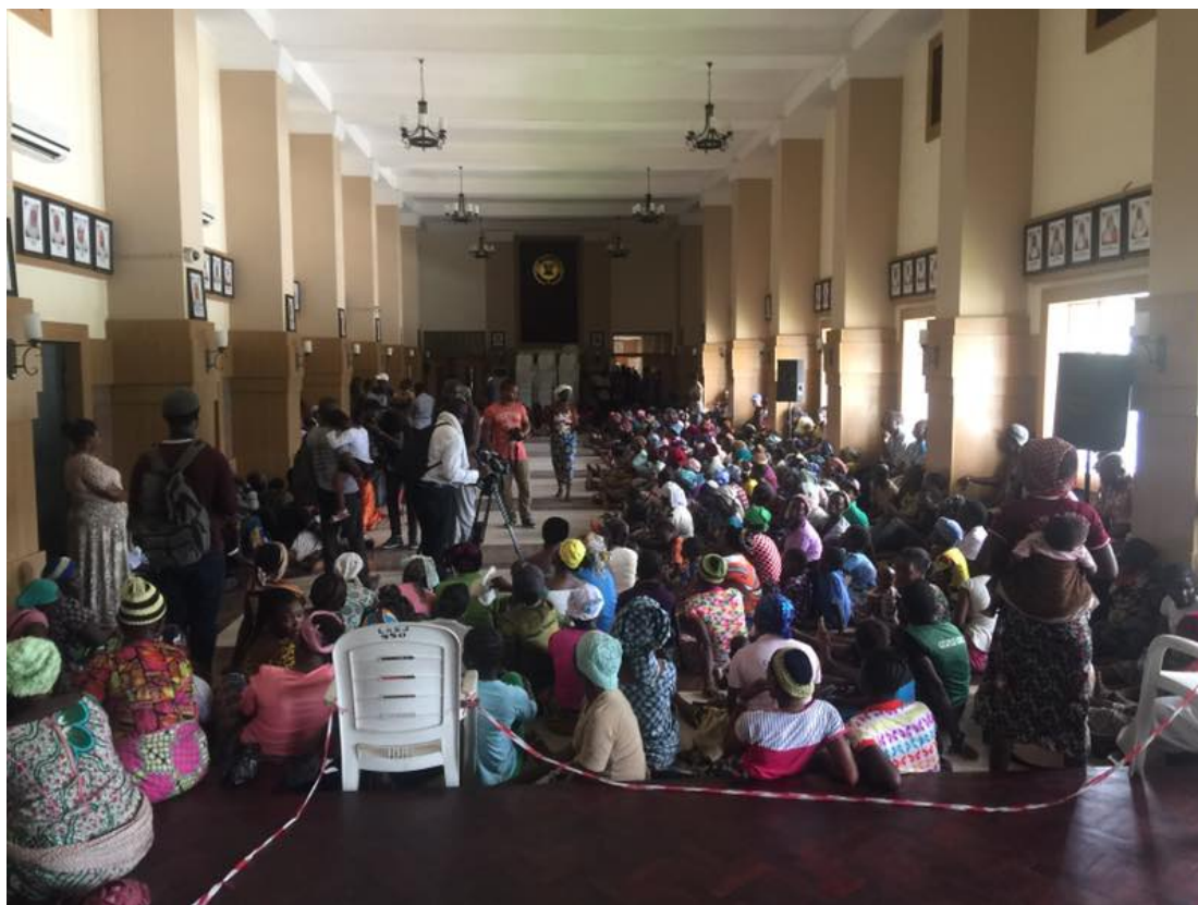
Some Otodo-Gbame evictees awaiting the court decision on the contempt proceedings filed against Lagos state authorities. 12 April 2017

On 21 June 2017, the Court found in favour of the applicants and held that evictions without resettlement are unconstitutional, while also restraining the government from further forced evictions and ordering it to consult with affected residents and evictees with a view to resettling them within the state. 156 On 28 June 2017, Lagos State announced that it had filed an appeal against this decision which at the time of writing is still pending. 157