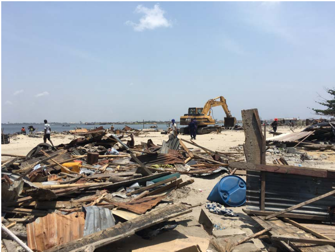
A bulldozer demolishing homes in Otodo-Gbame on 17 March 2017.

State Environmental Sanitation Enforcement Agency (Taskforce), army and other armed men, returned with a swamp buggy, to demolish more structures on the water. 93