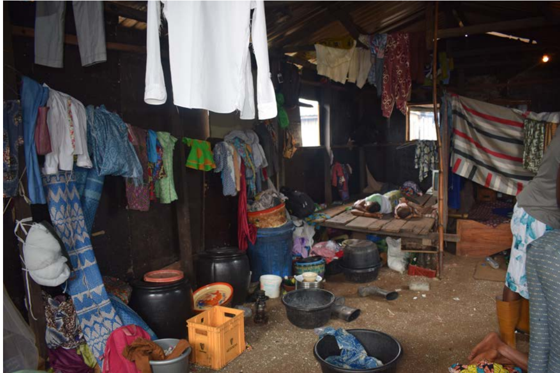
A room in Sogunro community in Makoko area of Lagos, where some Otodo-Gbame evictees were living with others. 4 July 2017