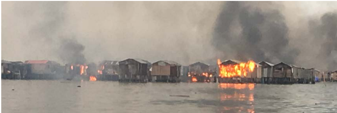
Houses in Otodo-Gbame set on fire during the forced eviction on 9 April 2017.

“My house was burnt on the morning of 9 November, around 8 or 9am. When I heard the noise, I tried to pack my children out into the canoe, so I went back to get some of our things, but three policemen were by my house and it was already burning. They had 25 litres keg of [liquid assumed to be] petrol, a lighter and their guns. I could not take a thing.”