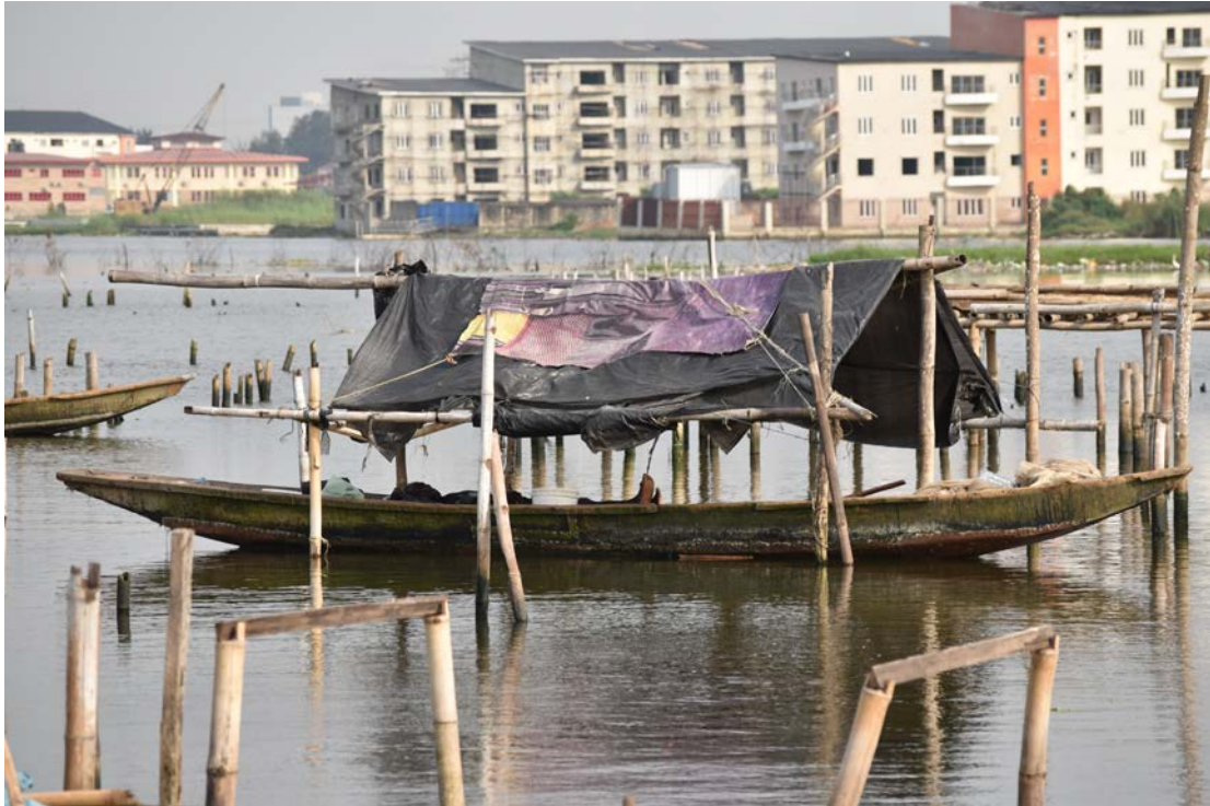
An Ilubirin evictee sleeping in a canoe with a tarpaulin roof. 14 December 2016

“Last night [25 October 2016], when we feared there might be a storm on the water, because of the very powerful wind, we had nowhere to run to, we were afraid the police would arrest us. The canoes we sleep in are small [and can easily capsize].” 242