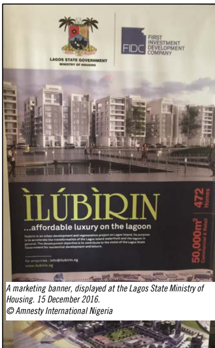
A marketing banner, displayed at the Lagos State Ministry of Housing, 15 December 2016.