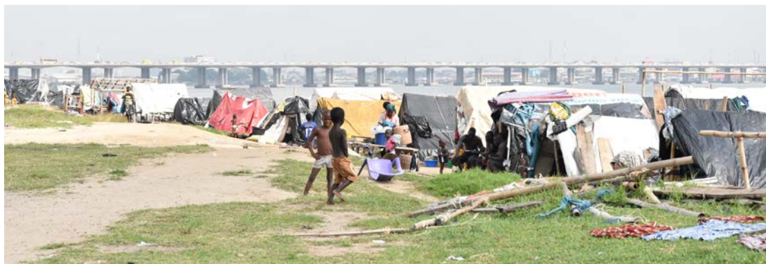
Some of the structures rebuilt by Ilubirin residents who continued to live in the area after the forced eviction of 19 March 2016. 19 May 2016.