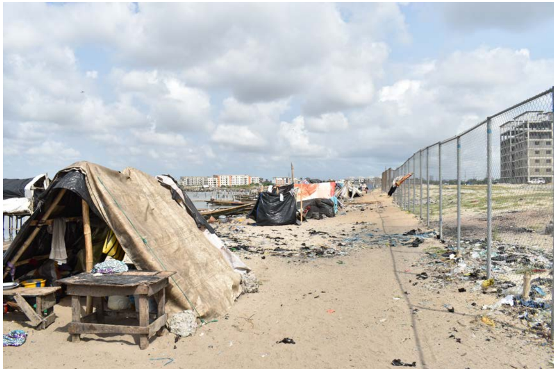
Five months after the October forced eviction, several Ilubirin evictees resettled at the edge of the lagoon, and just outside the fence constructed to keep them away from the land they occupied. 31 March 2017

On 31 March 2017, three residents told Amnesty International that those who returned to live near the shoreline had not been disturbed since the last eviction. But as the returned residents feared further evictions, they only built temporary structures.