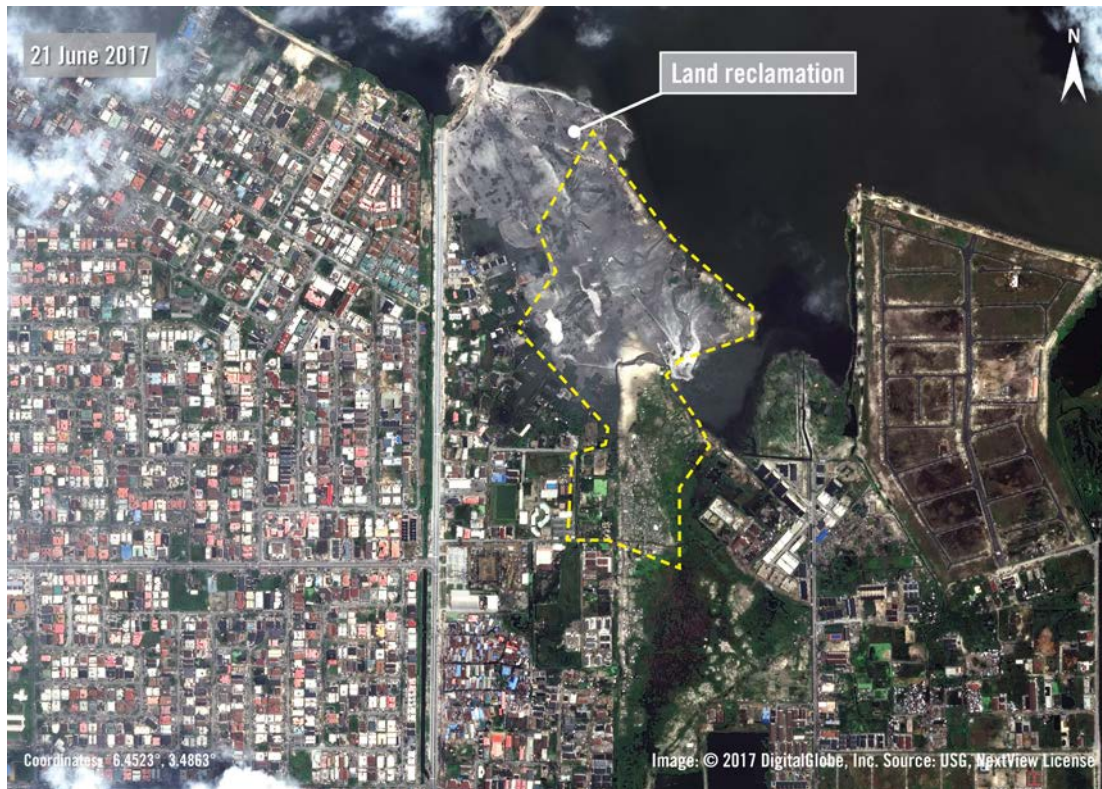
Satellite image of Otodo-Gbame after land reclamation exercise to expand the area for high-end real estate projects.