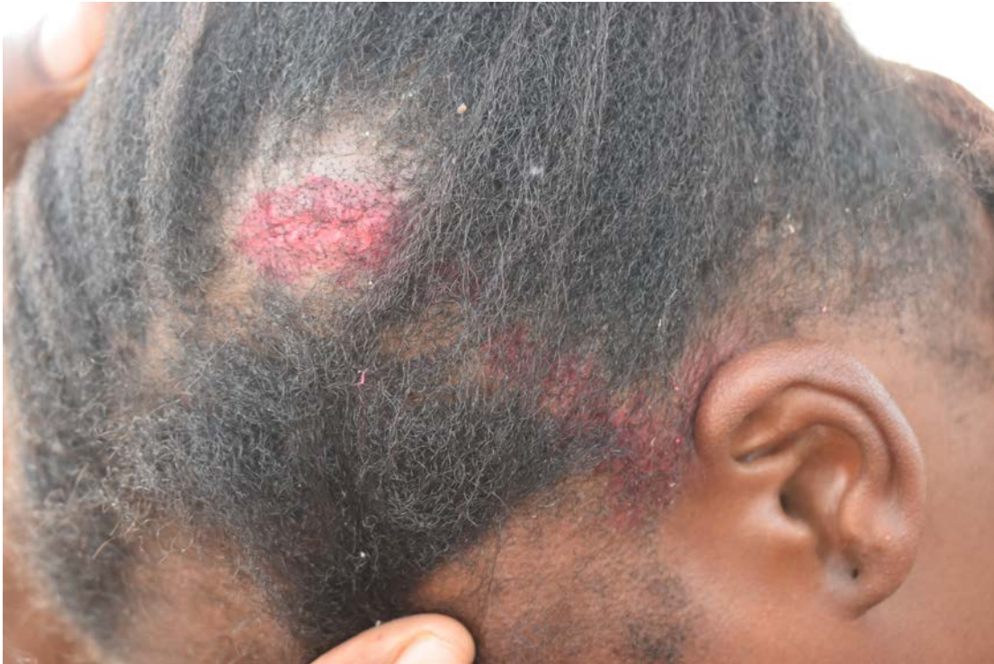
Head injury sustained by a woman resident. She told Amnesty International that a policeman threw a stone at her head on 26 March 2016, during the protest against the demolition of Otodo-Gbame. 28 March 2017

Amnesty International documented 12 cases of assaults of residents by police officers. The majority of the assaulted residents said they were beaten, while a few others said objects were thrown at them, resulting in injuries. Such treatment amounts to excessive use of force which should be punishable as a criminal offence. The residents were protesting to prevent the demolition of their homes.