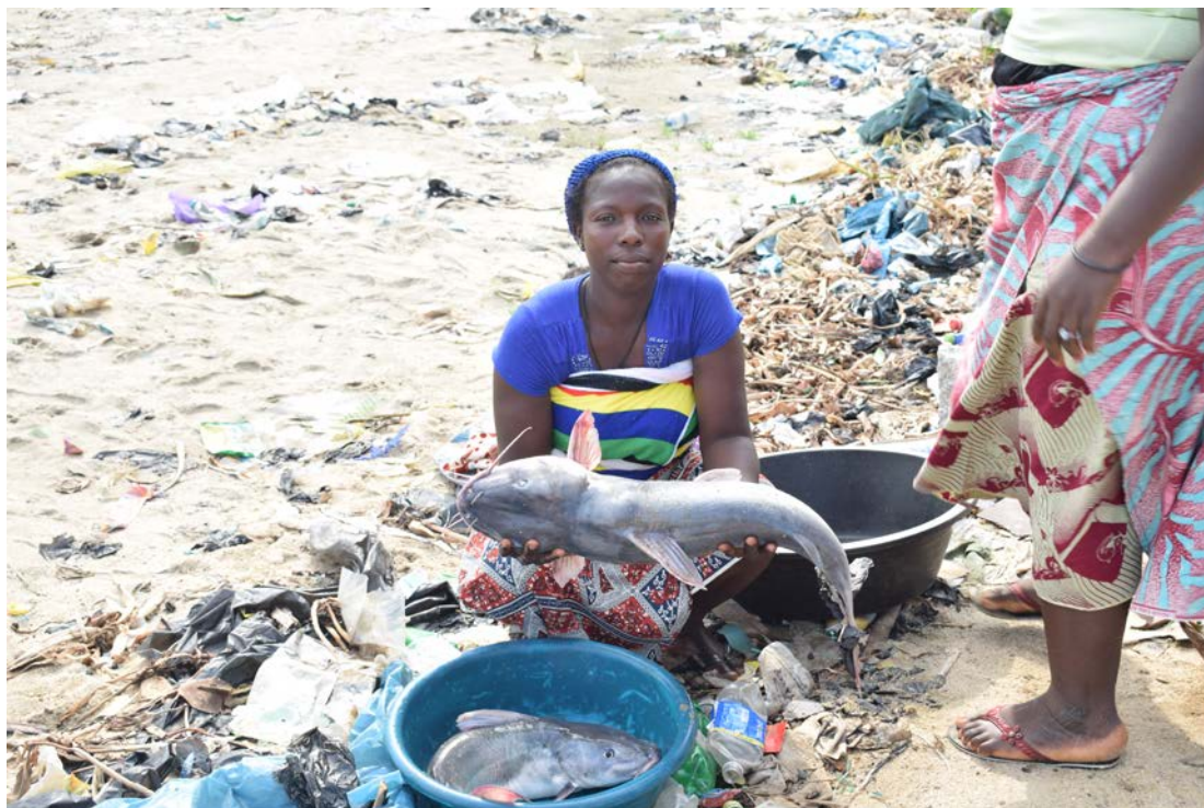
A woman forcibly evicted from Ilubirin displays her fish for sale. 26 October 2016

“...we would display the fish on land and people would buy, our wives would also start smoking the fish. When our wives are done smoking, people come from upland and faraway places to buy. But now, we don't have the space to do all that, because the police don't give us the chance. To be able to do our business [as usual], we need to have space to smoke the fish on land, we cannot smoke the fish in the canoes. Now, when we bring the fish, we sell them at giveaway prices, so we no longer make profit.” 253