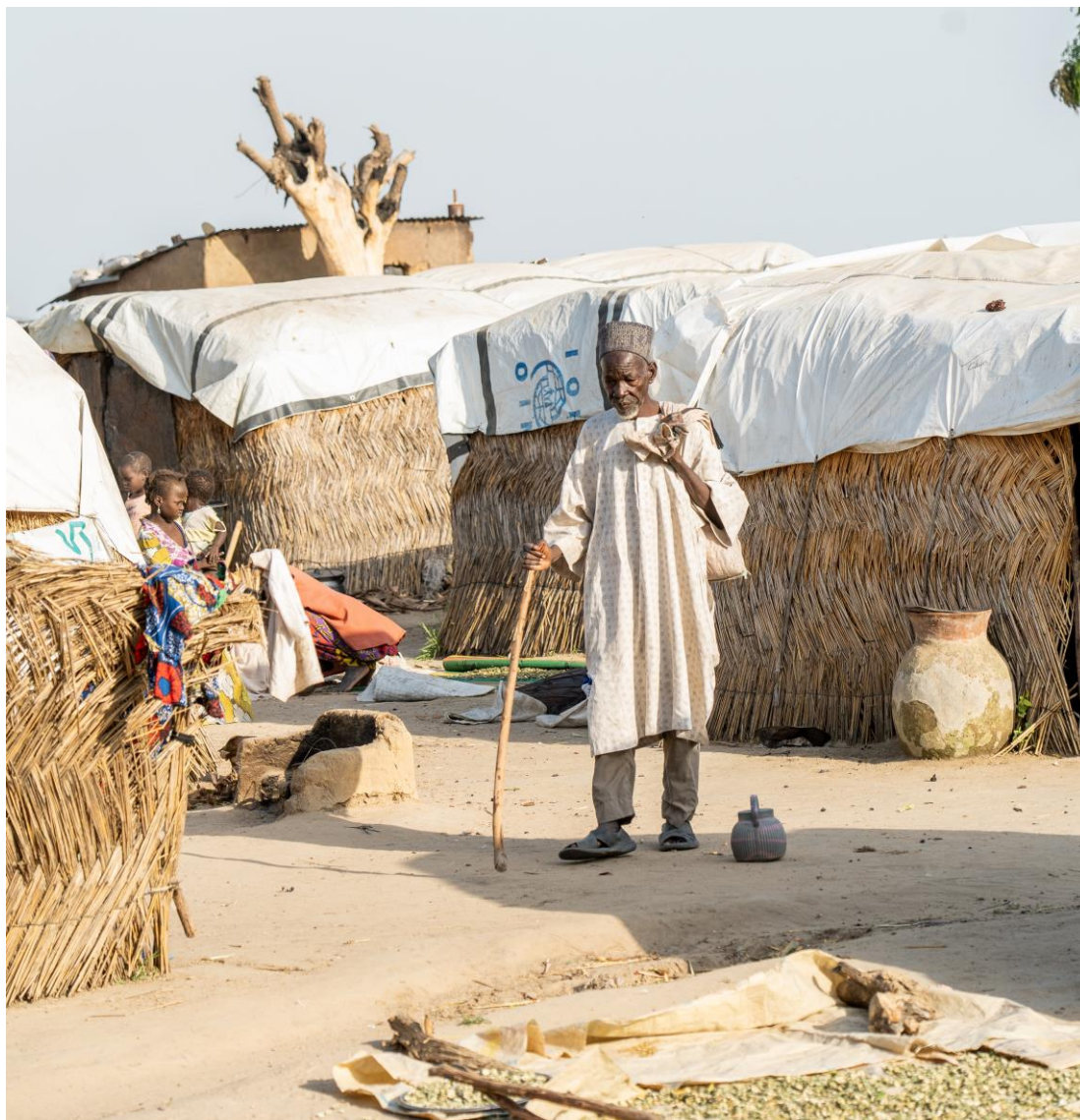
On older man walks to his shelter in an IDP camp in Borno State, Nigeria, October 2020.

An untold number of older people have died after being left behind, as they were unable to access adequate food and health care. A 72-year-old community leader in Baga town said he was one of dozens of older people who could not flee when Boko Haram took the town in December 2018; when the military re-captured Baga weeks later, soldiers asked him to assemble everyone, so that the military could bring them to Monguno. As the community leader went house to house, he found six people who had died. “Those people died in their homes—alone,” he said. “We buried them in their houses.” 116 He gave the names of all six; four were older men, and the other two were younger men with disabilities—one physical and one psychosocial.