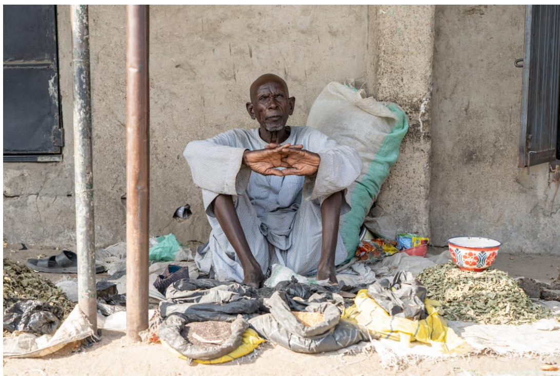
A displaced older man sits and sells small goods at a market near Maiduguri, Borno State, Nigeria, October 2020.