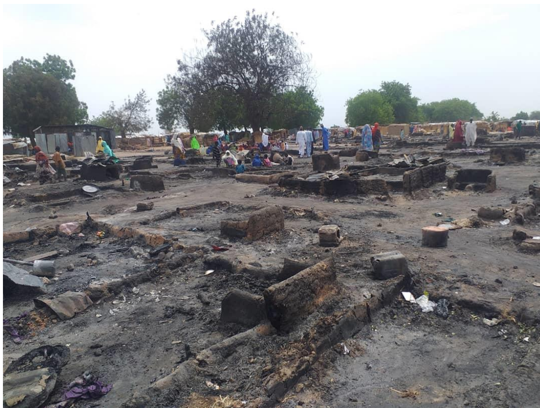
The remains of burnt shelters in Muna El-Badawy Camp, May 2020

Following a series of major fires in four different camps in the first half of 2020, including in Muna El-Badawy Camp, the Nigerian federal Minister of Humanitarian Affairs said the government would be developing a strategy to prevent fire outbreaks. 335 It is unclear what steps have been taken in subsequent months. Given the level of overcrowding, securing additional land for new or expanded camps is essential. 336