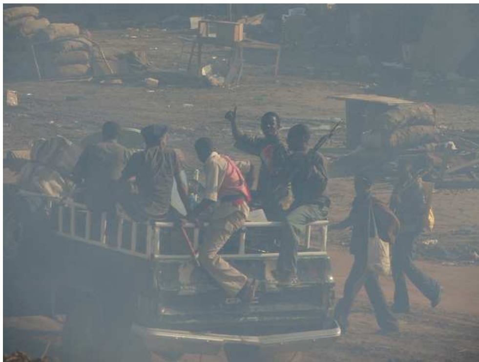
Armed militias in Abyei, 23 May 2011.

During and after the confrontations SAF and Misseriya militias killed civilians, looted and burned to the ground homes and properties.