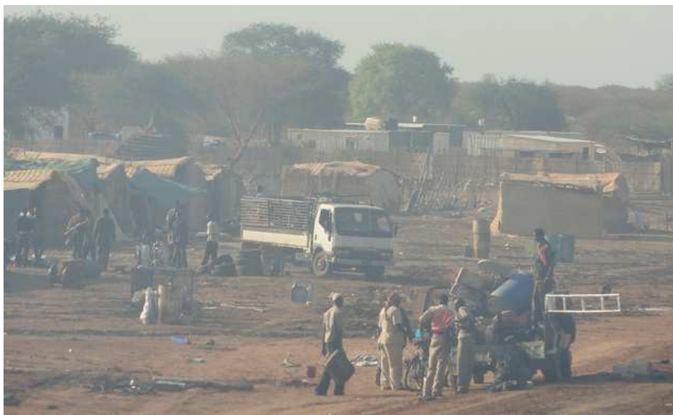
Looters in Abyei, 23 May 2011.

Former UNMIS staff told Amnesty International that on 21 May SAF overran Abyei town with T-55 tanks and multiple-rocket launchers and that five artillery shells landed in the UNMIS compound, injuring two Egyptian peacekeepers and destroying a UN vehicle. SAF looted the World Food Programme (WFP) warehouse, bringing in heavy trucks to remove two UN Development Programme (UNDP) generators and the food. UNMIS asked for the food to be returned but the SAF commander said he had instructions to distribute the food to Misseriya leaders.