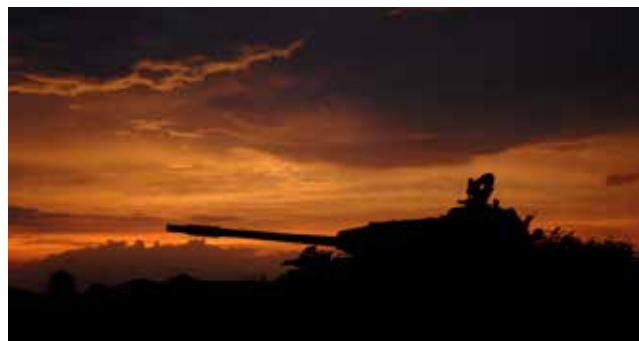
Cover photo: Military tank in Upper Nile state, South Sudan, 2009.