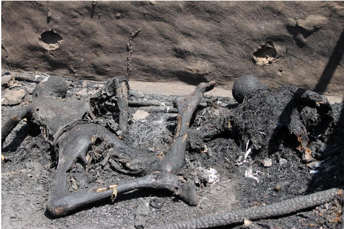
Burned bodies of civilians killed outside Yei, South Sudan, November 2016

that the soldiers would catch me and do the same to me. The following morning, I went to his burnt-out home and found his bones. Three other neighbours were also shot dead. The soldiers also took some animals with them, several goats and other animals.” 15