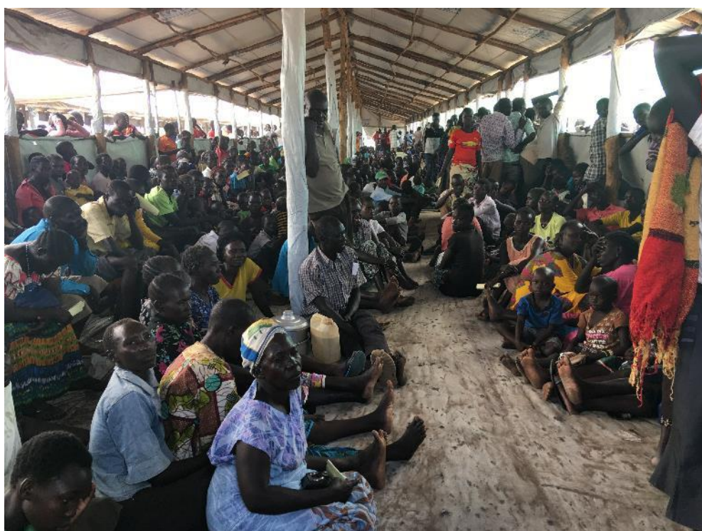
Recently arrived refugees from the Equatoria region waiting to be registered at a refugee centre in northern Uganda, June 2017

Government and opposition forces in South Sudan's Equatoria region, have committed war crimes and widespread and serious human rights abuses against civilians. 1 Men, women and children have been shot, hacked to death with machetes and burned alive in their homes. Women and girls have been gang-raped, some after having been abducted. Homes, schools, medical facilities and humanitarian organizations' compounds have been looted, vandalized and burned down. 2 Such atrocities have already forcibly displaced hundreds of thousands of the region's inhabitants, and are continuing. Many of the displaced have fled the country and are now living as refugees in neighbouring Uganda and the Democratic Republic of the Congo (DRC). Others are internally displaced within the region, living in fear of the ongoing violence and in dire humanitarian conditions. Both government and opposition forces have used food as a weapon of war, denying civilians access to food as a means to control their movement or force them out of their homes and off their land. As a result, in a region previously considered as South Sudan's breadbasket, the remaining population faces acute food shortages and increasing malnutrition.