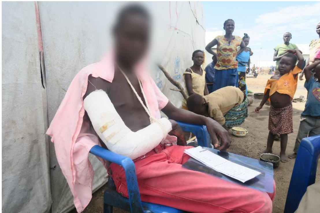
Man wounded in a market shooting on the 15 of May 2017 in Payawa, south-east of Yei