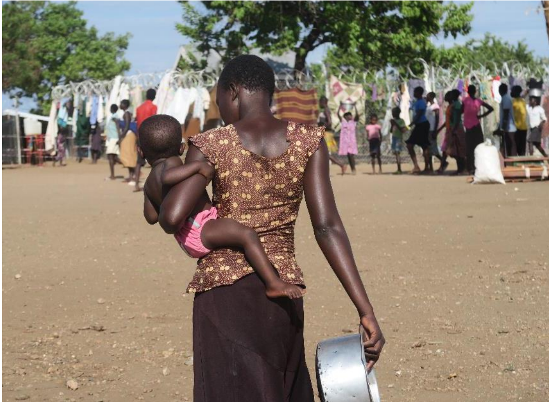
Refugees from Equatoria region of South Sudan in northern Uganda, June 2017