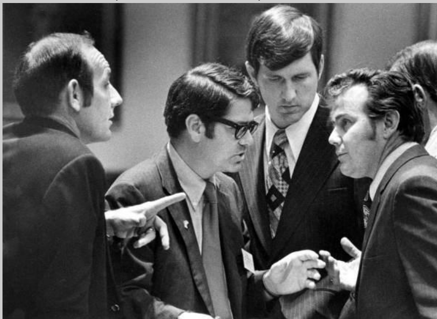
1972. MEMBERS OF FLORIDA'S HOUSE OF REPRESENTATIVES DISCUSS DEATH PENALTY LEGISLATION. IN DECEMBER 1972 FLORIDA BECAME THE FIRST STATE IN THE USA TO ENACT A NEW CAPITAL STATUTE AFTER THE US SUPREME COURT'S FURMAN RULING.