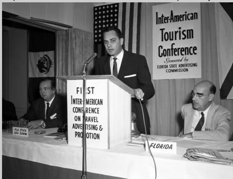
October 1954. Unidentified delegate speaking at the Inter-American Tourism Conference at the Colony Hotel in Palm Beach, Florida.

Snapshot: Connected to the modern world or separated from it?