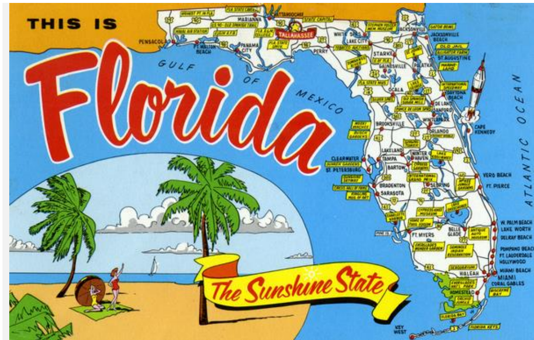
Pre-1975 postcard.

‘As I and other Justices have previously pointed out, individuals who are executed are not the ‘worst of the worst,’ but, rather, are individuals chosen at random, on the basis, perhaps of geography, perhaps of the views of individual prosecutors, or still worse on the basis of race’