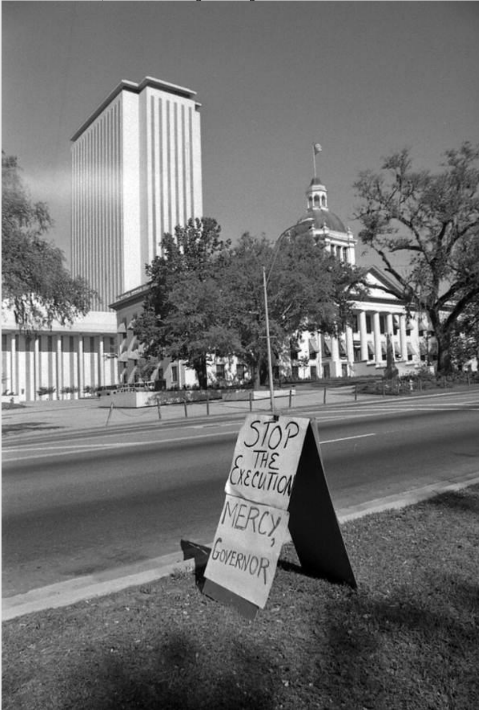
21 April 1986. Execution protest sign - Tallahassee, Florida.

Snapshot: The quality of mercy and Florida are estranged