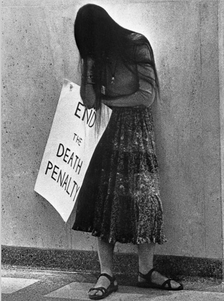
1979. DEATH PENALTY OPPONENT DURING DEMONSTRATIONS AT THE CAPITOL, TALLAHASSEE, FLORIDA.

Working to end the death penalty is a long-term effort, and Florida is a diehard state as far as this cruel punishment is concerned. In the four and a half decades since Florida reinstated the death penalty after the 1972 Furman ruling, country after country has turned against this punishment and today 142 countries are abolitionist in law or practice. In Florida, there have been more than 47,000 reported murders since the state enacted its post- Furman capital statute in December 1972. 200 While “every murder is tragic”, wrote US Supreme Court Justice Stephen Breyer in 2015, “the constitutionality of capital punishment rests on its limited application to the worst of the worst”. Can anyone assert with confidence that those cases in Florida that have resulted in the death penalty were the “worst of the worst” crimes and offenders? Did geography, race, economic class, or other “irrelevant or improper factors” influence this outcome? (see Glossip v. Gross , US Supreme Court, 2015, Justice Breyer dissenting).