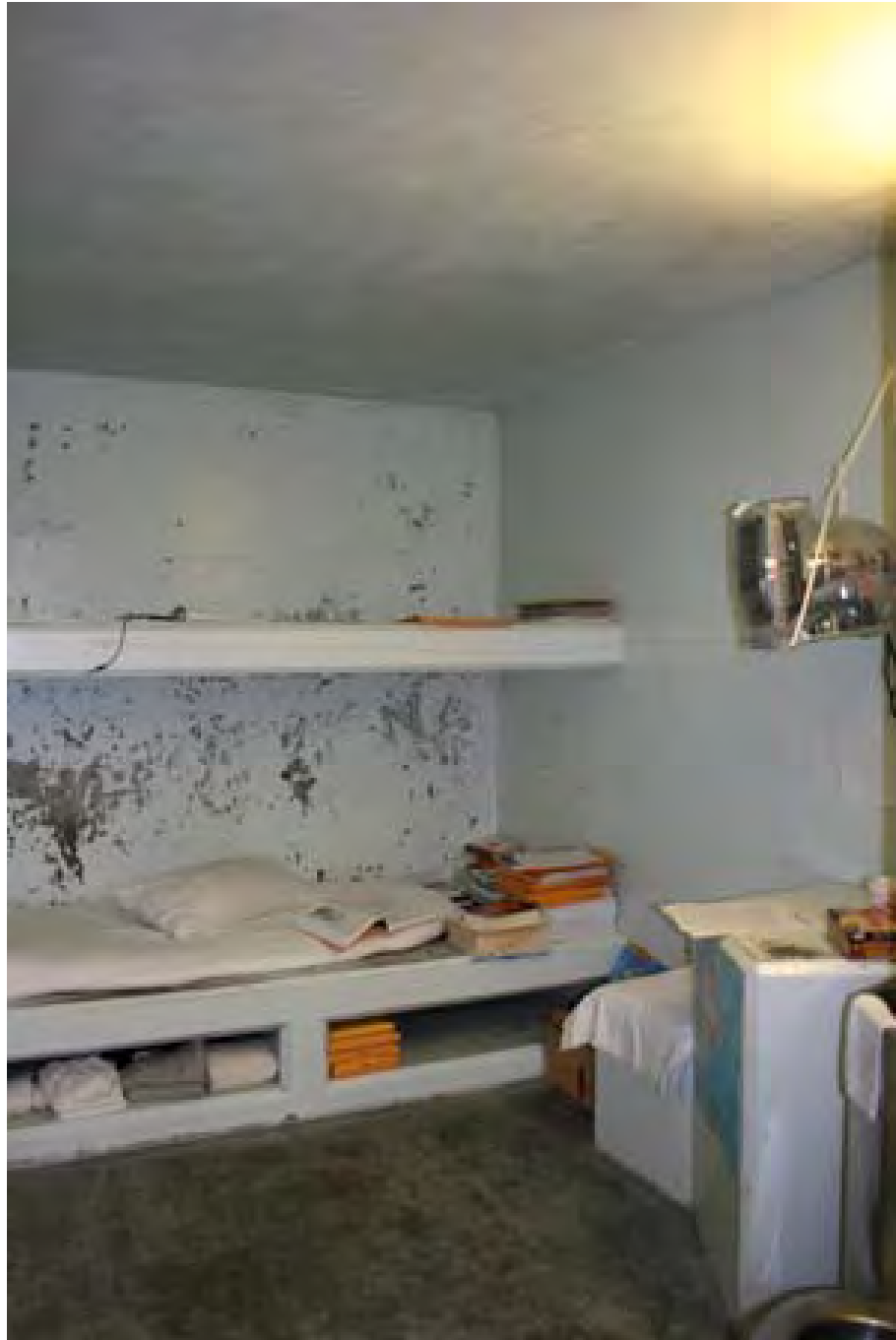
A cell inside Pelican Bay SHU.

The ACA standards also require that “all inmates’ rooms/cells provide access to natural light” and that “segregation housing units provide living standards that approximate those of the general population” in prison. 47