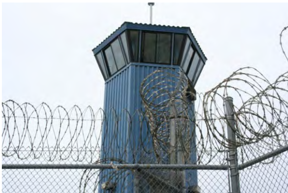
A watchtower at Pelican Bay State Prison.

California is one of more than 40 US states to house prisoners in high security isolation facilities, often termed “super-maximum security” prisons. Although no exact data is available, as many as 25,000 prisoners are estimated to be held in such facilities, with thousands more held in solitary confinement for varying periods in disciplinary or administrative segregation cells at any given time. 4 While prison authorities have always been able to segregate prisoners for their own protection or as a penalty for disciplinary offences, super-maximum security facilities differ in that they are designed to remove large numbers of prisoners from the general prison population and confine them long-term to isolation cells as an administrative control measure. States started building such prisons (or units within prisons) from the late 1980s, with the largest expansion during the 1990s. 5