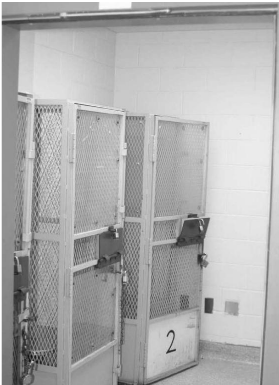
Example of holding cells, similar to those used during therapy sessions in Pelican Bay SHU.