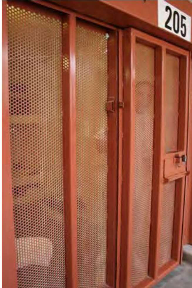
A SHU inmate peers out of his cell.

stimulation", including, where possible, more out-of-cell time and opportunities to exercise in the presence of other prisoners (23-3.8 (c)). The standards also recommend a number of procedural protections for prisoners placed in segregated housing, including a hearing at which the prisoner has a reasonable opportunity to present witnesses and information and to participate in the proceedings, with regular, meaningful review (23-2.9).