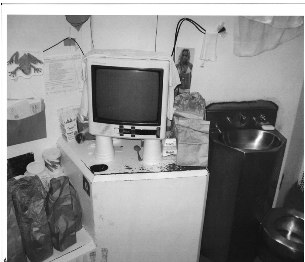
Picture of a sink and tv inside a SHU cell.

While the perforated doors allow entrance of some fresh air, prisoners have complained of cells becoming very cold in winter, particularly at night, and of not being provided with adequate clothing. The cold temperature is reportedly exacerbated by failure to insulate outside walls at the back of some cells, where the concrete bunks are situated. There are also reports that the ventilation system is inadequate, consisting of recycled air, releasing dust and particles, leading to respiratory problems. 48 While Amnesty International was unable to assess this through its visit, it believes that these complaints should be addressed. CDCR should ensure that cells are sufficiently insulated from cold, are maintained at adequate temperatures and with sufficient ventilation. All prisoners without exception should be provided with adequate clothing, blankets and headwear.