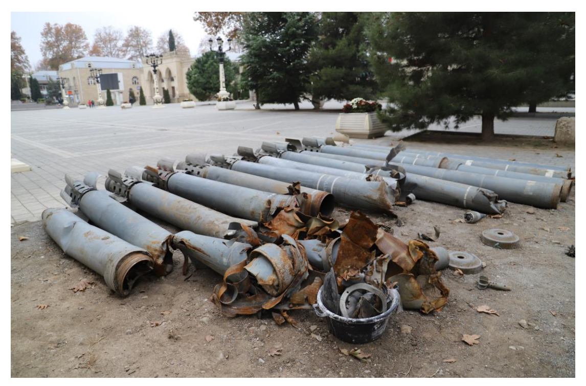
Remains of rockets launched by Armenian forces which hit the city of Terter in Azerbaijan during the 44-day conflict.

In addition to killing and harming civilians not directly participating in hostilities and not in the vicinity of military objectives, strikes carried out by Armenian forces also destroyed or damaged a large number of civilian homes and other civilian objects. In one settlement in Terter made up of 34 apartment buildings for families displaced from Nagorno-Karabakh in the early 1990s, at least 25 apartments were struck, the roofs of eight buildings were destroyed, and hundreds of other apartments and administrative buildings sustained varying degrees of damage.