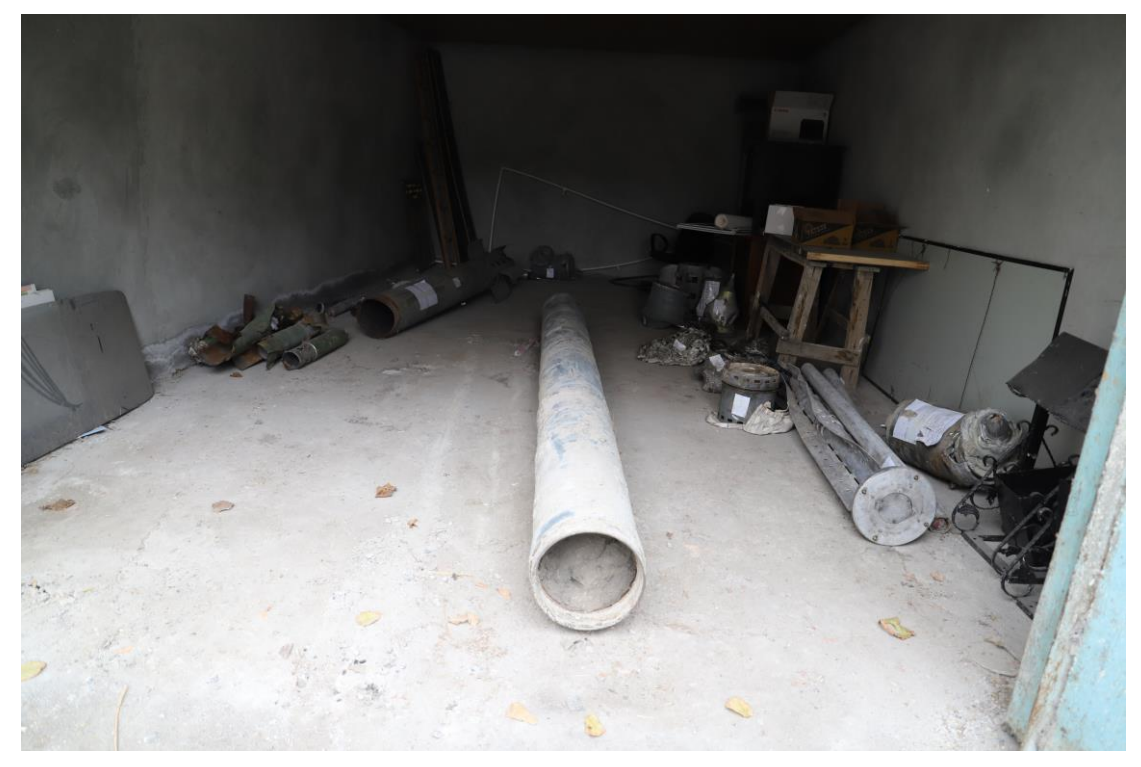
This cargo container contains remains of weapons used in the conflict, including pieces of a Russian-made 9M55K Smerch rocket (which holds 72 9N235 cluster munitions) launched by Armenian forces. It landed in the middle of a busy traffic roundabout of Barda, Azerbaijan on 28 October 2020, killing 21 civilians who worked in the area or were passing through. Scores of others were injured, including some who lost limbs.

On 28 October at about 1:30 pm, a busy time of day, Armenian forces fired several large calibre missiles into the city of Barda, more than 20 km from the frontlines. Three missiles landed in the city centre, two of them near two hospitals. One of them, a Russian-made 9M55K Smerch rocket containing 72 9N235 cluster munitions, landed in the middle of a busy traffic roundabout, killing 21 civilians who worked in the area or were passing through. Scores of others were injured, including some who lost limbs.