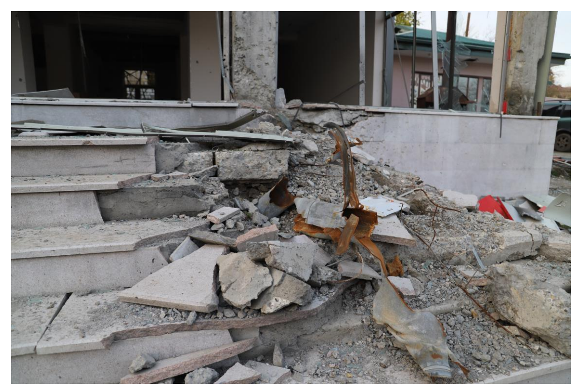
Remains of a Grad rocket fired by Azerbaijani forces embedded in the steps of a building across the road from the shop where three members of the Khachatryan family were killed in Martakert on 30 September 2020.

The Grad rocket was still lodged in the steps at the entrance of the building opposite the Khachatryan's shop when Amnesty International visited in mid-December.