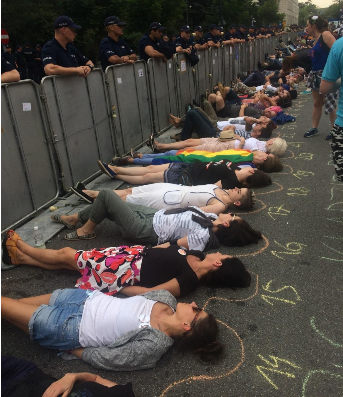
Activists mourning the “death of democracy” at the Parliament on 20 July 2017 after the announcement that the Sejm had adopted the amendment to the Law on the Supreme Court.

Protesters featured in this report are referred to by their real first name with the exception of a small number of individuals who preferred to remain anonymous for fear of potential negative consequences to their personal and professional lives. The names of protesters who lodged complaints against the police are mentioned in full with their informed consent.