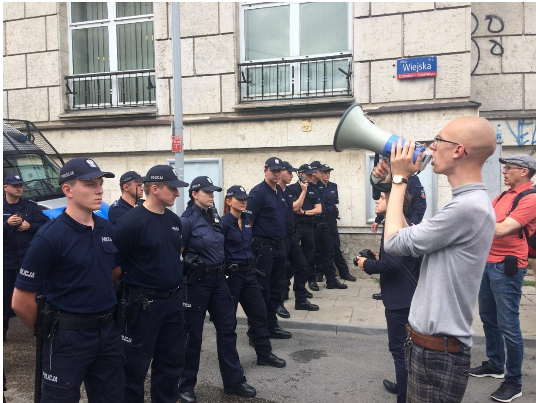
Police cordoned off an access road to the Parliament, Wiejska Street, at one end on 20 July 2017. Activists called on the police to release the protesters who were apprehended after they climbed through the fences separating the street from the area around Parliament.

An activist who did not participate in the protest and was standing on one of the exit roads taking pictures stated that the police physically assaulted her: “I was just standing there and one police officer grabbed me without any warning and pushed me against a traffic light post. He hit me in the face. I wasn’t resisting... After that, more police officers came to the site, they completely blocked Górnośląska Street and kettled me there.” 17 The police subsequently told the media that the activist did not have any evidence to support her allegations of police abuse. 18