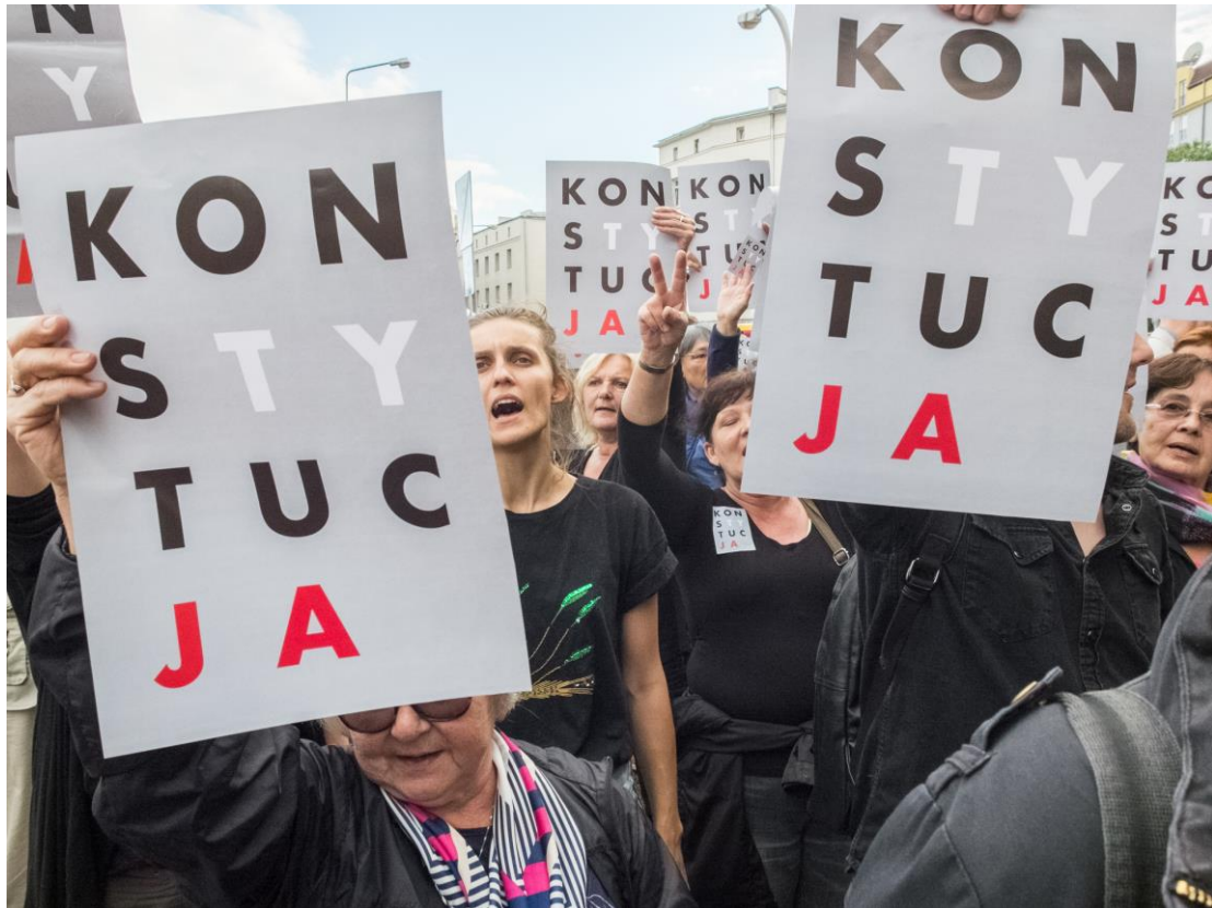
Demonstration against the laws infringing the independence of the judiciary outside the ruling party "Law and Justice" headquarters in Warsaw, 26 July 2017. The placards read: "Constitution".