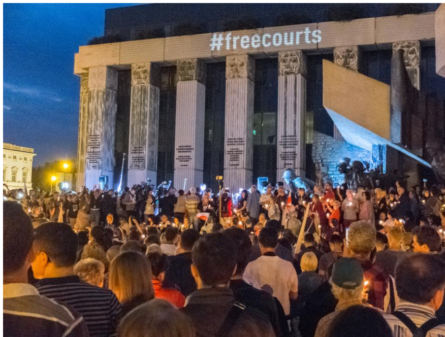
Protest in front of the Supreme Court on 16 July 2017 in Warsaw.

In early hours of 26 April 2019, MPs adopted another amendment to the Law on the Supreme Court. This amendment provides for the discontinuation of the appeal of the three Supreme Court judges who were forced to retire under the previous amendment to the Law on the Supreme Court. 161