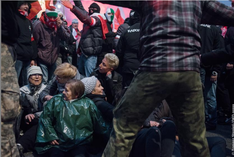
14 women attacked during Independence march protest on 11 November 2017

On 5 December 2017, the police authorities informed Amnesty International in a letter that the police operations on 11 November addressed the situation adequately and within the limits of the law. 225