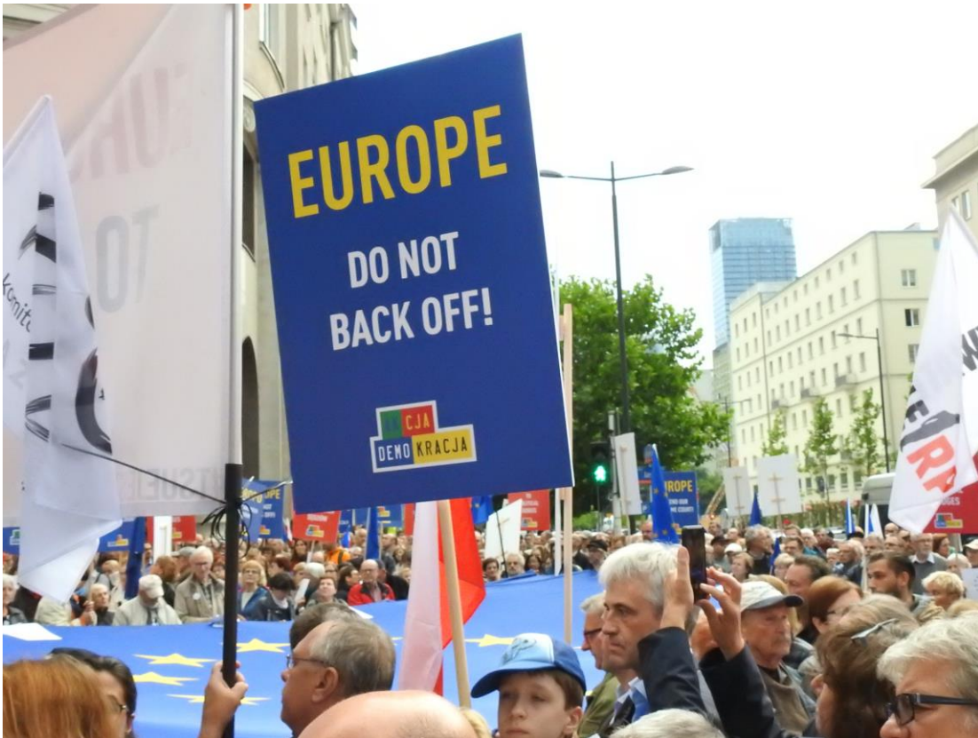
Assembly in front of the European Commission Representation Office in Poland on 25 June 2018, calling on Europe to continue to urge Poland to uphold the rule of law.

Article 19(1) of the Treaty on European Union, read in connection with Article 47 of the Charter of Fundamental Rights of the European Union, requires that member states, including Poland, guarantee the right to an effective remedy before an independent and impartial court. The new disciplinary proceedings characterized by extensive powers of the Minister of Justice, and the special position of the Disciplinary Chamber of the Supreme Court, 173 led the European Commission to a conclusion in April 2019 that Poland does not comply with the EU law. Specifically, the EC considered that the Disciplinary Chamber of the Supreme Court is not an independent body. 174