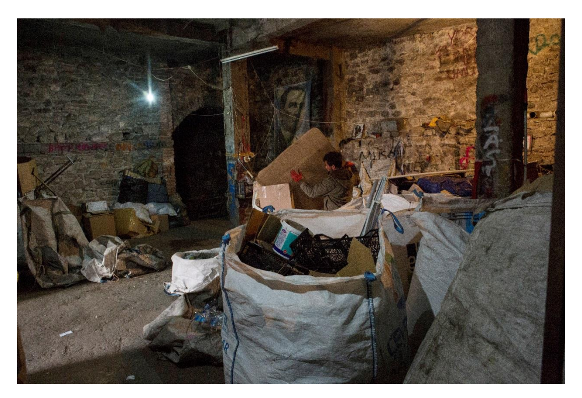
Many Afghan asylum-seekers support themselves in Istanbul by selling recyclable materials they collect from garbage bins, which is later weighed and sorted in depots such as this operation.

Children needing to work to meet the basic needs of their families is a widespread problem, despite this being contrary to Turkey's domestic and international legal obligations. 131 UN agencies report that among Syrian refugees in the country, "child labour is a common phenomenon." <sup>132</sup> In a 2015 survey of over 700 Syrian refugees in Istanbul, the most common reasons for children's non-enrolment in school were that the children needed to work to support the family (26.6%) and that the family could not afford the school fees (20.3%). <sup>133</sup> A Syrian mother of three boys, living in Gaziantep, told Amnesty International that the shrapnel injuries her husband sustained in Syria prevent him from working, and that the entire family of seven survives on the 5-10 Turkish Lira per day (about 1.75 to 3.50 USD) that her nine-year old son earns working at a grocery store. 134 An Iraqi man from Dohuk, living in Istanbul, said that his three children - a daughter aged 18 and two sons aged 17 and 16 - cannot attend school but must work instead. He said: "They must work; otherwise we cannot survive." The 18-year old daughter told Amnesty International that she and her brothers work in a textile factory five days a week, from 8 a.m. until 7:30 p.m., and each make 250 Turkish Lira (about 88 USD) per week. The father said that he was unable to find a job that did not require very long hours, which he is unable to do because he says he is old and tires easily. 135