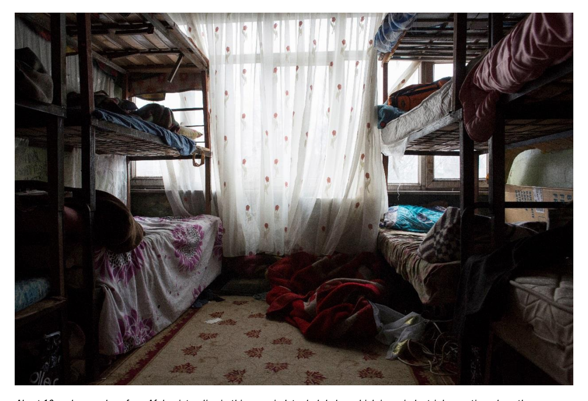
About 12 asylum-seekers from Afghanistan live in this room in Istanbul, below which is an industrial operation where the recyclable materials that they collect from the garbage are weighed and sorted.

This chapter assesses whether Turkey meets the third criterion for effective protection: access to means of subsistence sufficient to maintain an adequate standard of living. With state authorities unable to meet people's basic needs – in particular shelter – combined with the significant barriers that people experience in achieving self-reliance, the reality is that Turkey is failing to provide an environment where asylum-seekers and refugees can be guaranteed the ability to live in dignity.