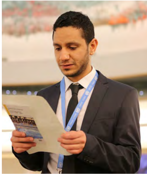
↑ Sayed Ahmed Alwadaei © Moosa Satrawi

The content of the messages varies from defamatory remarks about "links" they are claimed to have to Iran or the Lebanese Shi'a group Hizbullah to threats of rape and death. They have also been targeted through smear campaigns in pro-government newspapers.