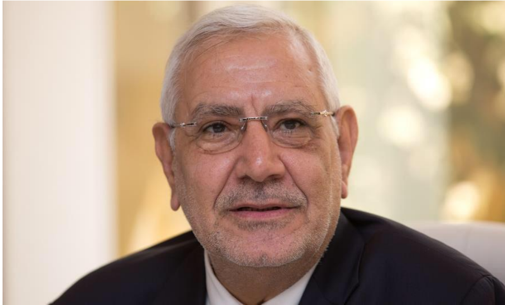
Abdelmoniem Aboufotouh

Former presidential candidate and founder of Misr Al-Qawia party, Abdelmoniem Aboufotouh, aged 69, has been detained since 14 February 2018 over unfounded charges in relation to media interviews. 228 According to credible sources, he has been detained in Mazraet Tora Prison in solitary confinement in a cell measuring 2m x 3m that is hot in summer and cold in winter, and does not have a bed. The prison administration has limited his access to exercise to an alley inside the ward for no more than one hour a day. Sometimes the prison administration allows no exercise time at all. 229