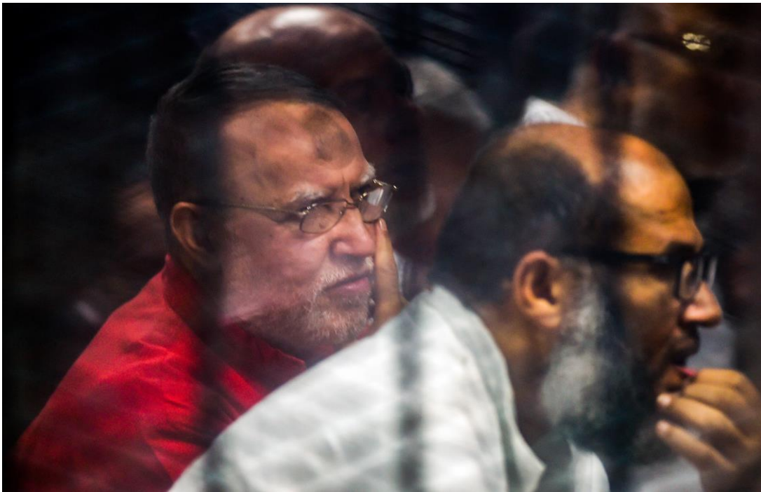
Essam el-Erian

High-profile members of the Muslim Brotherhood are among those who are deliberately denied health care.