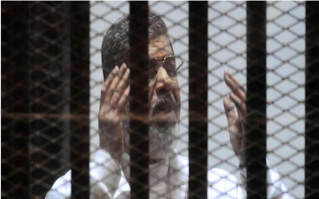
Mohamed Morsi

Those held in prolonged and indefinite solitary confinement, in and of itself amounting to torture, cut off from the outside world in conditions facilitating torture and other ill-treatment, and denied adequate health care are at particular risk of suffering from medical complications and dying in custody (See Chapter 3.5).