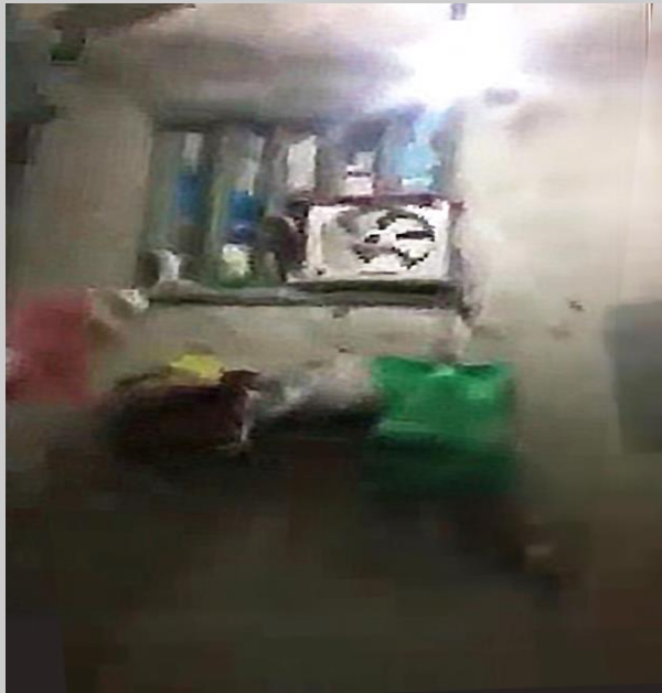
Still taken from video filmed in Al-Aqrab Prison in October 2020 and shared with Amnesty International