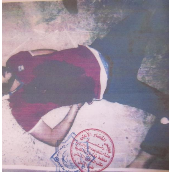
One of the victims of a Shi'a militia abduction.