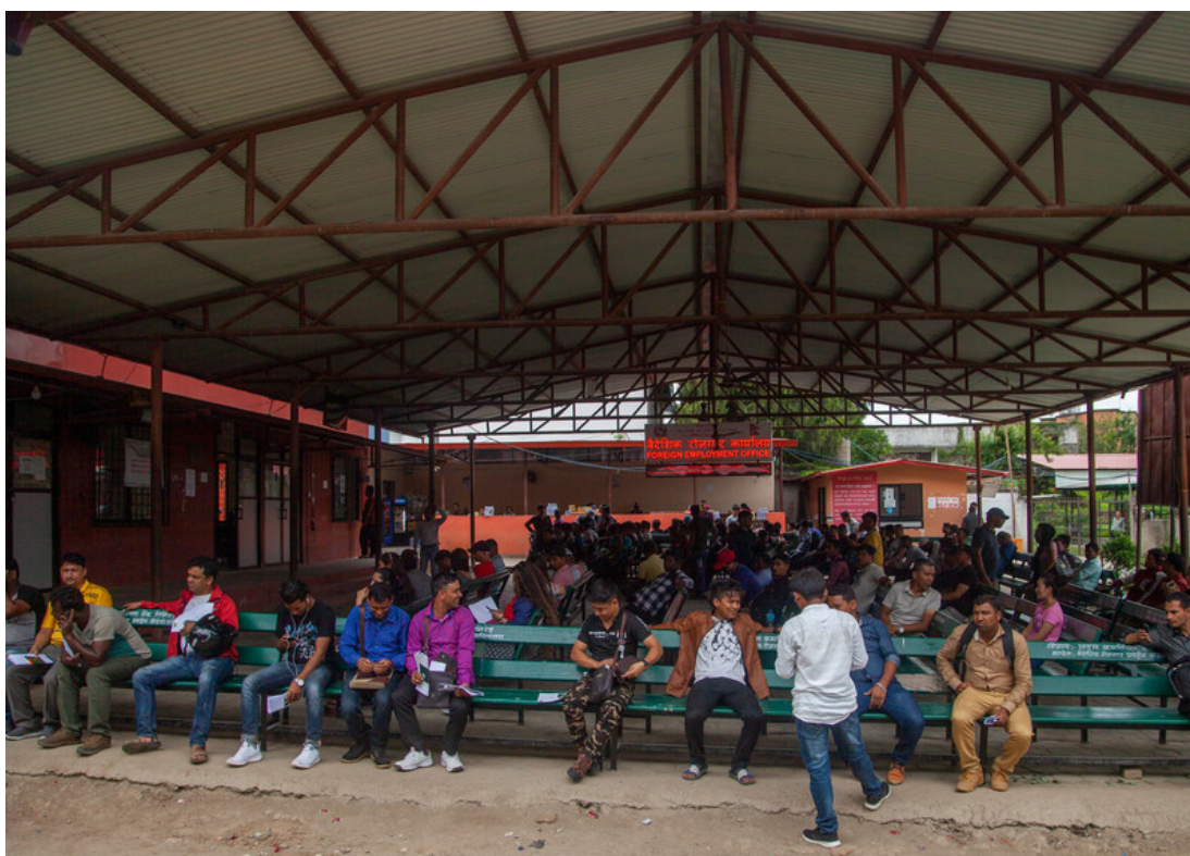
Nepali men wait outside the Foreign Employment Office at Tribhuvan International Airport, in the capital of Nepal, Kathmandu. Many will be prospective migrant workers, bound for the Gulf.

The payment by prospective migrant workers of recruitment fees to secure jobs in Qatar remains rampant, despite Qatar's commitment to tackle the problem. Paying between US$1,000 and US$3,000 in recruitment fees, many workers need months or even years to repay this debt, trapping them in cycles of exploitation and making it difficult for them to challenge or escape abusive employers. Qatar Visa Centres have streamlined the recruitment process in some countries but are not set up to effectively tackle the payment of illegal recruitment fees. The government must work with origin countries to combat such practice and reimburse migrant workers who paid for their jobs in Qatar.