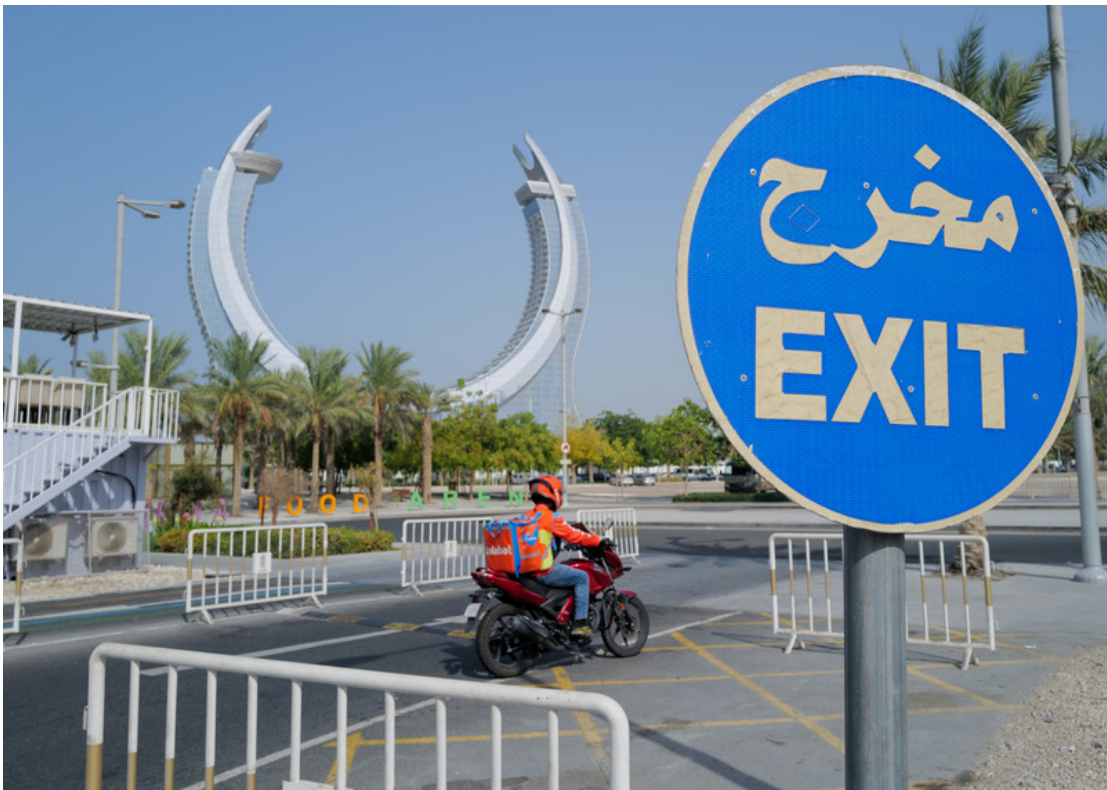
A food delivery worker leaves the Marina Food Area in Lusail City in Doha Qatar, 15 June 2022.

Crucial changes to the inherently abusive kafala sponsorship system mean the vast majority of migrant workers are now legally able to leave the country and change jobs without their employer's permission. While many workers appear to have been able to benefit from these changes in practice, key elements of the system remain in place and continue to trap many migrant workers in exploitative situations, at the mercy of abusive employers. Qatar must remove all these remaining legal and practical barriers, such as the charge of 'absconding', and penalize employers who use such practices as tools of control.