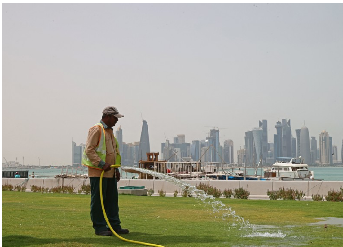
A worker waters the grass in the Qatari capital Doha, on May 5, 2022.

Many migrant workers in Qatar continue to be subjected by their employers to conditions that amount to forced labour, including those in private security or domestic work. This includes workers being repeatedly denied their rest days and forced to work under the threat of financial penalties, having their salaries arbitrarily deducted and sometimes their passports confiscated. Yet despite the severity of this abuse the government continues to take insufficient action. Qatar should train inspectors to detect forced labour practices, investigate such cases to hold abusive employers to account, and remedy victims.