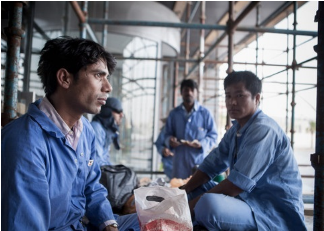
Migrant workers pause to eat at the Sports City area of Doha, Qatar.

A new minimum wage came into force in 2020. Nonetheless, wages in Qatar not only remain low for many migrant workers but are sometimes delayed or not paid at all. This has severe consequences for workers and their families, preventing them from escaping debts incurred from paying recruitment fees, and often trapping them in cycles of abuse and exploitation. A number of initiatives since 2015 have attempted to identify and prevent wage theft, but the issue continues on a significant scale. The authorities should increase and review the minimum wage, strengthen wage protection, and outlaw discriminatory practices of paying different salaries to different nationalities.