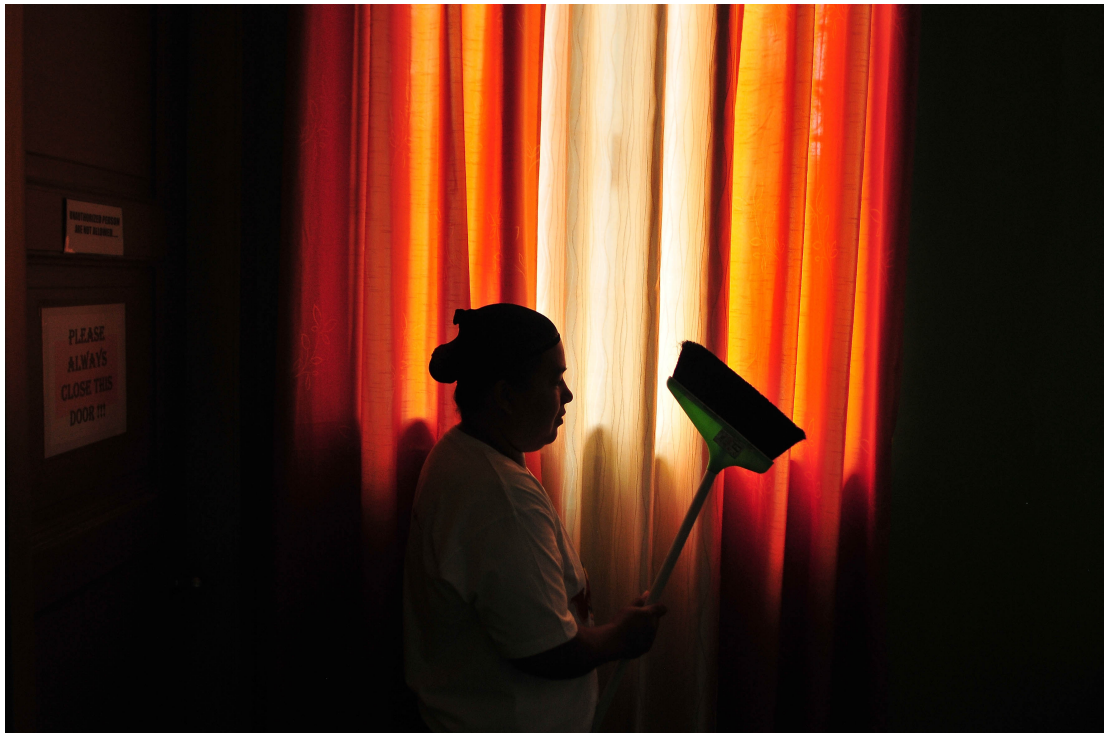
Filipino job applicants undergo an intensive course on housekeeping on September 06, 2013 in Manila, Philippines.

In 2017 the government introduced a new law meant to protect domestic workers. Nonetheless, five years later, Qatar has still not taken effective action to meaningfully tackling their serious and widespread abuse. As a result, this highly vulnerable group – many of whom are women – continue to face some of the harshest working conditions and most serious mistreatment in Qatar, including verbal, physical and sexual assault and denial of rest time. Qatar must immediately increase inspections and sanction abusive employers, offer domestic workers equal legal protection by bringing them under the scope of the Labour Law, and ensure they have access to a safe refuge.