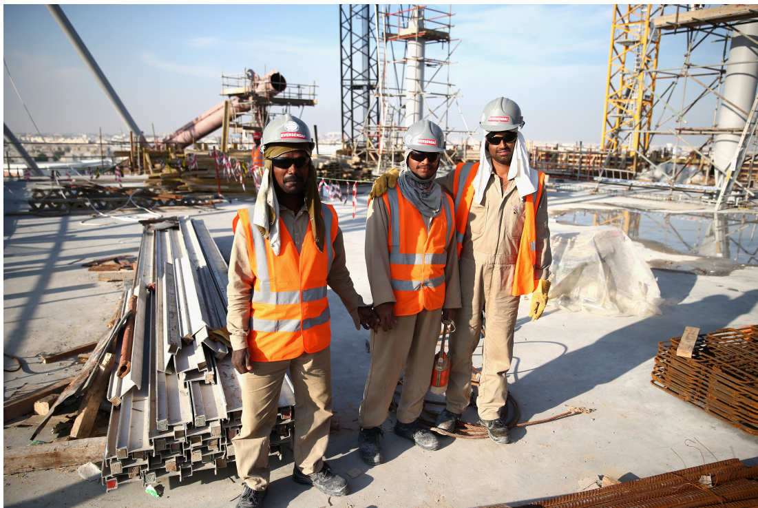
Construction workers in Doha, Qatar, 30 December 2015.

Migrant workers are still unable to form and join trade unions in Qatar, and Joint Committees formed and led by employers, cover only 2% of the workforce. While providing workers with some representation, these remain beset with serious flaws, lacking mechanisms for collective bargaining and failing to provide workers with crucial legal protections. The government must respect its international obligations and allow migrant workers to form and join independent trade unions.