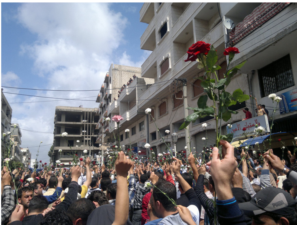
A peaceful pro-reform demonstration in Baniyas, a coastal town north of Damascus

Since the end of 2010, millions of people across the Middle East and North Africa region have taken to the streets to call for greater rights and freedom and the replacement of authoritarian regimes. In Syria, ruled with an iron hand by Hafez al-Assad from 1971 to 2000 and since then by his son Bashar al-Assad, small demonstrations were held in February but evolved into mass protests only in mid-March. Since then, the protests have spread nationwide on an unprecedented scale and with a momentum that shows no sign of abating despite severe government repression which has seen many hundreds of people killed.