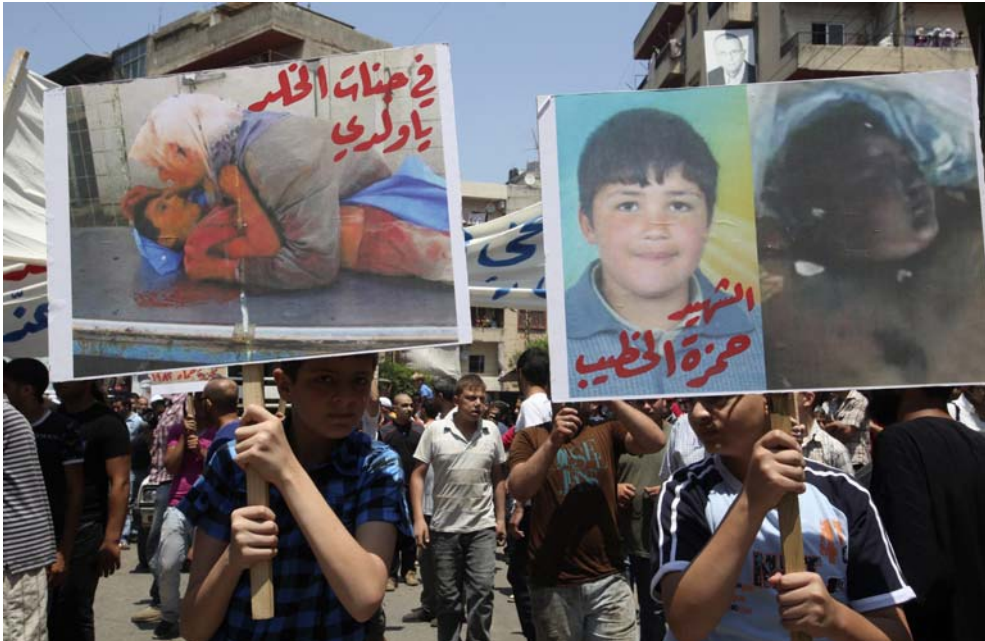
Protesters hold placards of Hamza Ali al-Khateeb during a demonstration to express solidarity with Syria's anti-government protesters, in Tripoli, northern Lebanon