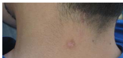
A burn mark visible on the neck of a 20-year-old former detainee

In some cases it is reported that cigarettes have been stubbed out on detainees' bodies. On at least one bus in which detainees had been held in the Homs area on 18 May, soldiers counted those arrested by stabbing a lit cigarette on the back of the detainees' necks. An Amnesty International delegate saw the