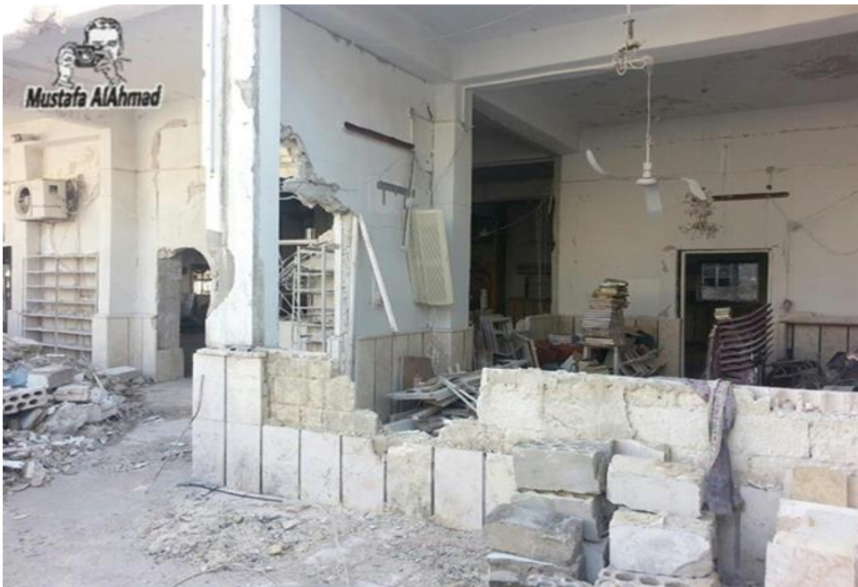
Image of the Omar Bin al-Khattab mosque in Jisr al-Shughour, which was hit by an air strike on 1 October 2015 © Mustafa al-Ahmad.

On 1 October 2015 a Russian Ministry of Defence spokesperson stated that Russia's air force had targeted IS infrastructure and had destroyed one such command post in Jisr al-Shughour. 23 On 30 October, following the emergence of reports and images showing that the Omar Bin al-Khattab mosque had been destroyed, Colonel-General Andrey Kartapolov stated that such information was a "hoax" and presented a satellite image claiming that the mosque was still intact. 24 However, the satellite image showed a different mosque, not the one destroyed in the attack.