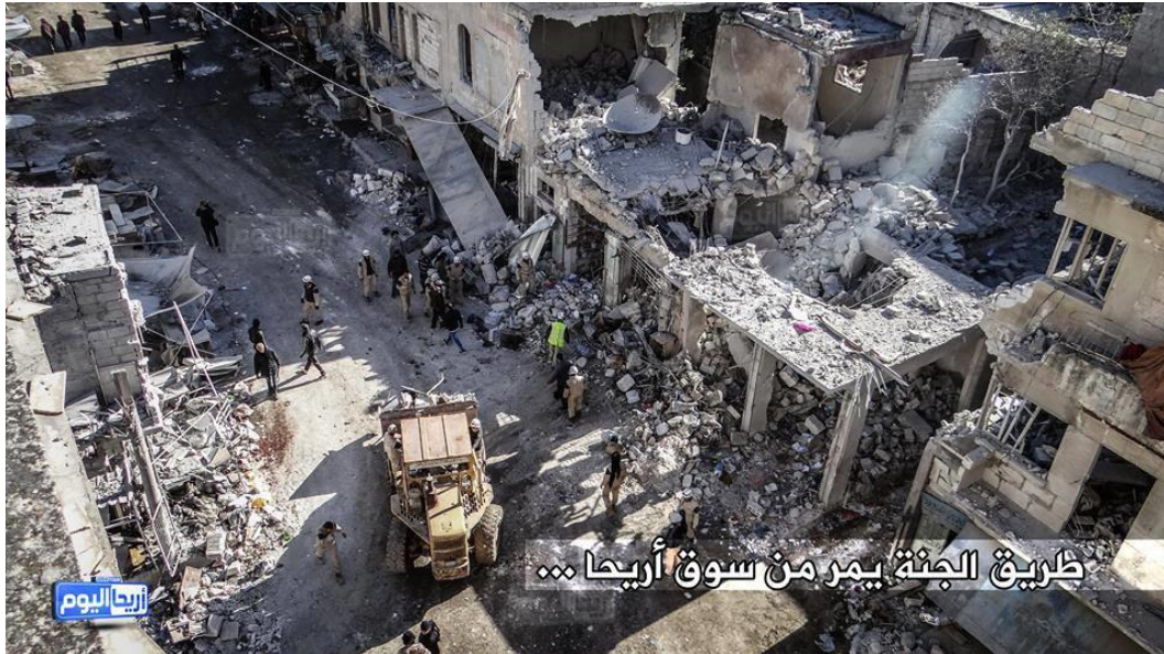
Damage to Ariha market area after 29 November 2015 air strike © Muhammad Qurabi al-Ghazal.

A second activist, “Abu Diab” 39 , told Amnesty International: