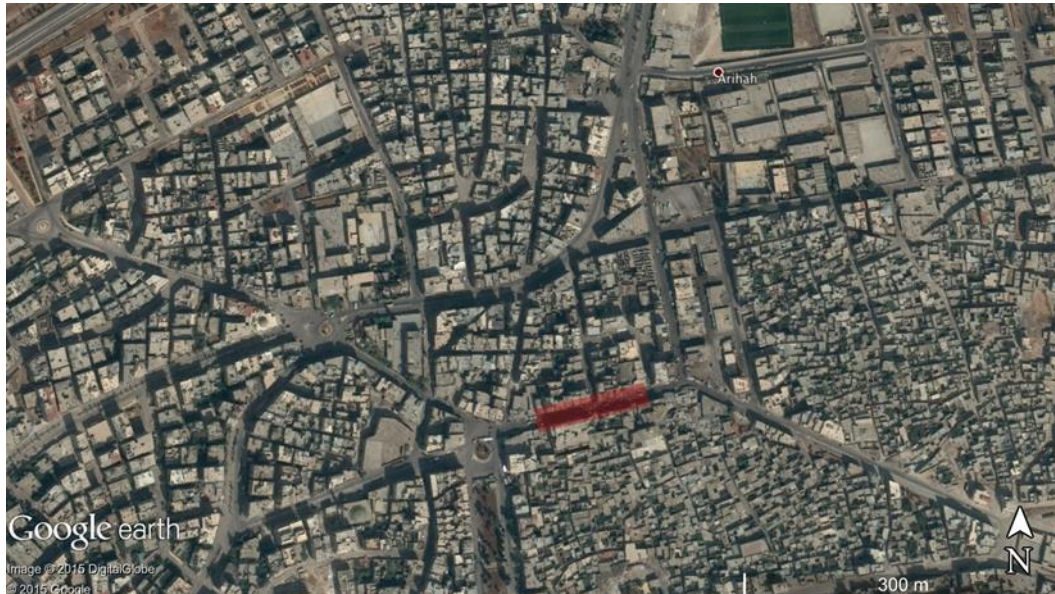
Impact location (in red) of a suspected Russian air strike on a market in Ariha on 29 November 2015. Imagery date: 23 September 2014. Coordinates: 35.813144, 36.610613

Amnesty International is not aware of any statement by the Russian authorities acknowledging or denying responsibility for this attack despite several reports claiming that Russian forces were behind it, including one by Human Rights Watch. 34