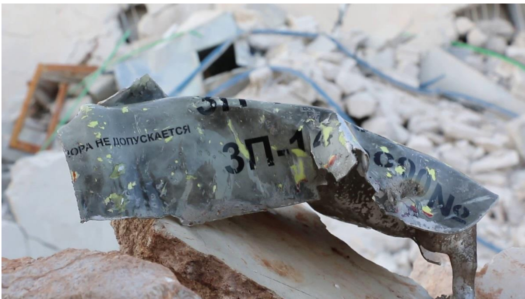
Remnant of Russian Kalibr cruise missile.