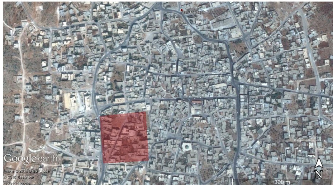
Approximate impact location (in red) of suspected Russian cruise missile strike in Darat Izza on 7 October 2015. Imagery date: 25 August 2014. Coordinates: 36.281051, 36.849916

Five civilians, including two women, four of whose names have been obtained by Amnesty International, were killed on 7 October 2015 when a suspected Russian sea-launched cruise missile struck residential buildings in Darat Izza, Aleppo governorate. More than six residential buildings with at least a dozen homes were destroyed by the attack according to an eyewitness interviewed by Amnesty International as well as reports of human rights organizations. Information provided by local human rights defenders, Syrian human rights organizations and video clips of the aftermath of the attack reviewed by Amnesty International indicated that there was widespread destruction and damage but no military casualties nor any armed presence in the town. 25