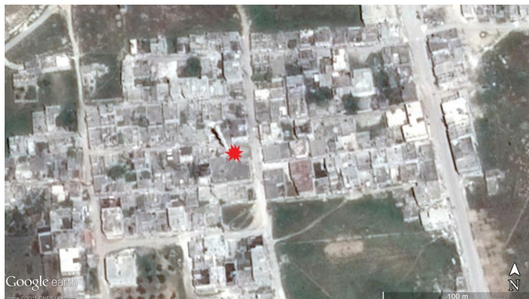
Location of suspected Russian air strike on the Omar Bin al-Khattab mosque in Jisr al-Shughour on 1 October 2015. Imagery date: 14 April 2014. Coordinates: 35.821100, 36.322129

Also on 1 October 2015, at around 11am, a suspected Russian air strike on the Omar Bin al-Khattab mosque in central Jisr al-Shughour, Idlib governorate, killed one civilian immediately, mortally wounded another and injured six more; Amnesty International has obtained the names of all eight individuals. 18 According to one eyewitness interviewed by Amnesty International, there were no military casualties and no military targets in the vicinity, with the nearest checkpoint some 500m away. 19 Reports by Syrian human rights organizations give similar accounts. 20