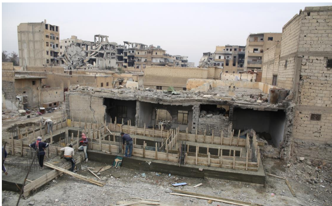
Workmen are rebuilding the Fayad family home, which was destroyed in a Coalition air strike on 12 October 2017 in Raqqa.

A plane came and targeted the taps as there was a crowd there. The crowd was mixed between civilians and IS. Water was not available at the well every day and when it was available it would only come on for two hours at a time – from 8-10am and then again between 3-4pm. That's why there was a crowd at the well. When I came to the scene I found my son with a shrapnel wound in his shoulder. I took him to the National Hospital and waited two hours while he bled to death. They [IS] told us there were no doctors and no one with expertise. 74