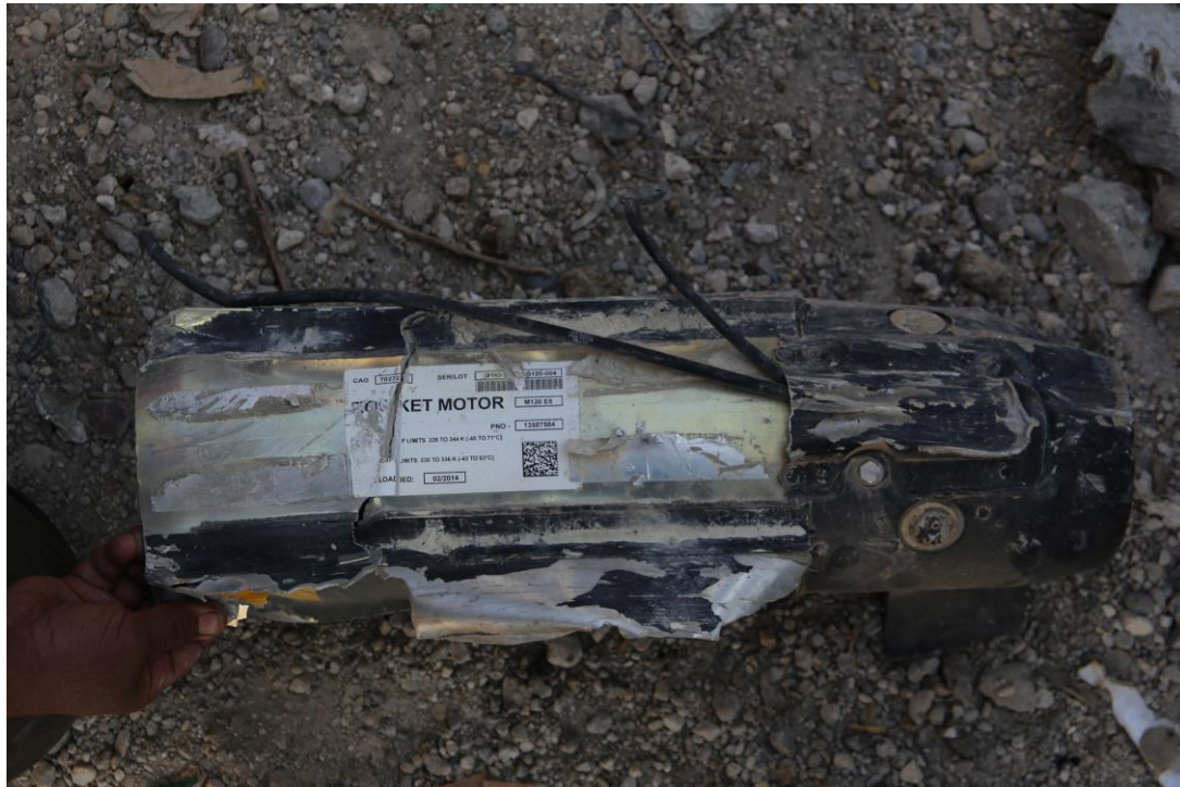
Fragment of the motor of a US-made AGM-114 Hellfire missile recovered among the ruins of the Aswad family building, destroyed in a Coalition strike which killed eight civilians on 28 June 2017.