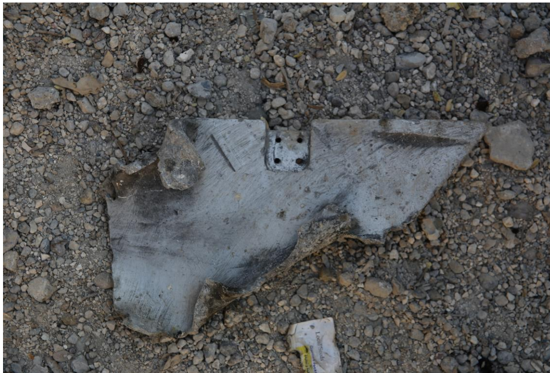
Fragment of a fin from a US-designed Joint Direct Attack Munition (JDAM), a GPS-guided air-delivered bomb, recovered among the ruins of the Aswad family building, destroyed in a Coalition strike which killed eight civilians on 28 June 2017.