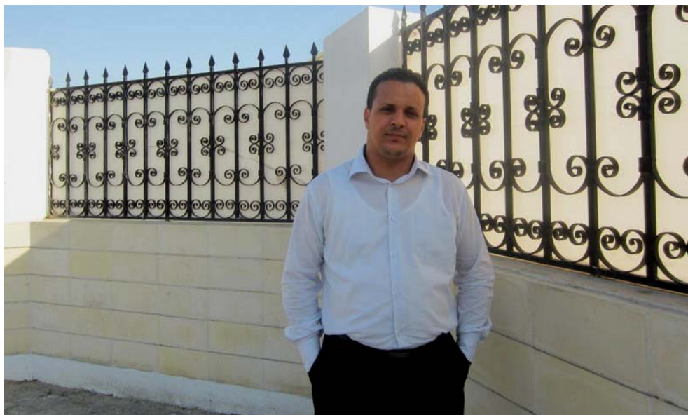
Ayoub Massoudi © Amnesty International