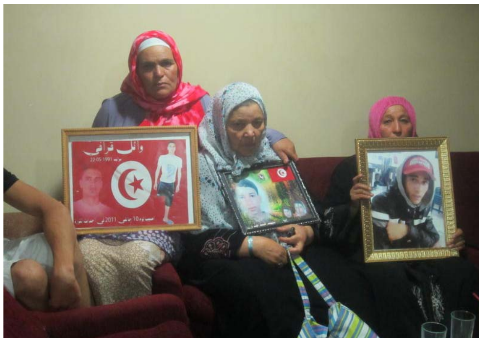
Mothers of those injured or killed during the 2011 uprisings in Kasserine

The mass demonstrations in December 2010 and January 2011 that led to Ben Ali's flight from Tunisia on 14 January 2011 were met by serious human rights violations by the security forces. According to the National Fact Finding Commission on Abuses Committed from December 17, 2010 to the End of its Mandate (Commission nationale d'établissement des faits sur les dépassements commis entre le 17 décembre 2010 et la fin de son mandat), headed by Taoufiq Bouderbala and mandated to investigate human rights violations during the uprisings, 338 people were killed in the weeks before and the days immediately after Ben Ali's departure, and more than 2,000 people were injured, some seriously.