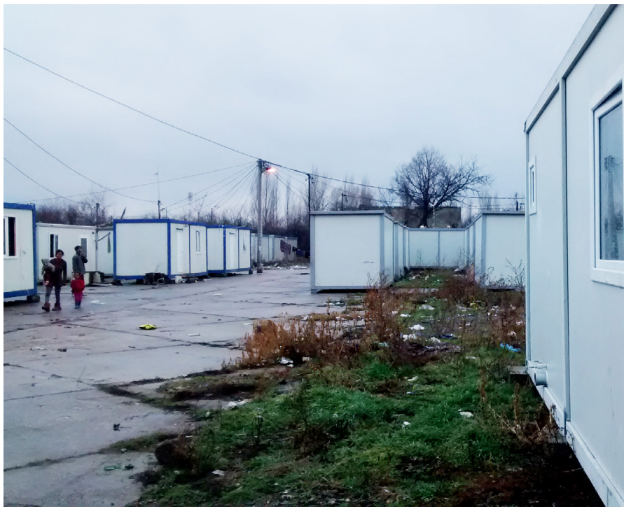
(ABOVE) Container settlement at Makiš, February 2015

Amnesty International requested information on how much of the EC's money had already been spent at a meeting with the EU Delegation in Serbia in early February; the organization wrote to the EU Delegation in Serbia on 5 March 2015 to request the same information, but had not yet received a reply.