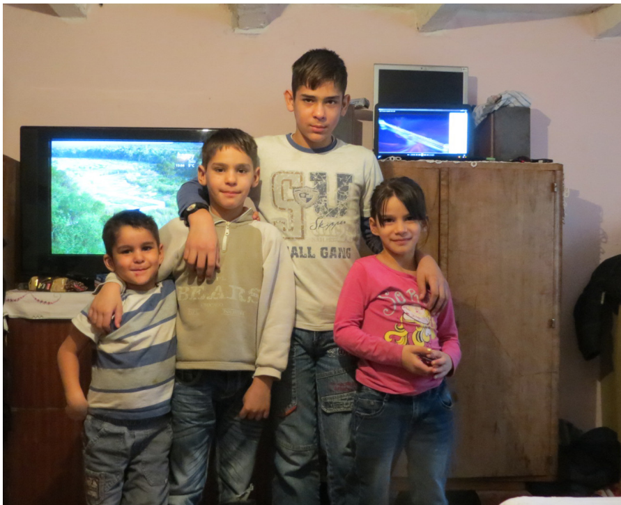
(OPPOSITE PAGE AND ABOVE) Village houses in Bačko Petrovo Selo, February 2015