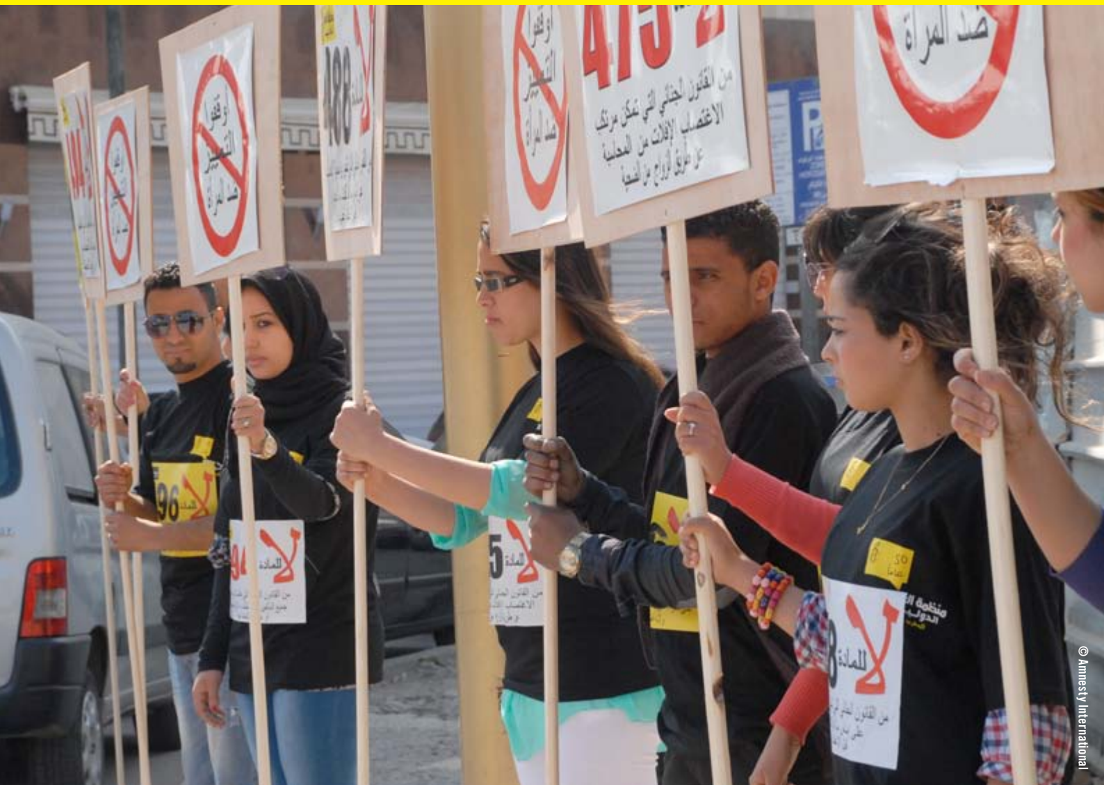
Image: Amnesty International activists in Morocco protest against Article 475 of the Penal Code and other provisions that discriminate against women, May 2013. Until its amendment in January 2014, Article 475 allowed rapists to walk free if they married their teenage victims (see inside, page 10).

Amnesty International is a global movement of more than 3 million supporters, members and activists in more than 150 countries and territories who campaign to end grave abuses of human rights.