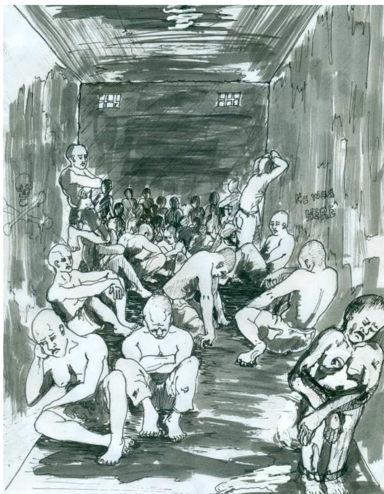
Figure 11 - An artist's drawing depicting Mustafa's account. © Chijioke Ugwu Clement

Conditions in detention facilities in Damaturu are also poor, and appear to amount to ill-treatment. Most of the detainees are kept at 'Sector Alpha' which consists of shops that were deserted and are now being used to detain people – there are no toilets or proper ventilation. Consistent accounts recorded by Amnesty International suggest that up to 50-70 people are put in cells that can only fit about five people. Conditions are marginally better at the Presidential Lodge (“guardroom”) also in Damaturu where detainees are kept in rooms that have been created by dividing a former squash court. About 15-20 people are kept in a room of 15 by 20 feet, but detainees are allowed to move around in the corridors during the day. There are also some toilets for common use at the end of the corridor.