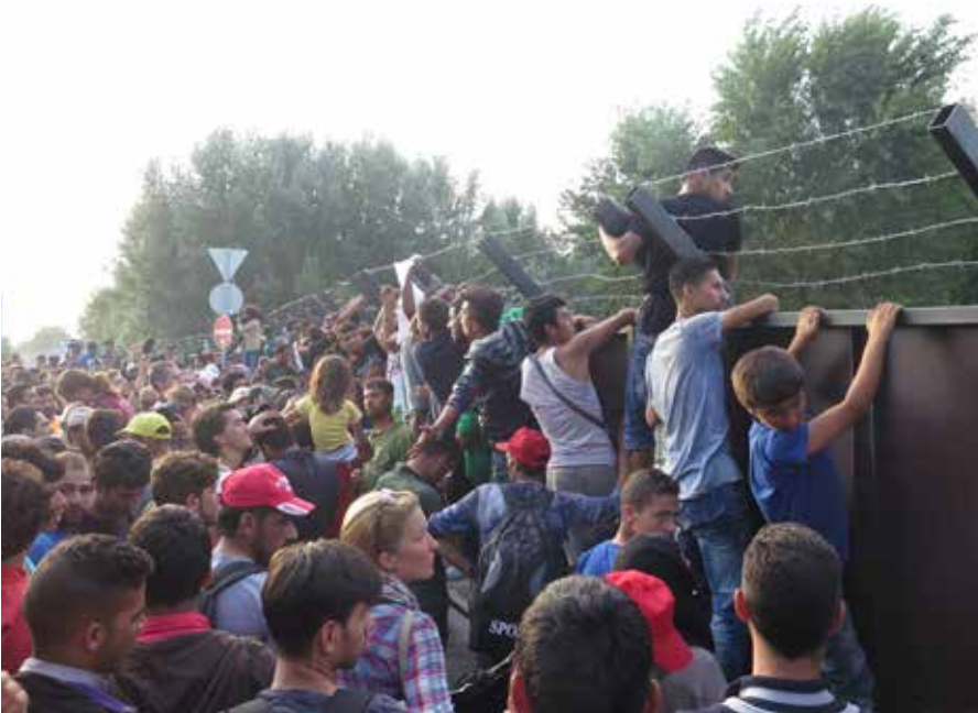
Left: Refugees behind a fence at the Hungarian border with Serbia, near the Serbian town of Horgos, on 16 September 2015.

On 15 September, the Hungarian government completed the construction of a fence on the border with Serbia and made it an offence to enter Hungary through it. Following the effective sealing off of the border with Serbia, refugees and migrants started entering Hungary through the border with Croatia.