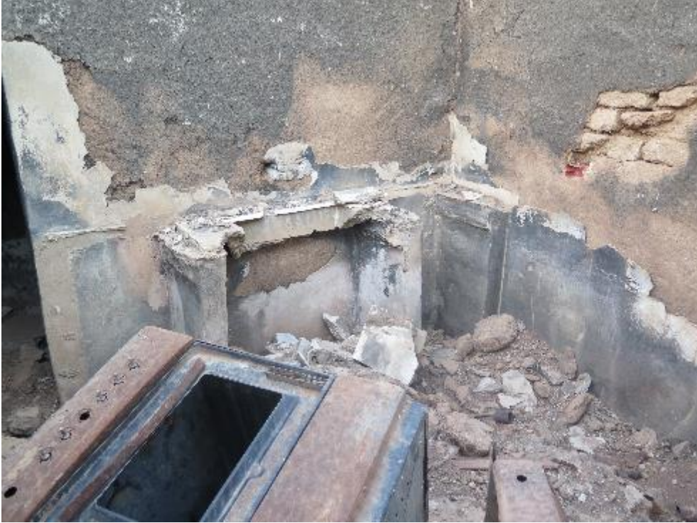
A room destroyed by fire in the home of Bassma Mohamed al-Bilal's in-laws in Tel Diyab.