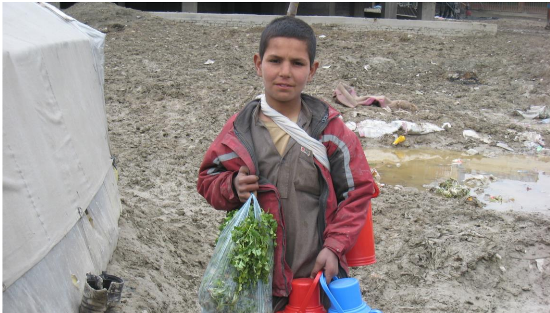
A 14-year-old boy in Charrahi Qambar settlement in Kabul, November 2015

Additionally, public hospitals only provide vaccinations and contraceptives free of charge, while other medicines must be bought from private clinics or pharmacies. While affording medicines is a struggle for many Afghans, it can be particularly difficult for displaced people who lack regular incomes and are often economically worse off than other urban poor (see more in section 4.5: Employment). Some displaced people reported having debts of several thousand Afs at private hospitals or pharmacies to buy medicines which they could not afford to pay back. One 55-year-old man in Naderabad camp in Mazar-e-Sharif said: