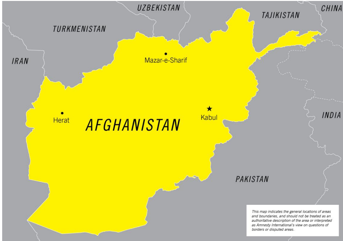
Map of Afghanistan, with the Herat, Kabul and Mazar-e-Sharif marked – the towns visited by Amnesty International for this report.