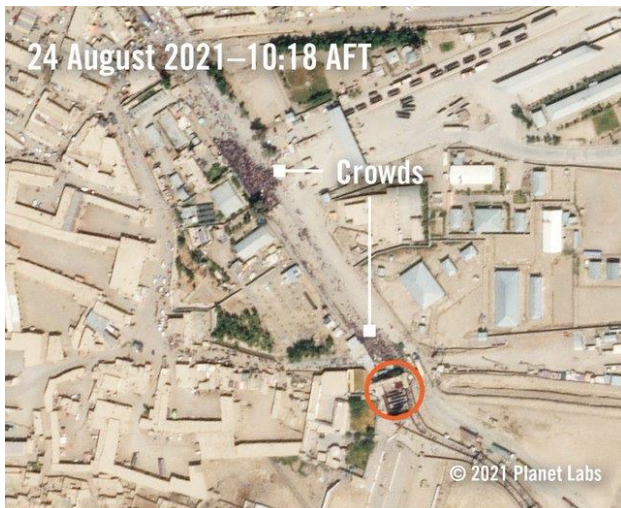
Spin Boldak-Chaman crossing. 24 August 2021.

For instance, according to UNHCR, Pakistan closed its border with Afghanistan, except for people in need of medical treatment, or with a proof of residency. 186 Despite that, at the Spin Boldak-Chaman border crossing in Kandahar, people with Tazkira (National ID Card) from Kandahar, Helmand, Zabul, and Uruzgan were allowed to cross the border. Between 2 August 2021 and 24 August 2021, the crowds attempting to cross the border to Pakistan via the Spin Boldak crossing increased exponentially, as documented via satellite imagery (see above) and video analysed by Amnesty International.