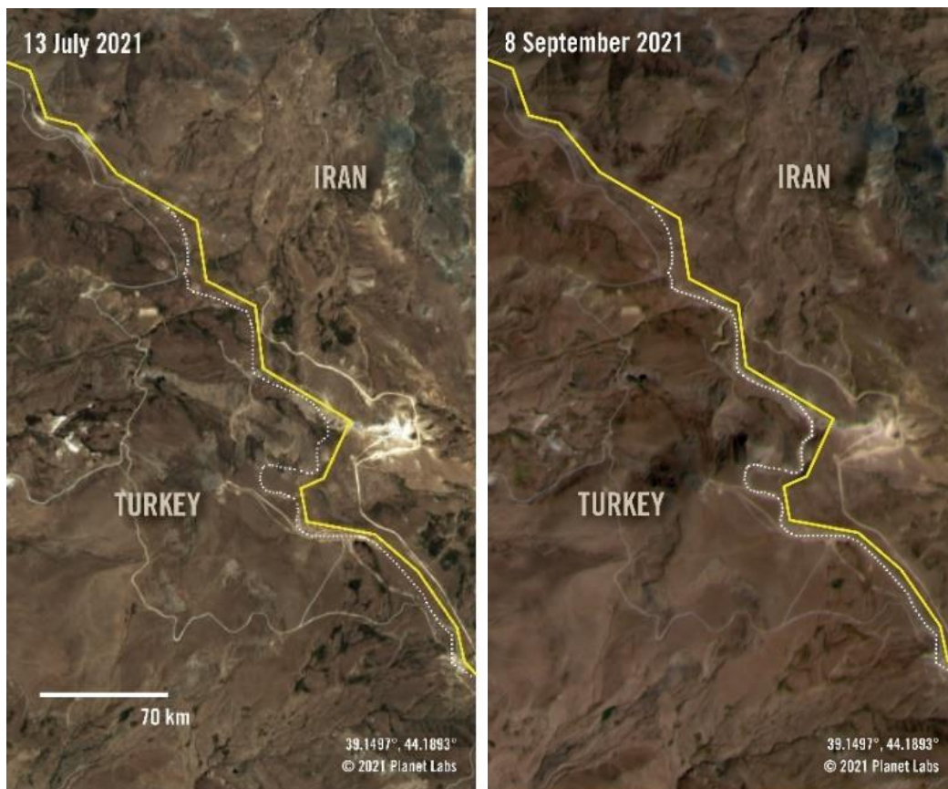
New Construction along the Turkey-Iran border between 13 July and 8 September, 2021. Planet Labs.

An additional obstacle for Afghan people seeking to flee abroad seems to be the lack of passports. According to the Afghan researcher who spoke to Amnesty International, Afghan authorities currently do not deliver passports and Afghan people are not allowed to cross border without passports. 199