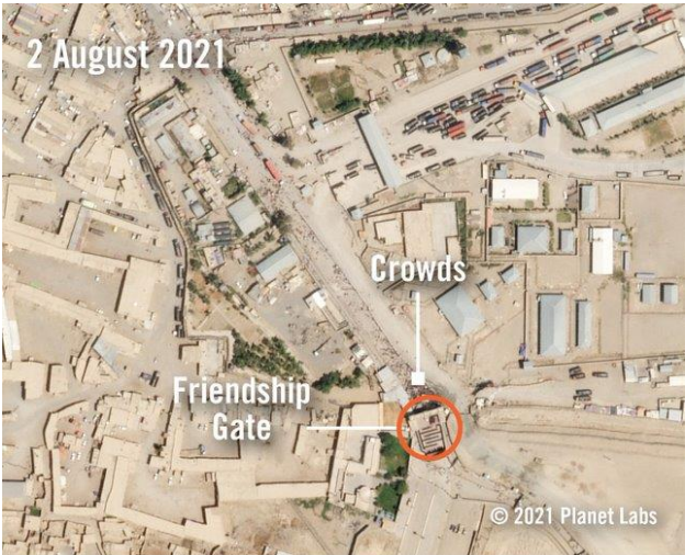
Spin Boldak border crossing. 2 August 2021. Planet Labs.

Afghans who tried to cross land borders, an Afghan researcher, and the UN agency in charge of refugees (UNHCR), all told Amnesty International that the Afghan people were also prevented from seeking refuge abroad because most of the land border crossings were closed for asylum seekers. 185